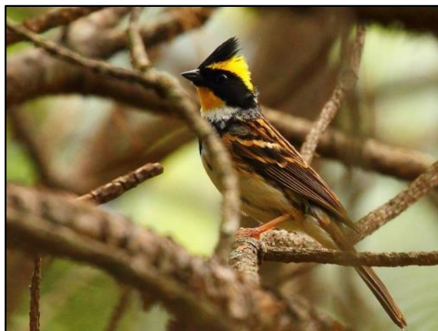
Yellow-throated Bunting

Although the birding in Tangjiahe's beautiful and pristine forests was challenging and slow-going, we did still find a varied assortment of great birds, top of the list being the magnificent Golden Pheasant, of which we were ridiculously fortunate to encounter a total of eleven of these usually scarce and outrageously stunning pheasants during our