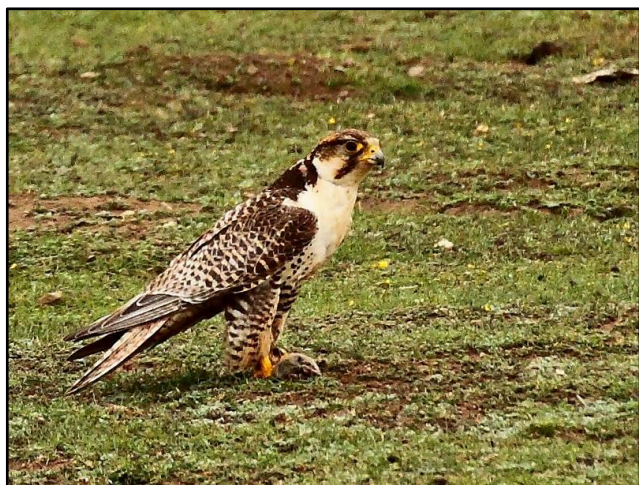
Saker Falcon by Glen Valentine

morning, as our very early morning departure was quickly brought to an abrupt halt when we came across a landslide that covered the road near the edge of town. We waited about an hour before the debris was finally moved and traffic could continue. Feeling rather devastated by this blow and almost certain that any chance that we now had of finding the very rare and endemic Pere David's Owl before dawn was dashed, we continued our way up the pass to the top.