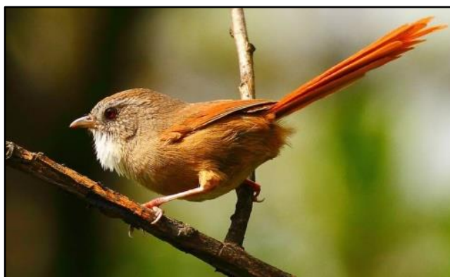
Rufous-tailed Babbler (Moupinia) by Glen Valentine

In the late morning, we departed Cangshan and drove back into Dali, stopping at a roadside restaurant for lunch, and then began the long drive south into the Gaoligong Mountains. Our only birding stop was a short one at the edge of a coffee plantation in the foothills, but it was already late in the afternoon and almost dusk so we did not pick up much more than a few Long-tailed Shrikes and three fly-over Grey Treepies. We finally arrived at our comfortable, family-run guest house in the early evening and settled in for the next three nights.