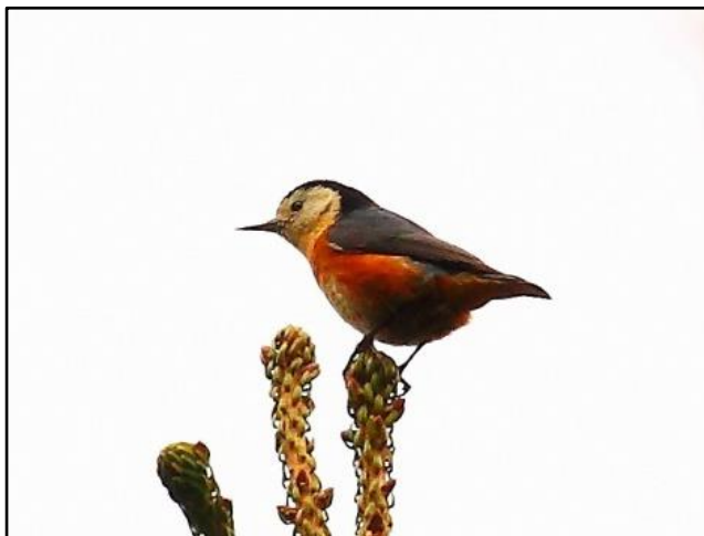
Pzrevalski's Nuthatch

In the late morning, we departed the Baxi Valley for a lunch break back in Ruorgai and thereafter drove north of town, towards the Flower Lake Wetland