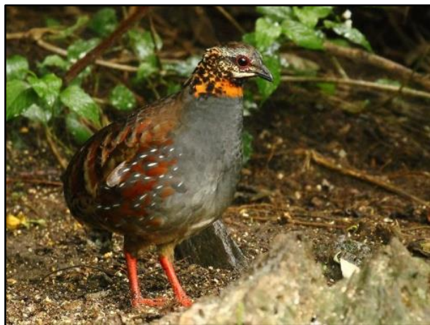
Rufous-throated Partridge by Glen Valentine

We had two full days to enjoy the wonderful, mid-altitude broad-leaved forest at Gaoligongshan. We spent a fair amount of our time along the main track up into the beautiful, tall, dense broad-leaved forest that cloaks the mountains in this great birding area, and also spent some time at the very productive