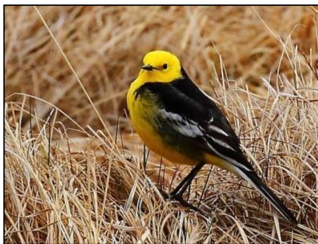
Citrine (Tibetan) Wagtail

After lunch and a leg-rest at the centrally-located park headquarters, we continued birding down the Jiuzhai Valley and the reeds and forest around Reed Lake, where we managed to find the localised Spectacled Parrotbill, as well as Martens's and Bianchi's Warblers, White-winged Grosbeak and the scarce, unobtrusive and endemic Slaty Bunting. This evening we enjoyed some much appreciated and delicious pizza from a local pizzeria, which made a welcome change to the tasty but fairly monotonous Sichuan cuisine that we'd become well-acquainted with over the past two weeks.