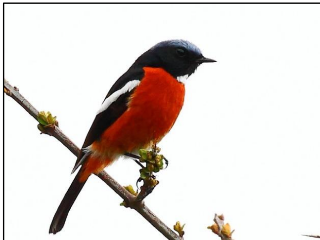
White-throated Redstarts by Glen Valentine

elevation, and then birding downhill along the narrow road that meanders its way through the tall, pristine coniferous forest that covers the surrounding hills and mountains. We were after a number of very special species here, and although we had to work hard and deal with more rain and snow, we managed to find an incredible selection of fantastic, rare and endemic birds.