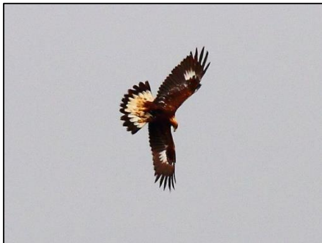
Golden Eagle

same area we added Plain (Pere David's) Laughingthrush. A little further on, we began finding our first Black-necked Cranes of the trip and by the end of the day, we'd counted at least 45 of these remarkable and stately birds! Ruddy Shelducks and Common Mergansers occupied the crystal clear and boulder-strewn rivers, along with Pacific Golden Plover and Common Redshank. Other notable species encountered along today's drive included Salim Ali's Swift, Little Owl, Daurian Jackdaw, Eurasian