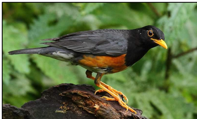
Black-breasted Thrush by Glen Valentine

We began our birding escapade through China in Sichuan's capital city, Chengdu. A very clean, modern and well-situated city with superb infrastructure, this made for the perfect base from where to begin and end both the extension and main tour. After gathering for a delicious dinner, cold beer and red wine at a nearby restaurant, we met up with our excellent local guide and my good friend, Steven, to begin our pre-tour extension of Yunnan.