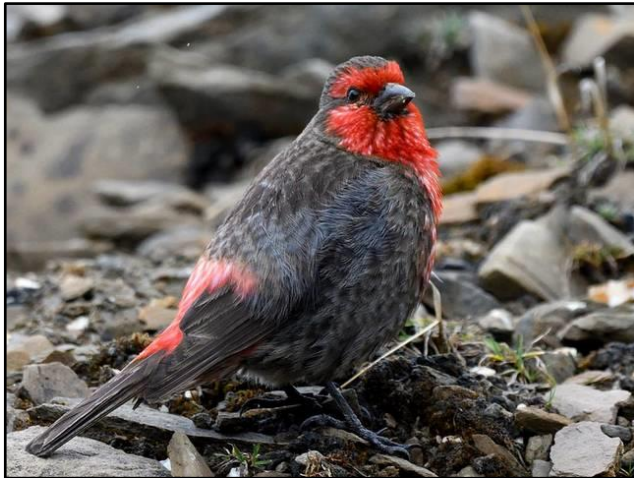
Red-fronted Rosefinch by Rich Lindie

When the rainy and overcast weather did eventually clear for an hour or two, we were heralded by several raptor species that included Bearded, Himalayan and Cinereous Vultures and Upland Buzzard.