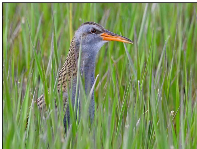
Brown-cheeked Rail

Eared Pheasant, and we also added Northern Goshawk, a superb male White-bellied Redstart, a stunning male Siberian Rubythroat and some exciting and rarely seen mammals, such as Hog Badger and Chinese Serow.