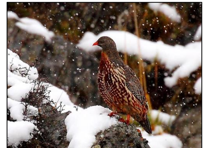
Snow Partridge by Glen Valentine

Our full day in this area saw us heading up to the top of Mengbishan, at just over 4,000 metres in