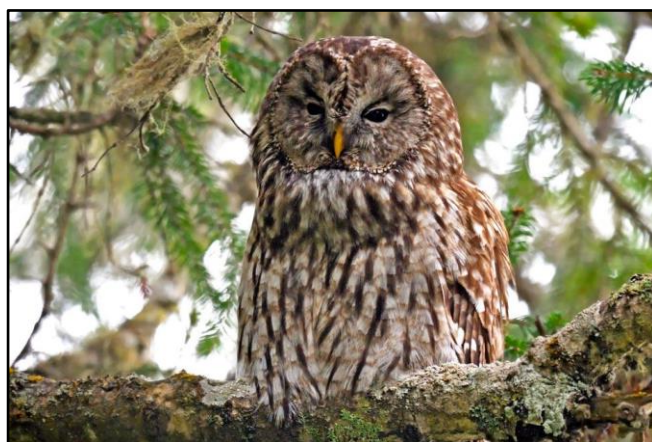
Pere David's Owl by Rich Lindie

What an amazing morning it had been, and it was then time to begin our long drive through to Tangjiahe. Our drive took us over the lofty Big Snowy Mountain Pass but, sadly, the dense cloud and fog that enveloped the mountains totally obstructed what would have been incredible mountain scenery on a clear day. We then wound our way down through some beautiful, mid-altitude broad-leaved evergreen forest back into the lowlands, where we made a few brief stops for ice cream and Red-billed Starlings. In the late afternoon, we climbed up to the Tangjiahe Reserve entrance and drove the final stretch to our comfortable accommodation deep inside the park. Our only stop along the way was for a herd of Golden Takin that fed on a grassy slope at the edge of the road. We