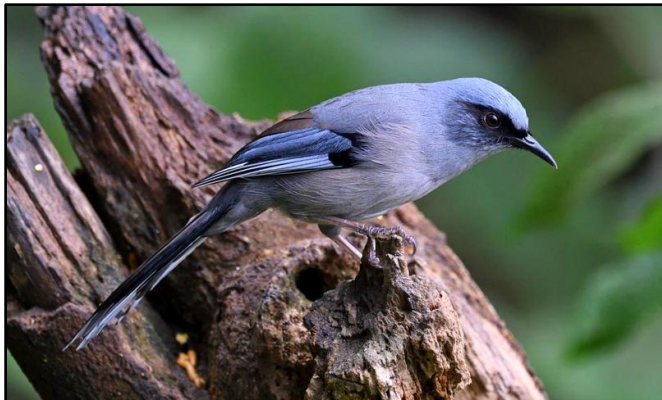
Beautiful Sibia by Rich Lindie

The provinces of Yunnan and Sichuan certainly offer some of the best birding in all of China and, quite simply, in Asia as a whole. Rockjumper's 2017 comprehensive Sichuan birding tour and pre-tour extension of Yunnan was, as 2016's trip, a mammoth success. Birding our way through the picturesque mountains and landscapes of these two very interesting provinces was an absolute pleasure. The birding