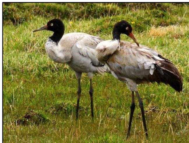
Black-necked Cranes by Glen Valentine

From Maerkang, we wound our way up through the mountains further west, and arrived at a small village near the edge of the Tibetan Plateau in the early morning, where we pulled in for a scrumptious and well-received dumpling and noodle breakfast at a road-side restaurant. Well-watered and fed, we climbed the last few kilometres onto the Plateau and soon pulled over at our first scheduled birding stop of the morning. Here we quickly found the delightful and colourful White-browed Tit-Warbler, as well as the scarce and endemic White-browed Tit.