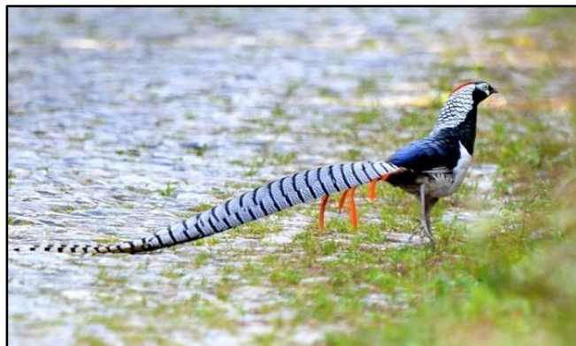
Lady Amherst's Pheasant

Brown-breasted and Mountain Bulbuls, Chinese Blue Flycatcher, White-tailed Robin, Ultramarine Flycatcher and the localised Black-headed Greenfinch.