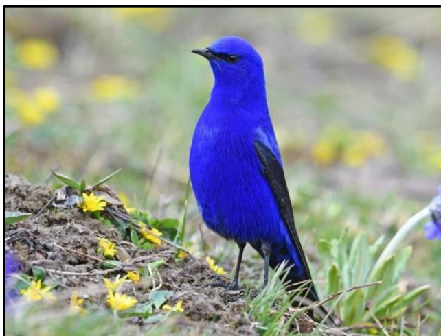
Grandala by Rich Lindie

The middle elevations of Balangshan, at and around the treeline, are indeed pheasant heaven, and during our time in this area, we were fortunate to encounter Blood Pheasant, a gorgeous male Chinese Monal, a very welcome pair of White Eared Pheasants, three Temminck's Tragopans and an incredible six Koklass Pheasants. We also heard the enticing calls of a male Golden Pheasant, but this magical pheasant would have to wait for later in the trip.