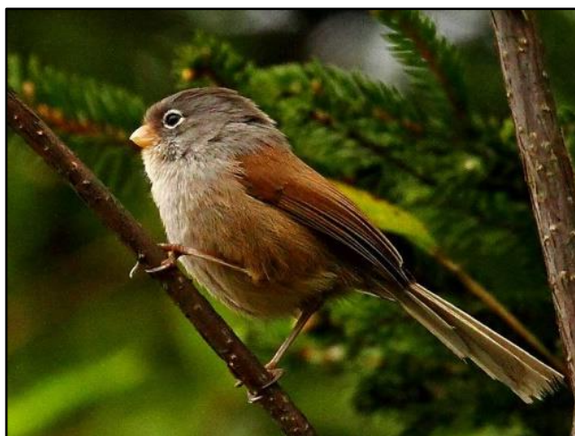
Grey-hooded Parrotbill

After lunch, we decided to venture even higher, towards the highest drivable point in the reserve. Our main target species here was the localised and scarce Grey-hooded Parrotbill. The search was on and while listening and watching carefully for parrotbills in the dense and extensive bamboo, we encountered Yellow-bellied Bush Warbler, an