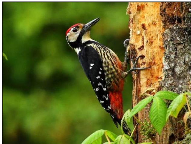
White-backed Woodpecker

extremely vocal but rather furtive White-browed Bush Robin and a Collared Owlet that showed well. Finally, in the late afternoon, a pair of Grey-hooded Parrotbills appeared and stuck around for several minutes, affording us excellent views of these beauties. Awesome! It had been a terrific start, and we could hardly wait for the next day's birding!