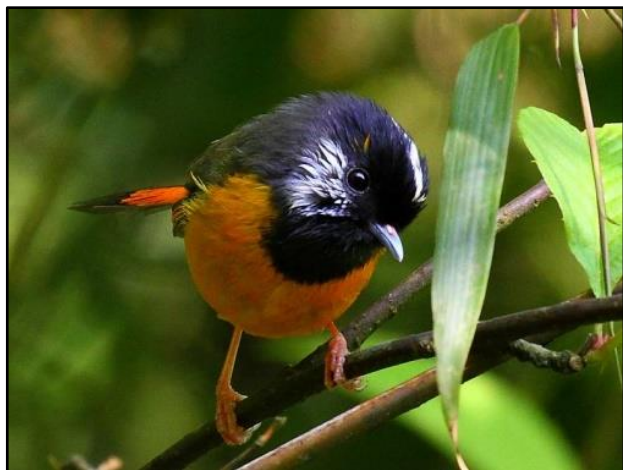
Golden-breasted Fulvetta

After arriving at our hotel in Chengdu, we met up with the new guests and with an hour of light still remaining, we ventured into the adjacent park where we found David's Fulvetta, White-browed Laughingthrush, Brown-breasted Bulbul, Vinous-throated Parrotbill, Crested Myna and Chinese