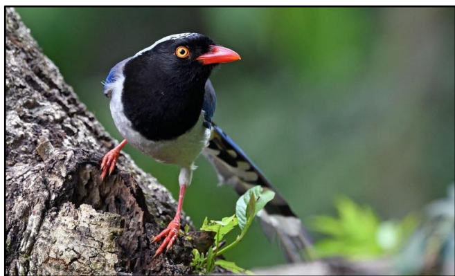
Red-billed Blue Magpie

sign of the Fulvetta, but we did have a male Temminck's Tragopan jump out into the road in front of us and then scurry off into the dense forest understorey. Those who opted out of the morning walk were rewarded with views of two young male Lady Amherst's Pheasants on the road! A stroke of luck indeed!