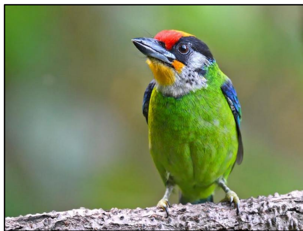
Golden-throated Barbet by Rich Lindie

Finally, we also birded the secondary forest and scrub that lines the initial stretch of the track, and this turned up a vocal and responsive Blue-winged Laughingthrush, as well as Crested Finchbill, Scarlet Minivet, the delicate Grey-headed Canary-Flycatcher, Yellow-cheeked Tit, Striated, Flavescent and Black Bulbuls, Wedge-tailed Green Pigeon, Whiskered Yuhina, the lively Hill Prinia, migratory Dark-sided Flycatcher and several furtive Brown-winged Parrotbills.