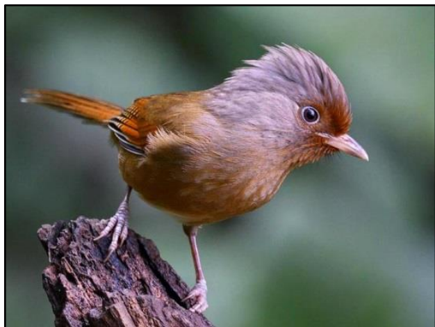
Rusty-fronted Barwing

After our time at Gaoligongshan, we departed on the drive back to Dali, stopping briefly along the way for a few new birds like Green-billed Malkoha, Blue-tailed Bee-eater and Eurasian Hoopoe. From Dali, we drove the final leg to Lijiang, a high-altitude city situated at the base of the snow-capped Jade Dragon Snow Mountains. We spent two nights at a delightfully comfortable hotel in the city, and