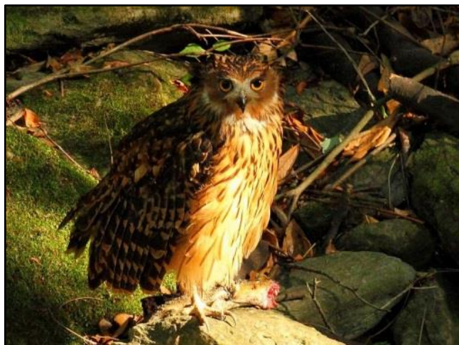
Tawny Fish Owl by Glen Valentine

eventually arrived after a very long travel day and after enjoying a delicious dinner, we settled into our rooms for a well-deserved rest.