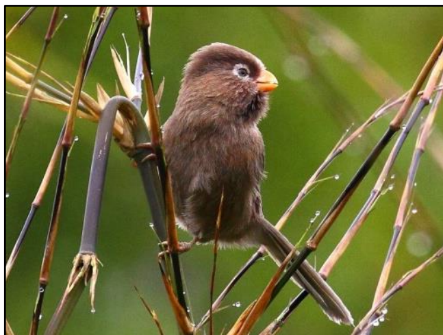
Three-toed Parrotbill by Glen Valentine

after quickly checking in, embarked on some birding along the road in the secondary forest below the reserve entrance. A Grey-faced Buzzard greeted us and was a great bonus! We also managed to obtain excellent views of Brown-flanked Bush Warbler, Claudia's and Kloss's Leaf Warblers, singing Grey-