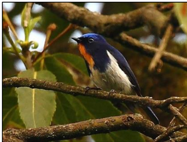
Sapphire Flycatcher by Glen Valentine

Alas, our time at Longcanggou was up, but we did still have the early morning to try and find one or two more rarities and enjoy the many other species that inhabit these beautiful forests. We decided to bird along a gravel track, and then a windy road through lower altitude mixed bamboo and broad-leaved forest in the hope of perhaps finding the very rarely seen Golden-fronted Fulvetta. Sadly, no