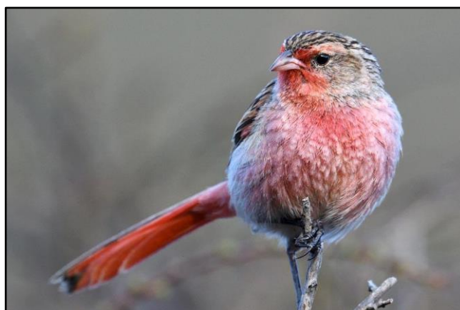
Pzrevalski's Finch (Pinktail) by Rich Lindie

The high-altitude coniferous forests and scrub of the nearby Baxi Valley awaited us the following morning, and we woke up to a beautiful, clear and sunny day. Finally! Soon after arriving at the site, we found ourselves watching a handsome pair of Blue Eared Pheasants that were followed by a pair of Snowy-cheeked Laughingthrushes, a quick-moving and