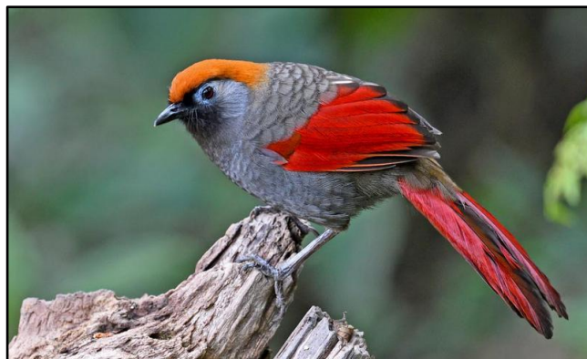
Red-tailed Laughingthrush

Later on in the morning, we managed to locate and obtain excellent views of Giant and Yunnan Nuthatches, as well as a pair and two juvenile Chinese Thrushes. Fantastic! Other note-worthy species encountered this morning included Speckled Piculet, Grey-capped Pygmy Woodpecker, Blyth's Shrike-Babbler, Japanese and Green-backed Tits,