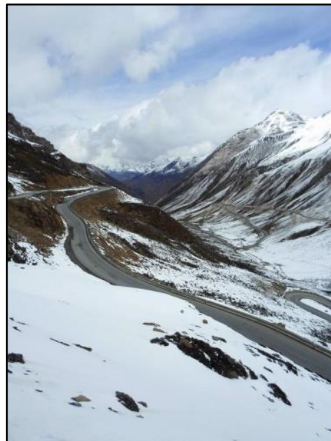
Sichuan Mountain Scenery

The final morning of our Yunnan extension saw us heading north, out of Lijiang towards the Yangtze River, where we spent a few hours searching for the little-known and scarce Brown-winged Parrotbill, as well as enjoying the other great birds on offer at this recently discovered birding site. A huge surprise here came in the form of a Long-billed Plover that resided on a small, rocky island in a small tributary of the main river. Another major bonus came when a party of no fewer than five Yellow-bellied Flowerpeckers was spotted in the open, offering superb scope views of this rare and erratic species. We also found several of the attractive white-headed form of Black Bulbul, as well as Plain Prinia, several Fire-breasted Flowerpeckers and Russet Sparrow. A small flock of Cook's Swift and Himalayan Swiftlet circled overhead and just before it was time to leave for the airport, we finally found a pair of Brown-winged Parrotbills that showed superbly well as they fed, unperturbed, at close range. A fantastic end to the morning and our Yunnan Extension! On that note, we began the drive back to Lijiang, stopping en route for a delicious dumpling lunch. Our flight back to Chengdu was timely and uneventful and we arrived back at our hotel in Chengdu in the late afternoon to begin the next leg of the tour – our fabulous mountain adventure around Sichuan.