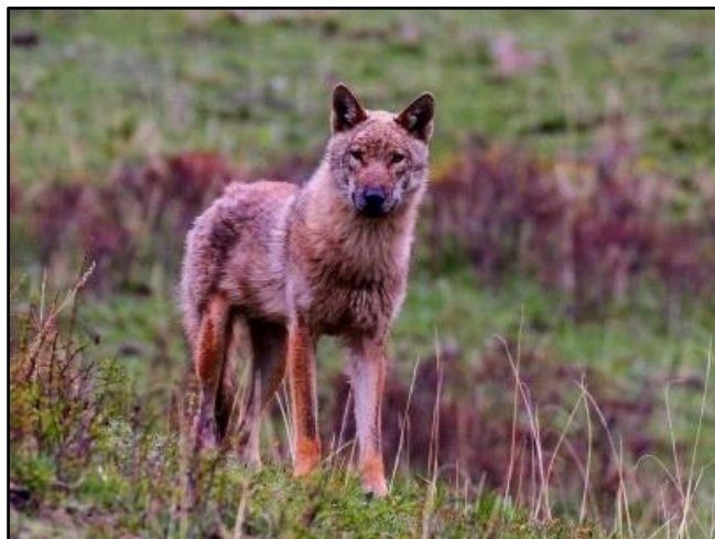
Grey Wolf

rather unobtrusive group of Sichuan Jay and White-backed and Black Woodpeckers. After another field breakfast, we made our way up a forest-lined gulley, where we added a calling Pzrevalski's Nuthatch to the ever-growing list of megas seen on this fabulous trip. A pair of Slaty-backed Flycatchers also showed momentarily, as did a fleeting pair of Blood Pheasants. Several stunning Common Pheasants