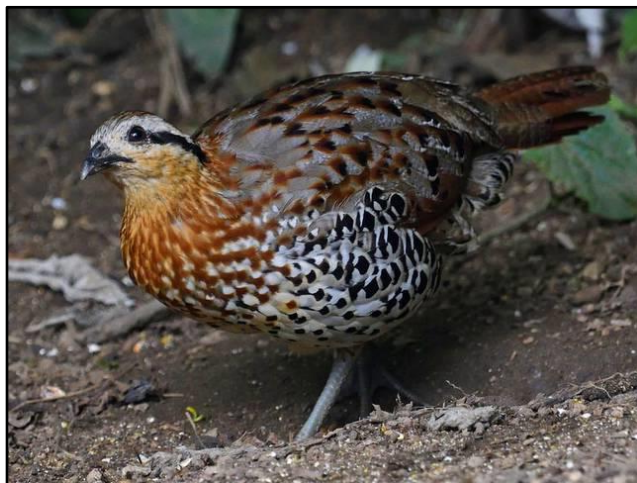
Mountain Bamboo Partridge