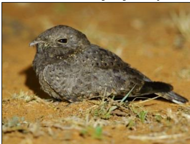
Star-spotted Nightjar

Another early start saw us heading for the great Melka Ghebdu track. En route we came across a truck which was stuck in the mud, blocking the entire road. We set up a quick breakfast to save time