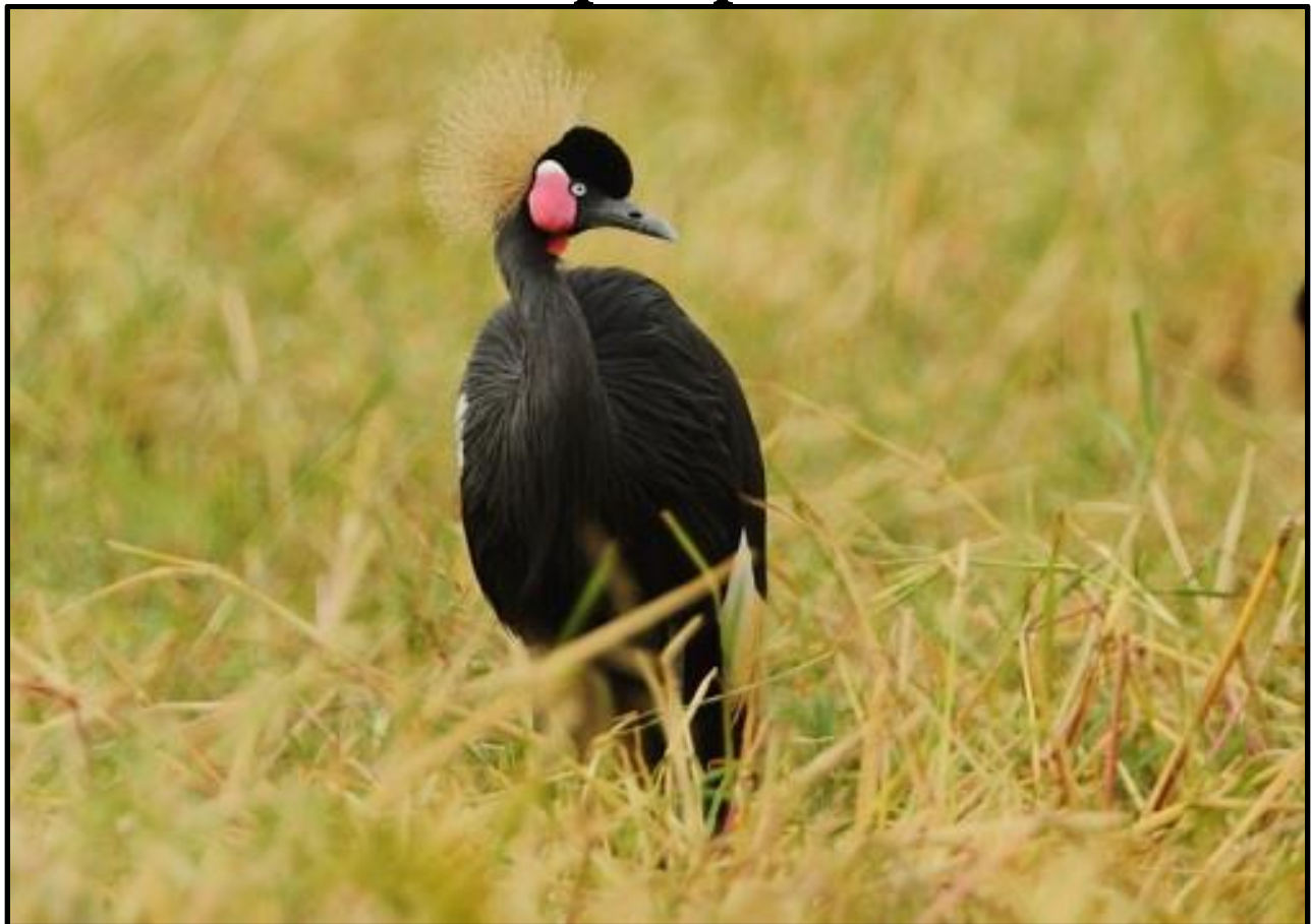
Black Crowned Crane