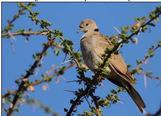
White-winged Collared Dove by David Hoddinott

A day in the Yabello area was most productive. We explored the road network through this lovely wooded countryside and notched up great views of Somali Ostrich, Yellow-necked Spurfowl, Black-chested and Brown Snake Eagle, Pallid Harrier, a roosting African Scops Owl, Purple Roller, D’Arnaud’s Barbet, diminutive Pygmy Falcon, Red-naped Bushshrike, Somali Fiscal, Acacia Tit, Mouse-coloured Penduline Tit, Foxy Lark, White-crowned and Magpie Starling, Speke’s Weaver and Northern Grosbeak Canary. We also found some great mammals here, including Gerenuk, Grant’s Gazelle and Plains Zebra.