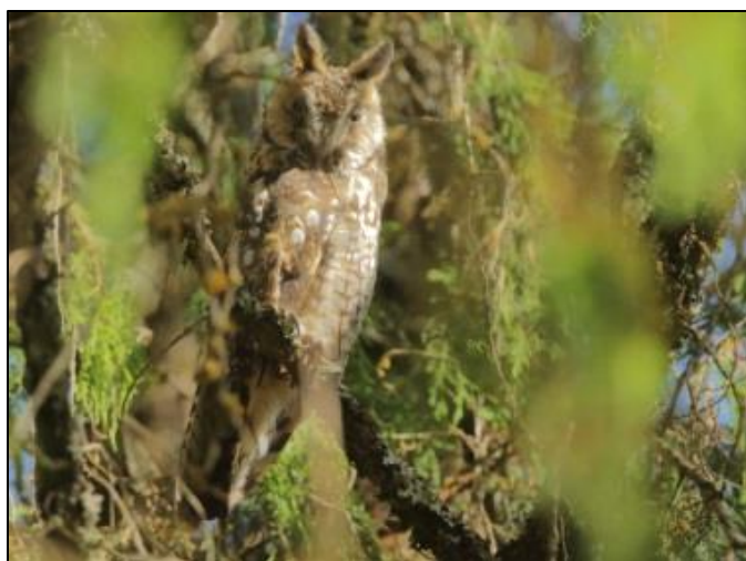
Abyssinian Owl by David Hoddinott

Early the following morning, we left the rift valley and headed up into the Bale Mountains National Park. Our first stop en route saw us finding some great birds, including the endemic Abyssinian Longclaw, Red-breasted Wheatear, Groundscraper Thrush, Moorland Chat, Red-chested Swallow and an unexpected Common Quail. After enjoying a local Ethiopian lunch with the traditional injera, we stopped off in a rocky gully, where we quickly found a splendid Cape Eagle Owl. Shortly afterwards, we were watching several endemics, including the striking Spot-breasted Lapwing, Blue-winged Goose, Rouget’s Rail, Wattled Ibis and Abyssinian Siskin. Next, we were off to the headquarters of the park, where we sought the rare and localised Abyssinian Owl. After a bit of a walk, we enjoyed fabulous views of this great bird and also a surprise in the form of a pair of Verreaux’s Eagle Owl ( very high elevation for this species ). Other great birds here were White-backed Black Tit and Abyssinian Ground Thrush.