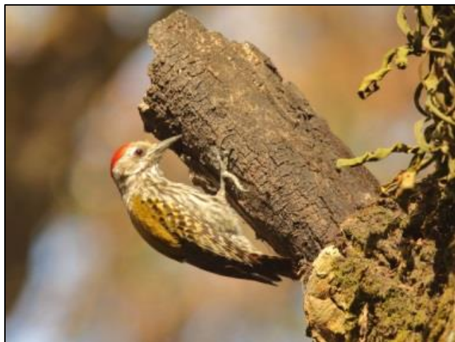
Abyssinian Woodpecker

Leaving the highlands, we travelled through Hareenna Forest to the acacia bushveld on the Negele region. En route we added the dazzling Half-collared Kingfisher and Abyssinian Crimsonwing to our ever growing list. Later we stopped in mixed bush country in the middle of nowhere and located the highly sought after Ruspoli’s Turaco, one of the top birds of the trip!!! It took a little while but after some