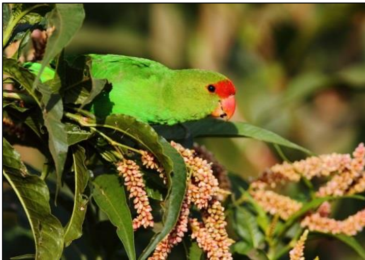
Black-winged Lovebird by David Hoddinott

Our memorable Ethiopian adventure started off with a wonderful drive south through the Great Rift Valley, where we visited a number of impressive and unique lakes each offering a new set of birds. Our first stop was at Lake Cheleleka where upon arriving at dawn, we were greeted by several thousand bugling Common Cranes, what a spectacle! Yellow-billed, White and hundreds of Marabou Storks were seen in surrounding fields, along with Glossy Ibis, African Spoonbill and an assortment of waders, including Black-tailed Godwit, Temminck's Stint and Little Ringed Plover. Greater Spotted Eagle, Western Marsh Harrier, Isabelline Shrike, Chestnut-backed Sparrowlark, and Erlanger's Lark were other notable sightings here.