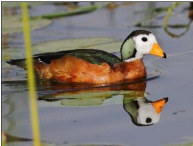
African Pygmy Goose by David Hoddinott

The following morning, we continued east to the Awash region and on to Bilen. En route we stopped off at the lava flows around Lake Beseka and were delighted to find some great birds, including a fine male Klaas’s Cuckoo, Blackstart, the localised Sombre Rock Chat, dazzling Nile Valley Sunbird and Striolated Bunting. After lunch, we moved on to the Bilen area and notched up Short-toed Eagle, European Turtle Dove ( common this year ), lovely Abyssinian Roller, beautiful Northern Carmine Bee-eater, Yellow-breasted Barbet, Black-crowned Tchagra, migrant Woodchat Shrike, smart Chestnut-headed Sparrowlark, Red-fronted Warbler, Barred Warbler, a confiding Rufous-tailed Scrub Robin and sought after Black-eared Wheatear. At dusk, we watched good numbers of Lichtenstein’s Sandgrouse coming down to drink at a waterhole.