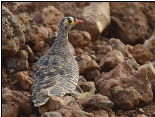
Lichtenstein's Sandgrouse by David Hoddinott

Golden Jackals. It was most entertaining watching the duel between the Secretarybirds and the Jackals. Other species noted here included a fine male Montagu's Harrier, sought after Arabian Bustard, dozens of Black-headed Lapwing, cryptic Three-banded Courser, several hundred Chestnut-bellied Sandgrouse, African Collared Dove, Red-tailed and Steppe Grey Shrike, Singing Bush Lark, Desert Cisticola and Tawny Pipit. Mammals included several distant Grevy's Zebra, Beisa Oryx and small herds of Soemmerring's Gazelle. From here we travelled back to Awash National Park for a two-night stay.