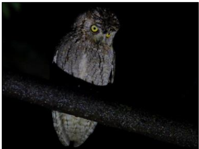
Eurasian Scops Owl

and whilst enjoying a welcome cup of coffee, the local road crew used a bulldozer to get the truck unstuck and then, thankfully, we were on our way again. On arriving at the site, our ground operations team kindly set about making some delicious porridge whilst we birded the arid surroundings. Soon we