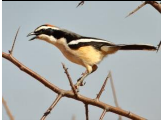
Red-naped Bushshrike by David Hoddinott

The following morning, we noted some key species in the magnificent gardens around our hotel, including African Spotted Creeper and at Lake Awassa, the tiny Lesser Jacana showed well. Next, we headed over to the deep Crater Lake Shalla and here we found several Black-necked Grebe and Cape Teal. Moving on to the nearby and very shallow Lake Abijata, we located huge flocks of Lesser Flamingo and lesser numbers of Greater Flamingo. It was quite a site to see thousands of flamingos feeding along the lake shore. Thereafter, we travelled to Lake Langano, where we enjoyed lunch. The surrounding woodland was alive with bird activity and we had some memorable sightings, including a pair of Clapperton’s Francolin, a pair of Northern White-faced Owl with two chicks, splendid Greyish Eagle Owl and lovely Red-throated Wryneck.