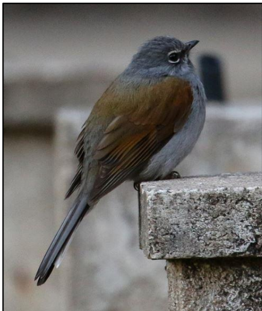
Brown-backed Solitaire by John Hopkins

for. One of the reasons for great birding here was the fact that some species were more habituated to human presence, when compared to the birds at the other sites we visited . For example, Brown-backed Solitaires and Ruddy-capped Nightingale-thrushes were super easy to observe and typical skulkers like Rufous-browed Wren and Golden-browed Warbler were often foraging out in the open.