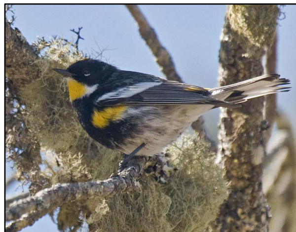
Goldman's Warbler by Dušan Brinkhuizen

Our Guatemala adventure continued with a longish drive to the western highlands. A special day trip was organised to an awesome new site: the scenic highland plateau of the Todos Santos Cuchumatán mountain range. Our main target here was the cracking Goldman's Warbler, a regional endemic with an extremely localised distribution. The species is a fairly recent split from the Yellow-rumped Warbler-complex ( data suggests an even stronger split than Audubon's vs. Myrtle ), and is a very attractive bird. In the small highland town of Chiabal, we met up with our local guides and switched transport to 4x4 pickup trucks. It was a very scenic ride up the mountain and at the top, the habitat changed to spectacular alpine-like grasslands, with scattered patches of native pine forests. This was the spot for the Goldman's Warbler. Within a few minutes after getting out of the car, we located a pair and the views we had were simply superb. What a handsome warbler that is! As with many highland sites, the species diversity was rather low. However, apart from more Goldman's Warblers, we did enjoy quite a few new and unique species for Guatemala, including Golden-crowned Kinglet, Red Crossbill, Brown Creeper, Yellow-eyed Junco and a splendid male Olive Warbler – a great day again!