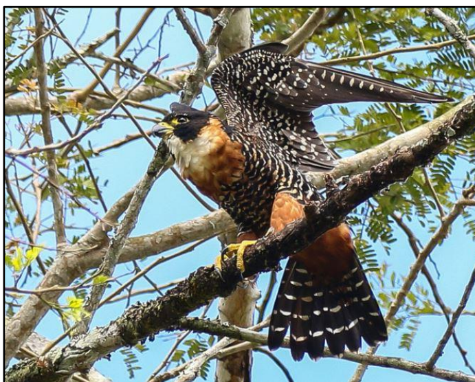
Orange-breasted Falcon