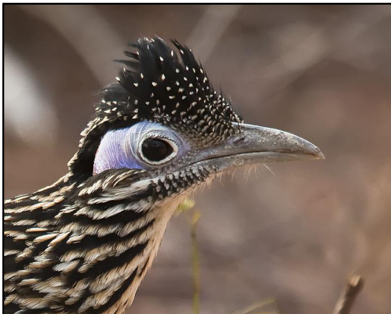
Lesser Roadrunner

We started our Central American Specialities tour in the Motagua valley north of the capital to look for a special suite of dry forest birds at a private farm named Talpetate. At dawn, we watched Lesser Nighthawks in the sky and waited for other species to get active. One of the first birds we got our eyes on was a splendid pair of Varied Bunting, a localised species in Guatemala. A nice