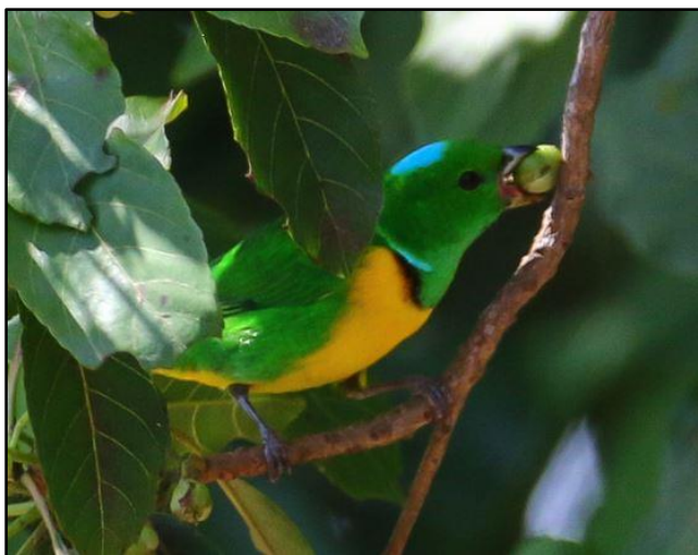
Blue-crowned Chlorophonia

Golden-crowned Warbler and Scaly-throated Foliage-gleaner, the birding uphill was quite slow. A splendid adult male Resplendent Quetzal was a highly unexpected treat. A Tody Motmot was another surprise, and near where the bird was perched we noticed some more understorey activity: