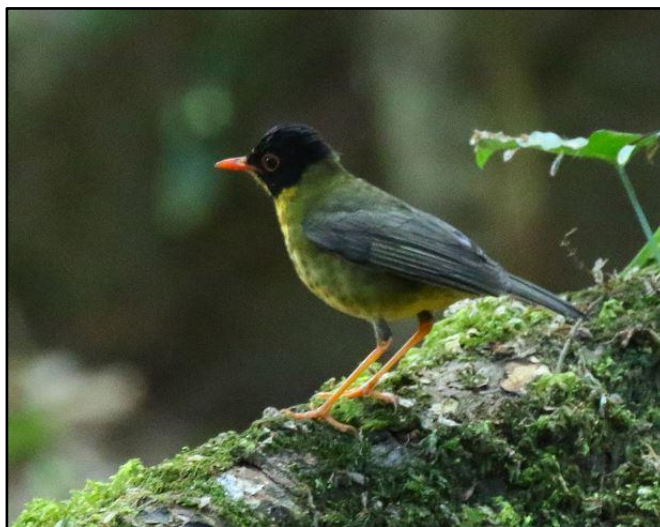
Spotted Nightingale-thrush by John Hopkins

The next morning, we visited Finca Los Andes in search of the localised Cabanis's Tanager (also often named Azure-rumped Tanager). This major target bird is typically found in the higher parts of the reserve, so we drove up and later continued hiking up the southern slope of the Atitlan volcano to get to the proper cloud-forest habitat. Apart from a few new birds, like Hairy Woodpecker,