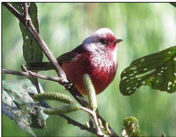
Pink-headed Warbler by Karen Halliday

headed Warbler, was located quickly. A pair of this awesome near-endemic was watched at close range at a clearing. A fly-over accipiter got us very excited as it looked perfect for a White-breasted Hawk. However, careful study of the photos revealed that the bird was a very pale immature Sharp-