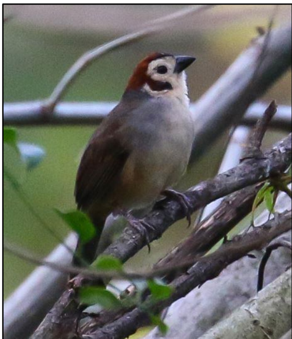
Prevo's Ground Sparrow

Indigo Bunting, Baltimore Oriole and many more splendid Painted Buntings at close range! In the afternoon, we travelled to our next awesome destination: Los Tarrales.