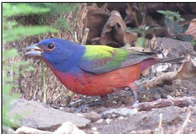
Painted Bunting by Karen Halliday

The next morning, we visited a dry canyon outside Panajachel. The rare Belted Flycatcher was our main target here, but after a couple of hours of searching, we only succeeded in hearing it. Many great birds were seen well, including Northern Tufted Flycatcher, Paltry Tyrannulet, Yellowish Flycatcher, Painted Redstart, Lincoln's Sparrow, Velasquez's Woodpecker and a crisp male Painted Bunting! At Lake Atitlan itself, we watched water birds, including Blue-winged Teal, Lesser Scaup, American Coot, Green Heron and a Little Blue Heron. A large flock of foraging swallows produced Violet-green Swallow, Northern Rough-winged Swallow, Barn Swallow and Vaux's Swift. In town, we were invited by local birder, Clive Rainey, to watch the bird feeders in his garden. Here we successfully watched Black-vented Oriole, Rufous-collared Sparrow, Inca Dove,