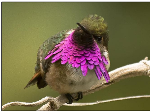
Wine-throated Hummingbird by Dušan Brinkhuizen

We started birding along the entrance road to the Yaxha temples. It was quite overwhelming, since many of the species we saw were new to the trip. Birds that kept us busy included Plain Chachalaca, Olive-throated Parakeet, Black-headed Trogon, Long-billed Gnatwren, the secretive Northern Bentbill and Green-backed Sparrow. We also saw quite a few new hummers, including Wedge-tailed Sabrewing, White-necked Jacobin, Rufous-tailed Hummingbird and a crisp male Canivet's Emerald, spotted by Karen. At the magnificent Yaxha temples, we practically had the complex to ourselves. Canopy activity produced stunners like Ivory-billed Woodcreeper, Bright-rumped Attila, Montezuma Oropendola,