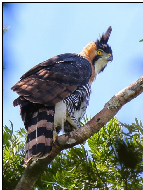
Ornate Hawk-Eagle

the tiny Yellow-bellied Tyrannulet and a single Philadelphia Vireo. Watching a group of Yucatán Black Howler Monkeys passing through was fantastic. A White-necked Puffbird on an exposed branch and a female Slaty-tailed Trogon in the midstorey were welcome additions too. A Kentucky