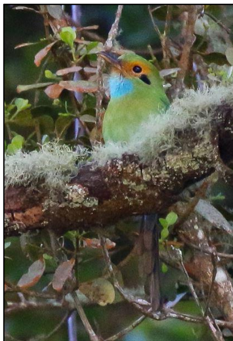
Blue-throated Motmot

Later in the morning, we travelled to the highlands of the Tecpán region. Our principal target here, the stunning Pink-