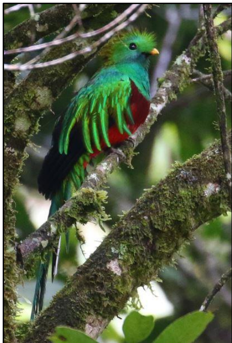
Resplendent Quetzal

dove for some. A flock of Chestnut-headed Oropendolas was a welcome addition, too.