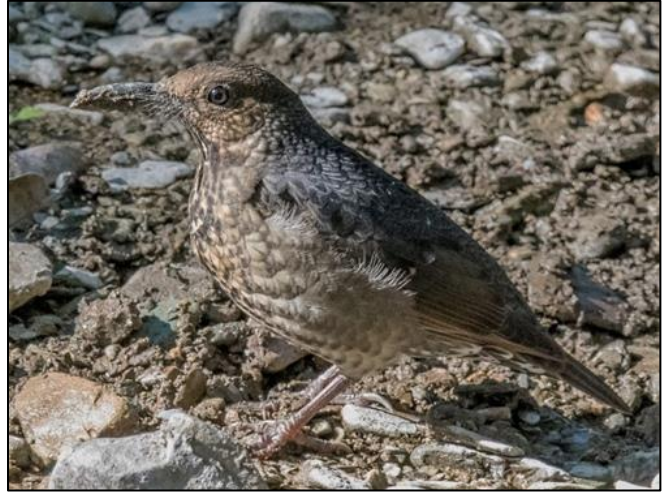
Long-billed Thrush

We experienced some excitement on an afternoon walk near our lodge in Mohaan when a male Wild Boar mock-charged us. He was agitated by the lodge's bouncy Labrador but despite a big cloud of dust ( and wobbly legs on our part! ) neither the dog nor we came to any harm. While searching for Brown Dipper on the same walk ( we saw four ), we found a second Wallcreeper flitting about the waterside pebbles, as well as a hesitant Northern Red Muntjac in the distance.