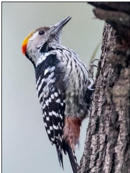
Brown-fronted Woodpecker by Dennis Braddy

From Corbett, we pushed further into the Himalayan foothills, winding our way to the hill station of Nainital. The next day, we set out very early to ensure we were in position along the steep mountainside in Vinayak at dawn, when we'd have our best chance at the area's pheasants. We found at least six Grey Nightjars before reaching our destination, and everyone had good looks of at