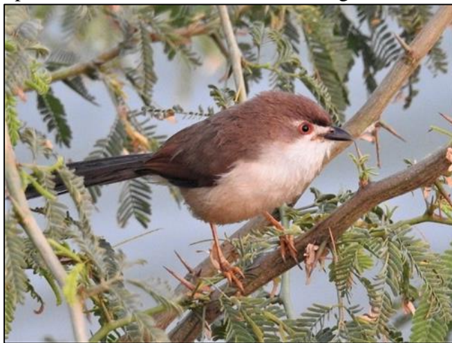
Yellow-eyed Babbler by Jim Watt

stunning Ferruginous Ducks, Greylag and Bar-headed Goose, Ruddy Shelduck, Cotton Pygmy Goose, Northern Shoveler, Red-crested Pochard, Northern Pintail and Eurasian Teal. Other waterbird highlights included Black-necked Stork, two Black Bitterns, Little, Great and Indian Cormorants, Oriental Darter, elegant Sarus Cranes – distant views at first but wonderfully close looks later on , White-tailed Lapwing, Pheasant-tailed and Bronze-winged Jacanas, Common Snipe, Spotted Redshank and Ruff. The vegetation bordering the shallow marshes supported Common