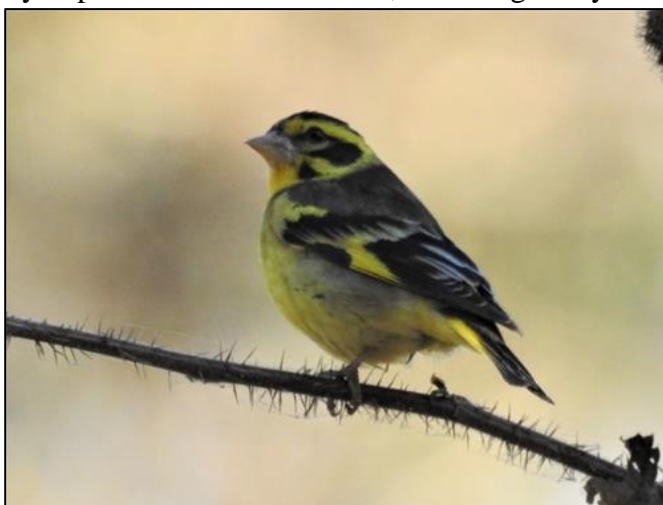
Yellow-breasted Greenfinch by Jim Watt

The following day, we dropped a little in altitude to visit the Bhimtal area. First up, at Champi, we were treated to such beautiful birds as Kalij Pheasant, Great Barbet, Greater and Lesser Yellownapes, Yellow-bellied Fantail, Black-chinned Babbler, Striated Laughingthrush, Chestnut-bellied Nuthatch, Grey-winged Blackbird, Rufous-bellied and Small Niltavas, White-tailed Rubythroat, Slaty-backed and Spotted Forktails and Grey Bush Chat. We then passed through Bhimtal to Sattal, a park featuring seven lakes set in