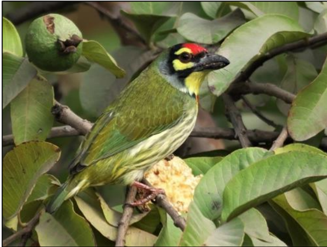
Coppersmith Barbet

Our Northern India tour is one of those trips that has something for everyone – heaps of culture, amazing food, some splendid scenery, excellent wildlife opportunities and birds everywhere! It's one of my favourite tours and I got to share it again with a new group of eager visitors at the end of 2016. Highlights included riding elephants, visiting the Taj Mahal and seeing Ibisbill, Wallcreeper, Chestnut-headed Tesia, Great Slaty Woodpecker, Scaly-breasted Wren-babbler, White-crested Laughingthrush, Tiger and Leopard – the latter a first for this Rockjumper tour.