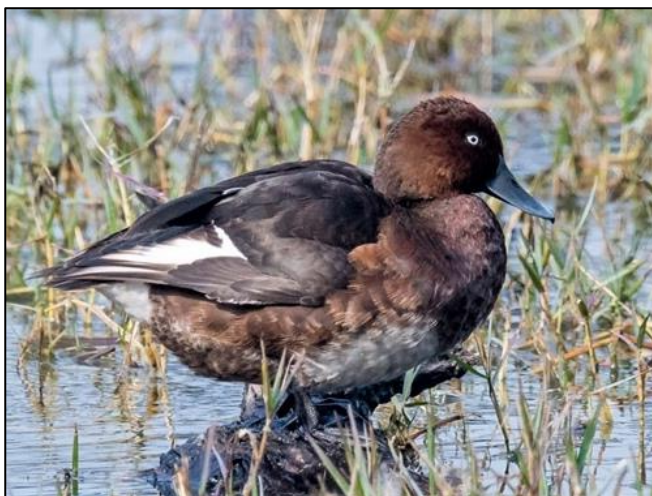
Ferruginous Duck

That afternoon, we squeezed in a bit of unlikely birding at a dirty canal where we connected with our target – three Greater Painted Snipes, as well as White-eared Bulbul, Marsh Sandpiper and Common Redshank.