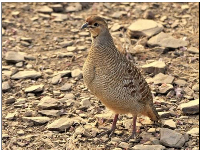
Grey Francolin

The following day, we made our first train journey ( quite a different experience for those more accustomed to rail rides in Western countries! ) to Sawai Madhopur, the safari capital of northern India. We settled into our resort just outside Ranthambore National Park and embarked on our first foray into the park after lunch. We racked up great sightings of Ruddy Shelduck, Painted, Black and Woolly-necked Storks, Western Osprey, Crested Honey Buzzard, Bonelli's Eagle, Pied Avocet, Bronze-winged Jacana, Green Sandpiper, White-throated Kingfisher, Black-rumped Flameback, more Grey Francolin, Alexandrine Parakeet, Long-tailed Shrike, White-bellied Drongo, some very tame Rufous Treepies, Dusky Crag Martin, Large Grey Babbler, Rosy Starling, Tree Pipit and Citrine, Grey, White and White-browed Wagtails. Over the next two days in the park and surrounding area, our list was bolstered by Cotton Pygmy Goose, Gadwall, Garganey, Eurasian Teal, Jungle Bush Quail, sought-after Painted Spurfowl, Striated Heron, Oriental Darter, Indian Vulture, the impressive Crested Serpent Eagle, Shikra, Brown Crake, White-breasted Waterhen, Temminck's Stint, 30 beautiful Painted Sandgrouse, Greater Coucal, Indian Scops Owl, Brown Fish Owl, Common Kingfisher, Brown-capped