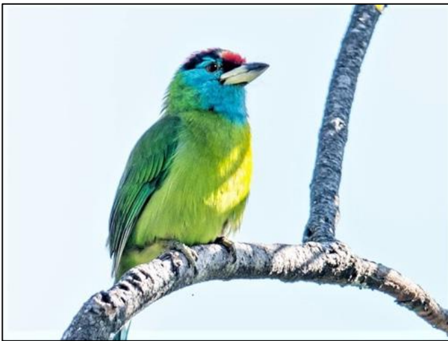
Blue-throated Barbet by Dennis Braddy

The following day, we moved to the nearby Corbett National Park. This scenic national park is India's oldest, and is named in honour of hunter-turned-conservationist Jim Corbett. The long drive from the entrance gate to the camp took us through extensive sal woodland, which yielded Red Junglefowl, Kalij Pheasant, a Tawny Fish Owl with a half-eaten fish clenched in its talons, Lineated, Blue-throated and Coppersmith Barbets, Scaly-bellied and Grey-headed Woodpeckers, Bar-winged Flycatcher-shrike, Black-hooded and Maroon Orioles and Ashy, Lesser Racket-tailed and Hair-crested Drongos. We were based for two nights in the rustic accommodation at Dikhala Camp and made numerous drives out into the surrounding grassland, forest and river shoreline. Raptors were particularly good, with sightings of Western Osprey, Black-winged Kite, Red-headed and Cinereous Vultures, Steppe Eagle, Crested Serpent Eagle, Changeable Hawk-Eagle, Pallas's and Grey-headed Fish Eagles, Crested Goshawk, Eurasian Sparrowhawk and a sublime male Hen Harrier. Other goodies included Black and Black-necked Storks, Brown Fish Owl, Jungle Owlet, Himalayan Swiftlet, White-rumped Spinetail, Stork-billed Kingfisher, Streak-throated Woodpecker, Himalayan Flameback, six of the sought-after Great Slaty Woodpecker, Lesser Coucal, Oriental Skylark, Golden-headed Cisticola, Puff-throated Babbler, Black-throated Thrush, Paddyfield Pipit and Chestnut-eared Bunting.