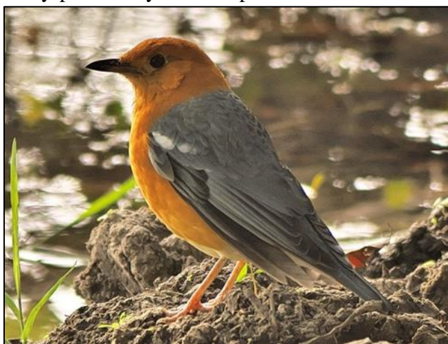
Orange-headed Thrush by Gavin Edmondstone

Moving on to the Chambal River, we boarded two boats and motored up the seemingly placid waters in the late afternoon. We saw a flock of around 40 Bar-headed Geese, Ruddy Shelduck, a female Eurasian Wigeon, Western Osprey, a