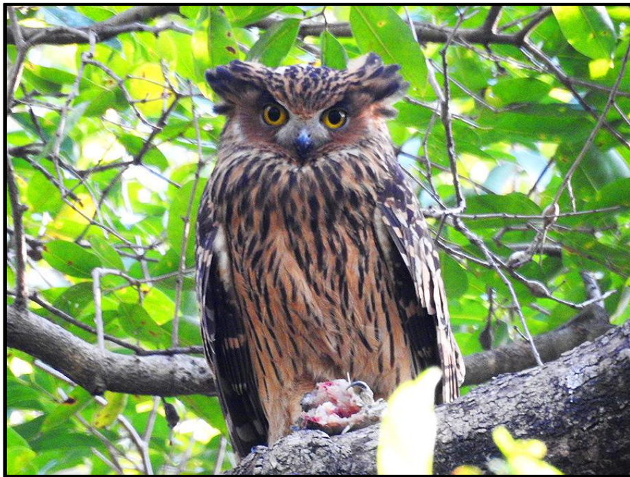
Tawny Fish Owl