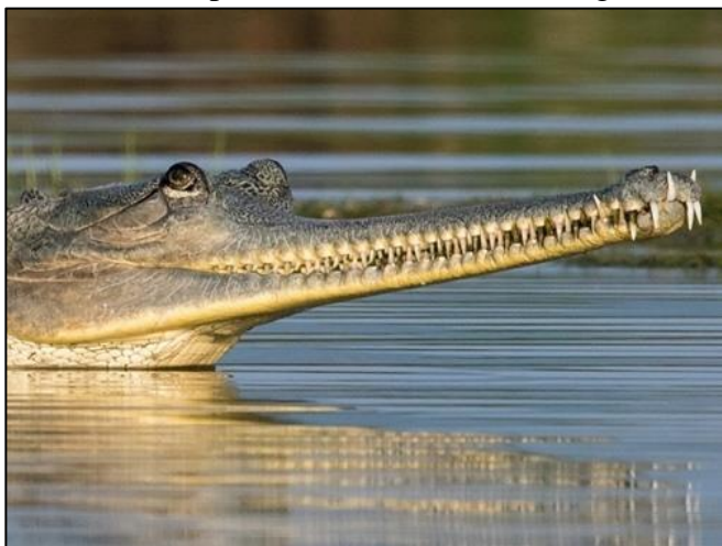
Gharial by Dennis Braddy

pair of Bonelli's Eagles, a dark-morph Long-legged Buzzard, bug-eyed Great Stone-curlew, River Lapwing, Pallas's Gull, near-threatened River and Black-bellied Terns and Blue Rock Thrush. The biggest highlights from our boat rides weren't even birds! We were thrilled to see some massive Mugger Crocodiles and Gharials and, best of all: two endangered Ganges River Dolphins, which surfaced multiple times. Back at the lodge, we saw the resident Brown Hawk-Owl and found a