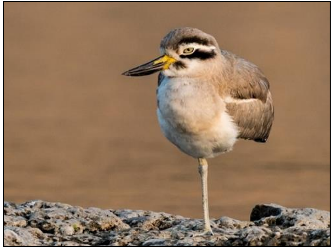
Great Stone-curlew by Dennis Braddy

Moving around to the far side of the lake, the terrain became drier and more open, with more shoreline. The water's edge here held Great White Pelican, Indian and Great Stone-curlews, Little Ringed and Kentish Plovers and Black-tailed Godwit. The stony ground beyond yielded Red Turtle Dove, Eurasian Wryneck, Southern Grey Shrike, Crested Lark, Ashy-crowned Sparrow-Lark, Desert and Isabelline Wheatears and Tawny Pipit.