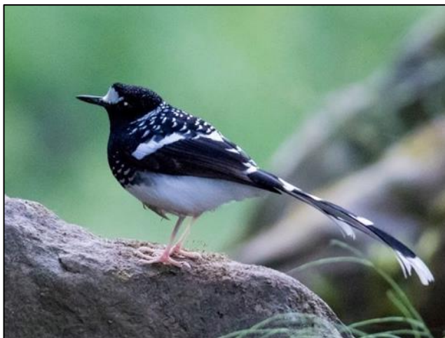
Spotted Forktail by Dennis Braddy

On our penultimate day in Nainital, we walked a trail on the outskirts of town, along cobbled streets past villagers beginning their day's activities. In between the activity, we found Himalayan Buzzard, Scaly-bellied Woodpecker, Mountain Bulbul, Buff-barred Warbler, a sensational male Golden Bush Robin, Pink-browed Rosefinch and Rock Bunting. We drove further down to the Bajun Valley which produced Blue-throated Barbet, a spectacular flock of around 20 Scarlet Minivets, Black-faced, Tickell's, Ashy-throated and Whistler's Warblers, Whiskered and Stripe-throated Yuhinas, and the crowd favourite: Green-tailed Sunbird. That afternoon, we took some time off to explore Nainital and to do some souvenir-hunting, always with a quick chai break!