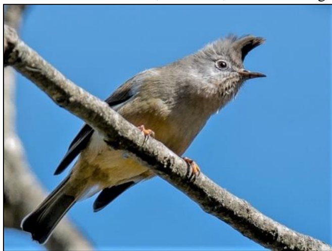
Stripe-throated Yuhina

Our tour culminated at the Okhla Bird Sanctuary, a huge wetland near New Delhi formed by a barrage on the Yamuna River. Needless to say, we came away with a large waterbird list: Greylag and Bar-headed Geese, Gadwall, Eurasian Wigeon, Indian Spot-billed, Ferruginous and Tufted