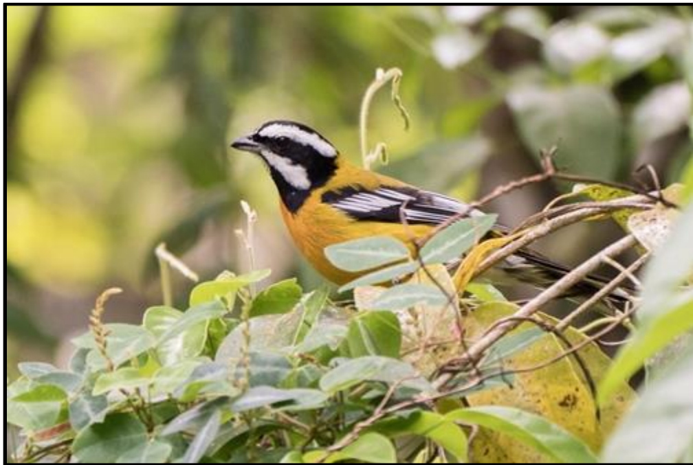
Jamaican Spindalis