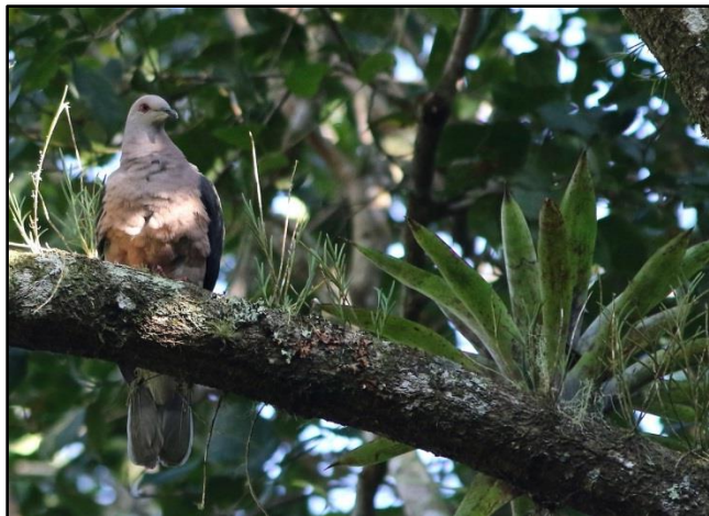
Ring-tailed Pigeon

ran into Chestnut-bellied Cuckoos. We knew that once we left the road we would no longer have a chance to improve our views of the endemic crow, so we focussed our efforts on the bird. Sure enough, lower down and just before we left, we came across a pair that gave us very obliging views. Our chances of birding on the way back were scuppered by heavy rain; we managed to see Antillean Palm