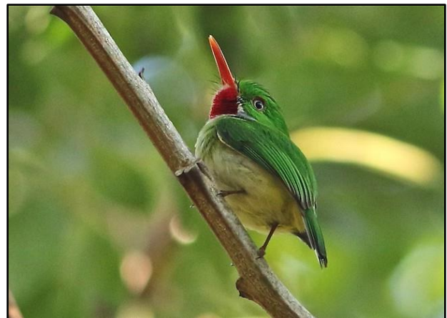
Jamaican Tody by Don Roberson

Wednesday, 15 February: An early start had us at the Ecclesdown Road for breakfast. Our first birds were Arrowhead Warblers and the extremely range-restricted Black-billed Streamertail, the latter displaying right next to our vehicle. We struggled not to spill our coffee as Black-billed Parrots were spotted just up the road, fabulously close views of four perched birds. The rest of the morning was spent walking up the road, taking advantage of the overlooks to scan for birds. We soon found Yellow-billed Parrots and Ring-tailed Pigeons, and caught glimpses of elusive Jamaican Crows. A fruiting tree attracted several White-eyed Thrushes, as well as a pair of Jamaican Becards, and a little further on, we