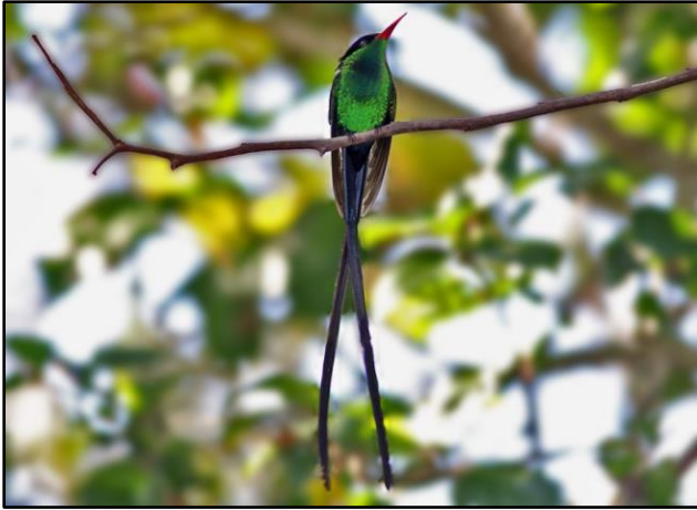
Red-billed Streamertail