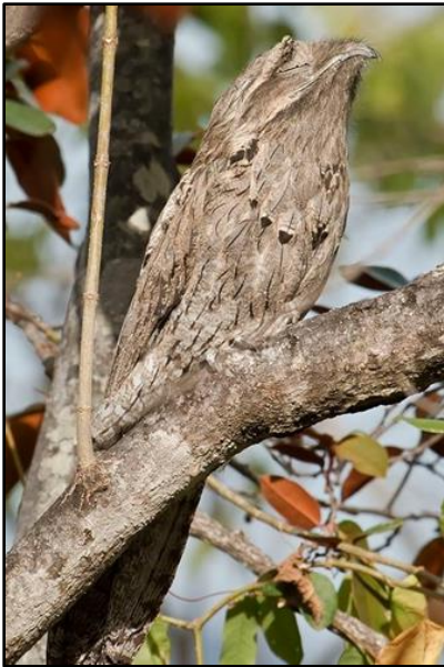
Northern Potoo by Dušan Brinkhuizen

process. After that, it was time to eat lunch and head homeward. A stop at pools on the Green Castle Estate gave some of us a quick view of a Yellow-breasted Crane, which unexpectedly flushed as we moved to get a better view.