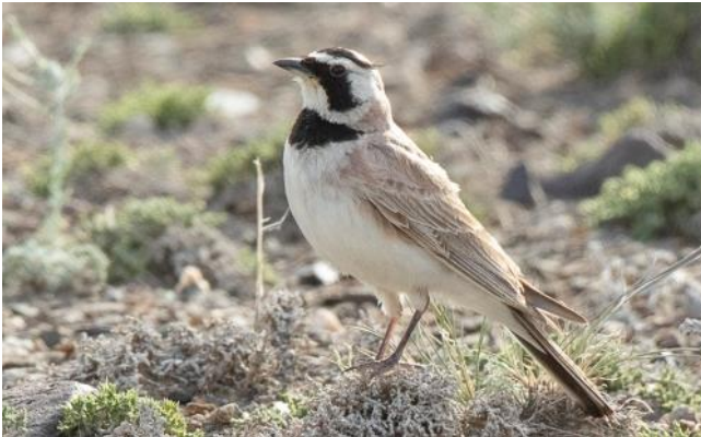
Brandt's Horned Lark

27 th May: Today's birding was characterised by quality species and breathtaking scenery. We walked the lovely Sogety Valley plains that were alive with Brandt's Horned Larks, Desert Wheatears and the scarce Asian Desert Warbler that performed beautifully.