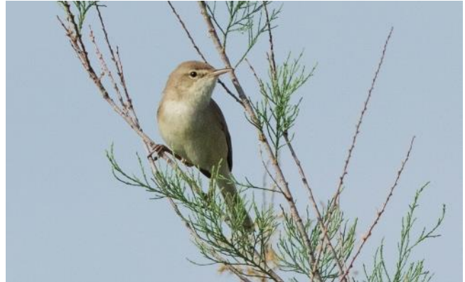
Sykes's Warbler by Yoav Perlman