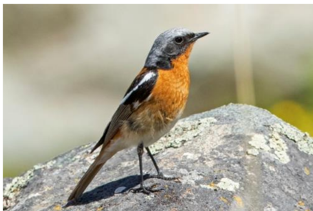
Eversmann's Redstart