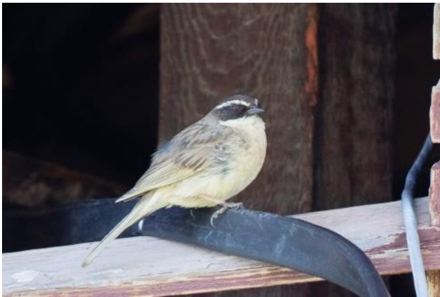
Brown Accentor

30 th May: Today was our last day in the Almaty region. We left early and headed straight up to Kosmos Station. We saw good high-altitude species up there – Altai and Brown Accentors, Plain Mountain Finch, Güldenstädt's Redstart and Himalayan Snowcock.