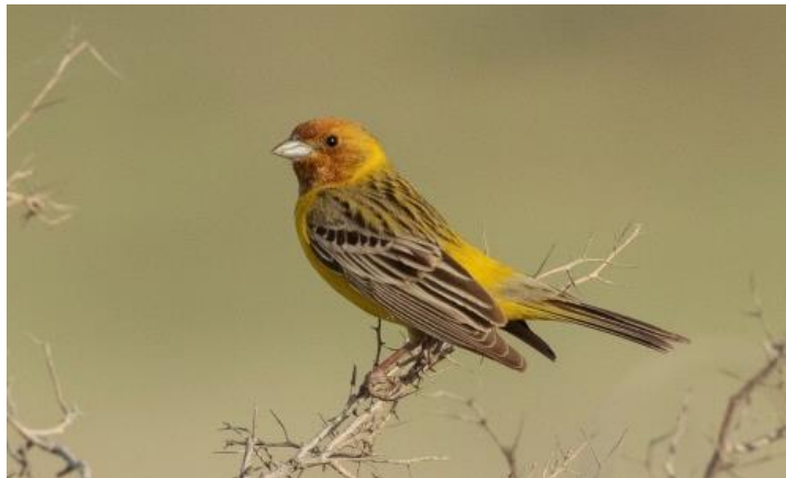
Red-headed Bunting

We then drove on towards our tented camp near Kanshengel in the Taukum Desert. In the afternoon, we birded on foot out of our camp and enjoyed watching birds coming in to drink at a nearby waterhole. Highlights included Bimaculated, Calandra, Asian and Lesser Short-toed Larks, Black-bellied Sandgrouse, many Red-headed Buntings, Pallid Harrier, Steppe and Eastern Imperial Eagles and Greater Sand Plover.