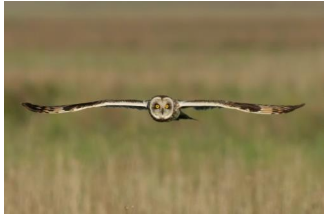
Short-eared Owl by Yoav Perlman

We headed further west, picking up quality species along the road, such as Black and White-winged Larks, Demoiselle Crane and Pallid Harrier. Not too far from Nursultan, we found a pair of the critically endangered Sociable Lapwing, alongside tens of Black-winged Pratincoles. We watched them in awe, from a safe distance – such a privilege.