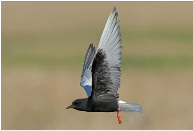
White-winged Tern by Yoav Perlman