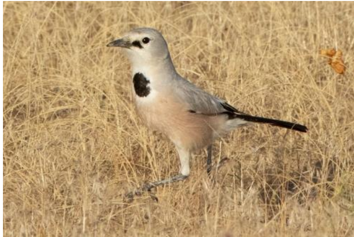
Turkestan (Pander's) Ground Jay

19 th May: We left Bukhara at silly o'clock and headed towards the Kyzylkum desert. After a long drive, we arrived at a desert site about half an hour past Gazli. We ventured out into the desert and soon found our target species, and one of the most wanted of the entire trip – Turkestan (Pander's) Ground Jay. We first found a male perched up on top of a bush in the golden light, then we followed him for a while as he did what it says on the tin – ran on the ground and fed on grubs and beetles. What a fabulous bird, and the entire group enjoyed breathtaking views. Other quality birds we had in the area were Booted Warbler, Asian Desert Warbler and Desert Finch.