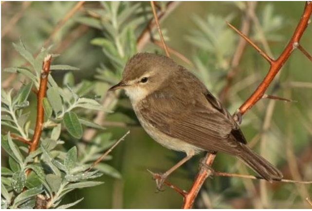
Booted Warbler by Yoav Perlman