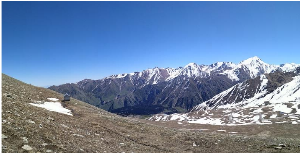
Tien Shan panorama by Yoav Perlman

After lunch, we returned to the beautiful valley behind the Observatory, where we again had multiple Himalayan Rubythroats, Eversmann's Redstart, Black-throated Accentor and Blakiston's Water Pipits. On the way back down to Almaty, we added Blue Whistling Thrush to our trip list, watching a singing male on overhead wires.