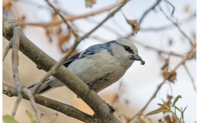
Azure Tit

26 th May: It was beautiful to wake up very early, before dawn, and listen to the fabulous dawn chorus of larks. We set off early to reach our site, deep in the desert west of Kanshengel, at dawn. This was a good decision, as early on we found a fantastic male MacQueen's Bustard, shortly followed by a pair of stunning Caspian Plovers who were attending two chicks.