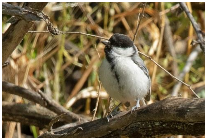
Turkestan (Great) Tit

23 rd May: After a welcome hotel breakfast on our final morning in Uzbekistan, we headed out to Tashkent Botanical Gardens. We enjoyed good urban birding that included displaying Shikra, Greenish Warblers, and Turkestan and Yellow-bellied Tits. We then paid a visit to the bird collection at the adjacent national institute of science, to study some bird skins we might encounter in Kazakhstan. In the afternoon, we flew to Almaty. After arrival, we were transferred to a lovely hotel.