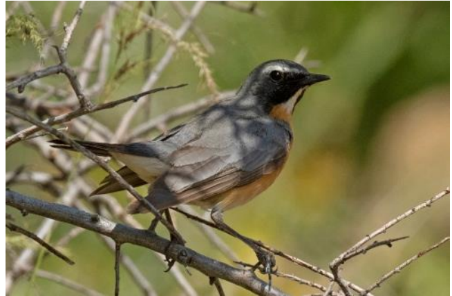
White-throated Robin