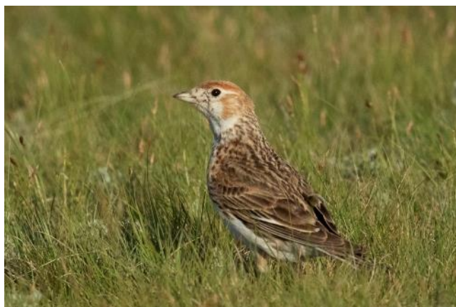
White-winged Lark by Yoav Perlman