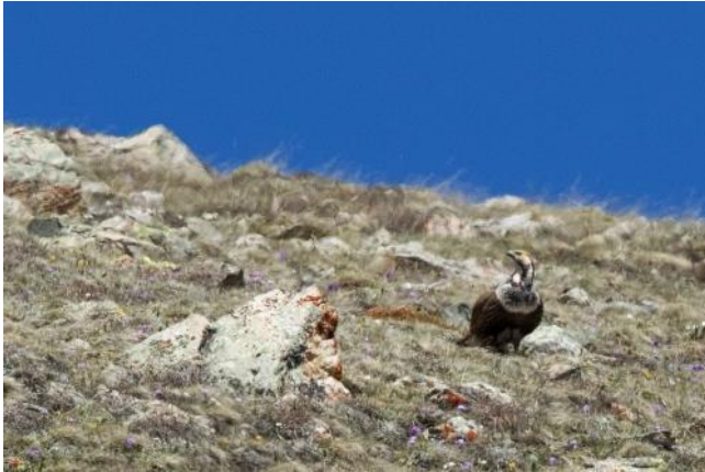
Himalayan Snowcock

29 th May: It was a tougher day, with rather strenuous walking in high-altitude, but birding was enjoyable at most parts, and we connected with cool birds in spectacular scenery. We started up at Kosmos Station, at 3,500 m. Views of two Himalayan Snowcocks feeding and singing on a grassy slope above the station generated some ‘wows’ and ‘oooohs’ from the guests. Other quality species around the station were Güldenstädt's Redstart, Brown Accentor, both choughs and three Lammergeiers.