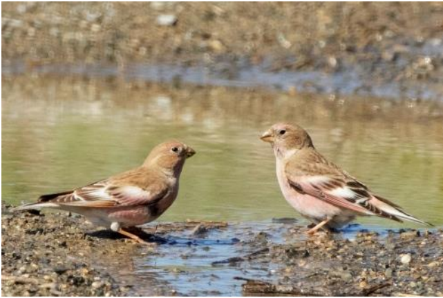
Mongolian Finches by Yoav Perlman

We spent a lovely time by a mountain spring, where hundreds of thirsty seedeaters came in to drink, including big numbers of Mongolian and Asian Crimson-winged Finches and the subtle Grey-necked Bunting that were also seen holding territories on the nearby hills.