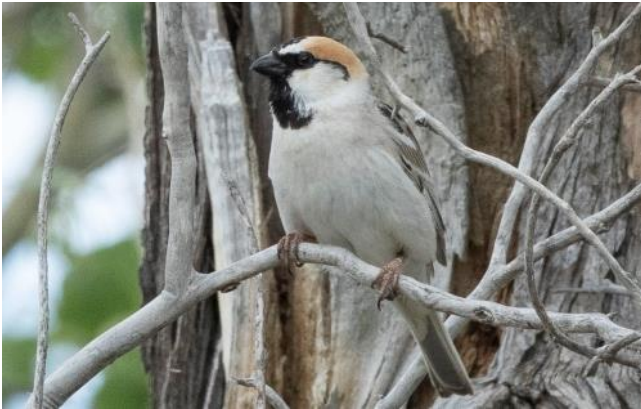
Saxaul Sparrow by Yoav Perlman