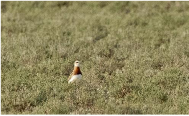
Caspian Plover