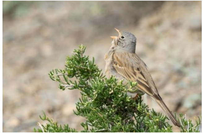
Grey-necked Bunting

We crossed the impressive Charyn Canyon on the way to the mountain pass of Temirlik, overlooking the frontier zone with Kyrgyzstan. A roadside stop produced Siberian Stonechats and a singing male Meadow Bunting. In the evening, we headed back to Almaty for a much-needed hot shower and chill-out.