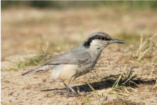
Eastern Rock Nuthatch by Yoav Perlman

21 st May: Our exciting day was spent in the mountains south of Samarkand, at and near Takhta-Karacha mountain pass of 1,700 m. It was a wonderful day of excellent birds giving breathtaking views, with a backdrop of the mighty Pamir Mountains. The list of quality birds we saw is too long, but Eastern Rock Nuthatch, White-throated Robin, Lammergeier and Red-headed Bunting were some of the favourites. Other highlights included Upcher's Warbler, the rare ' vittata ' morph of Pied Wheatear, Finsch's Wheatear, Hume's Short-toed Lark, Grey-headed Goldfinch, Indian Paradise Flycatcher, Eastern Orphean Warbler, Tawny Pipit and many more. We even had a group rarity find – Rusty-tailed Flycatcher, the first for the Samarkand region. We returned to Samarkand late in the afternoon, tired but very satisfied.