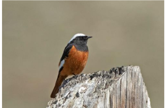
Güldenstädt's Redstart