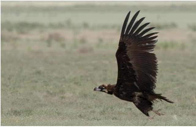
Cinereous Vulture by Yoav Perlman