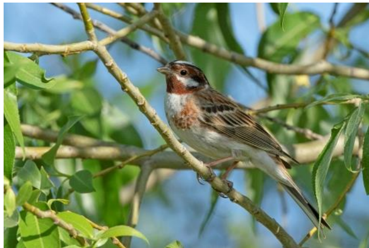
Pine Bunting by Yoav Perlman

On the outskirts of Nursultan, we had a pretty male Pine Bunting – what a fine bird to end an excellent day.