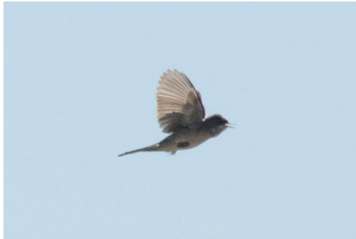
Menetries's Warbler by Yoav Perlman

20 th May: We left Bukhara early and spent the morning birding near the eco-centre again, to catch up with some species we missed during our first visit. Looking across the vast plains off Gibbs Hill, we were rewarded with flight views of two MacQueen's Bustards and three Ruddy Shelducks. In the scrub by the Aralo-Bukhara Canal, we had a few Menetries's Warblers. They were hard work, but eventually the whole group obtained good views.