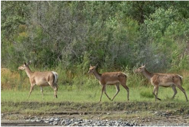
Bukharan Red Deer