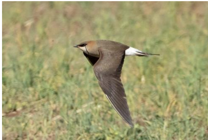
Black-winged Pratincole by Yoav Perlman

We headed further west, picking up quality species along the road, such as Black and White-winged Larks, Demoiselle Crane and Pallid Harrier. Not too far from Nursultan, we found a pair of the critically endangered Sociable Lapwing, alongside tens of Black-winged Pratincoles. We watched them in awe, from a safe distance – such a privilege.