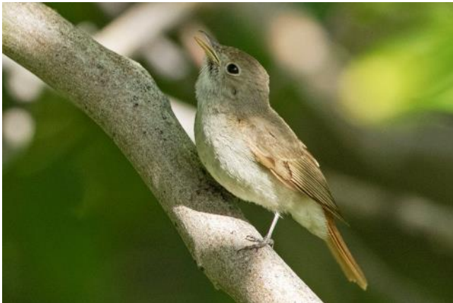
Rusty-tailed Flycatcher by Yoav Perlman