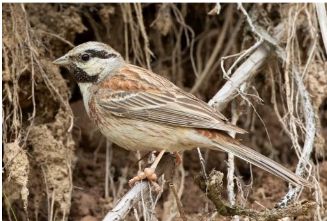
White-capped Bunting by Yoav Perlman

17 th May: We assembled at our hotel in Tashkent, met up with our local guide, Timur, and left very early towards the ski resort of Beldegray in the mountains to the east. Along the way, we picked up a few species of interest, including brief Blue Whistling Thrush. We spent much of the day birding the grounds of Hotel Beldegray, under the mighty Mt Chimgan. Birding was nothing short of excellent. We received a good introduction to common Uzbek specialities, such as Yellow-breasted (Azure) Tit, Turkestan (Great) Tit and Hume's Whitethroat. We had good views of most of our target species, including White-capped Bunting, Rufous-naped Tit and White-winged Woodpecker. We had good raptor activity including three vulture species. We even had a flyover Amur Falcon, potentially a first for Central Asia! In the afternoon, we headed back to Tashkent, stopping to check a couple of wetlands in the Chirchik river valley, adding quite many species, including our first large flocks of Rosy Starling. In the evening, we took the speed train from Tashkent to Bukhara.