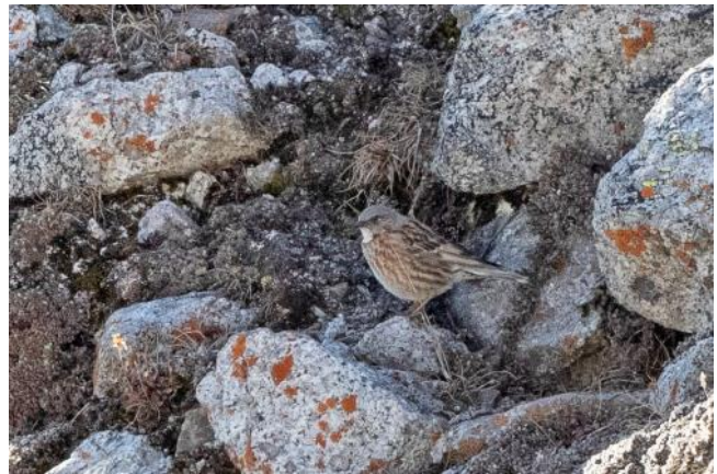
Altai Accentor

We made a few more birding stops on our way back to Almaty, to catch an afternoon flight to Nursultan (until recently named Astana). On our way from the Nursultan airport to the city, we added Pallas's and Steppe Gulls to our trip list.