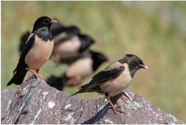
Rosy Starlings