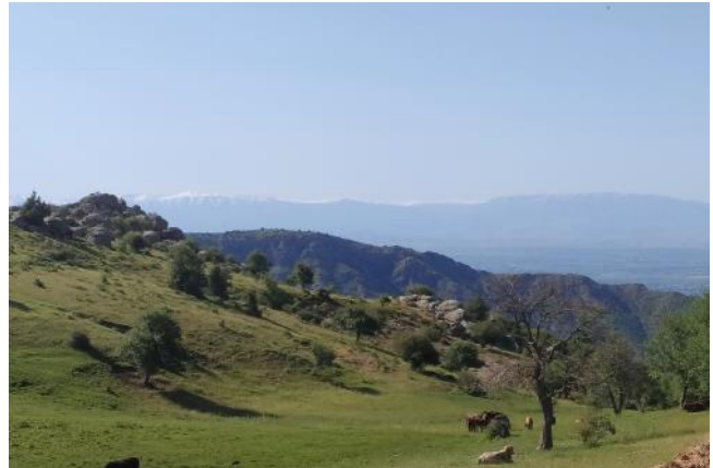
Takhta-Karacha Mountain Pass

22 nd May: This was a day of passage between Samarkand and Tashkent, yet we saw some excellent birds. The first birding stop was just at the outskirts of Samarkand, where we checked the Zeravshan wetlands. There, we had Citrine Wagtail, Temminck's Stint, White-crowned Penduline Tit and Eastern Olivaceous Warbler. We also had four endemic Bukharan Red Deer. Our next stop was a cliff face by Amir Temur Gate near Jizzakh. We had a great time there, with Saker, Lammergeier, Egyptian Vulture, Long-legged Buzzard and Lesser Kestrel all nesting on the same cliff, and White-winged Woodpecker performed well.