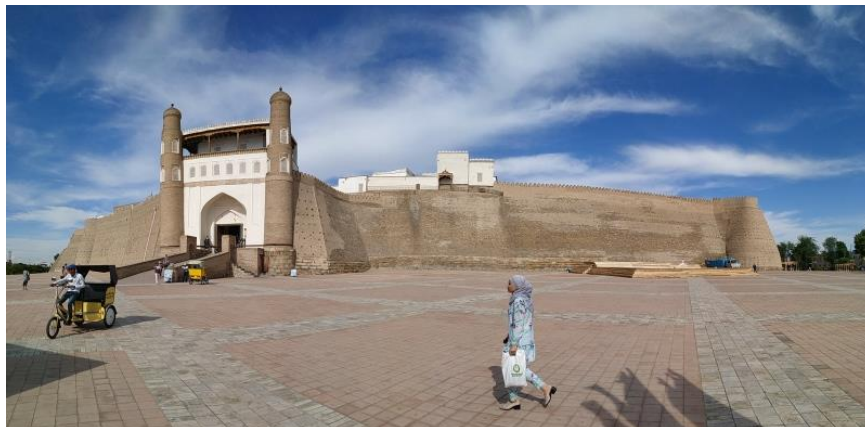
Bukhara Old City Gate

In the afternoon, we went on a fascinating sightseeing tour of the fabled old city of Bukhara, admired its ancient monuments and even enjoyed some urban birding.