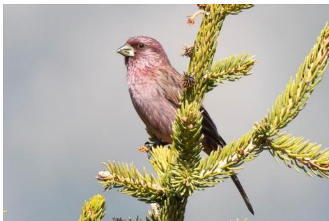
Red-mantled Rosefinch by Yoav Perlman

After a lovely picnic lunch with the best view in the world, we headed further up and birded around the observatory in some fantastic upland habitat. There, we had brief views of White-browed Tit-Warbler, but Himalayan Rubythroat, Red-mantled Rosefinch and White-winged Grosbeak all showed very well.