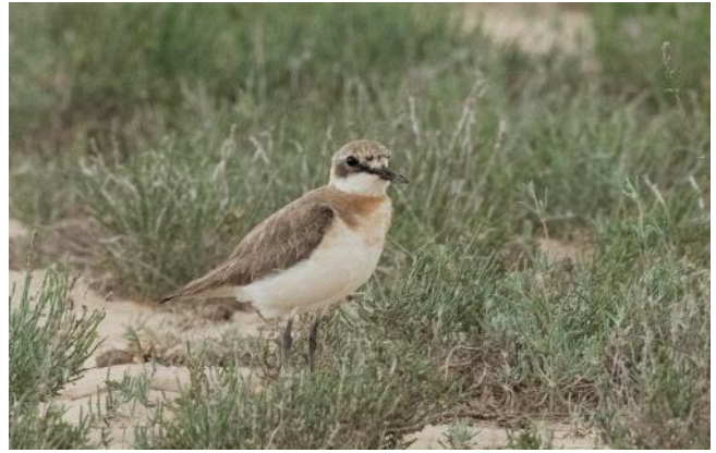
Greater Sand Plover by Yoav Perlman