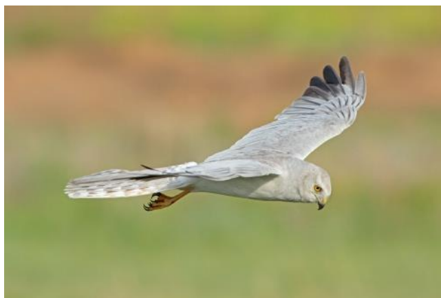
Pallid Harrier