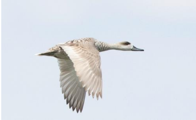
Marbled Duck by Yoav Perlman

views. Rufous-tailed Scrub Robins were very active too, and the plantations were full of migrants. The wetlands held a lovely array of waterbirds, including the globally threatened Marbled Duck, Red-crested Pochard, Pygmy Cormorant, Collared Pratincole, White-tailed Lapwing and Temminck's Stint. Stunning Blue-cheeked Bee-eaters were hawking for dragonflies over the water, and surprisingly a flock of four Shikra were seen hawking for migrating Painted Ladies very high up.