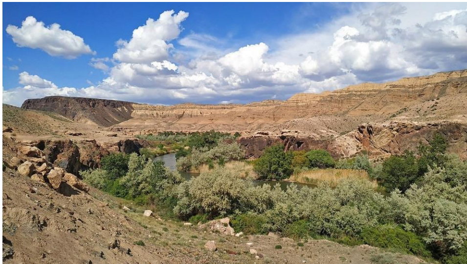
Charyn Canyon

We crossed the impressive Charyn Canyon on the way to the mountain pass of Temirlik, overlooking the frontier zone with Kyrgyzstan. A roadside stop produced Siberian Stonechats and a singing male Meadow Bunting. In the evening, we headed back to Almaty for a much-needed hot shower and chill-out.