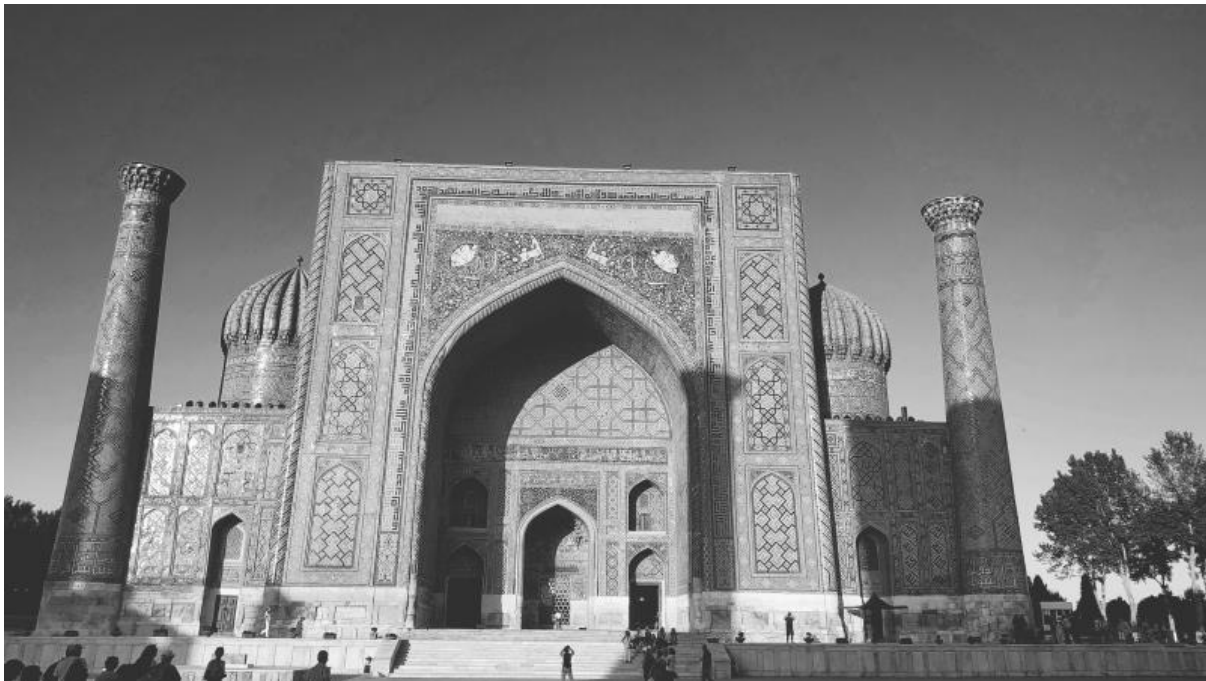
Gur A-Emir Mausoleum, Samarkand