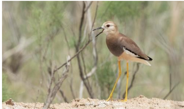
White-tailed Lapwing by Yoav Perlman

In the afternoon, we went on a fascinating sightseeing tour of the fabled old city of Bukhara, admired its ancient monuments and even enjoyed some urban birding.