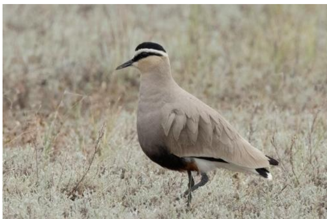
Sociable Lapwing by Yoav Perlman