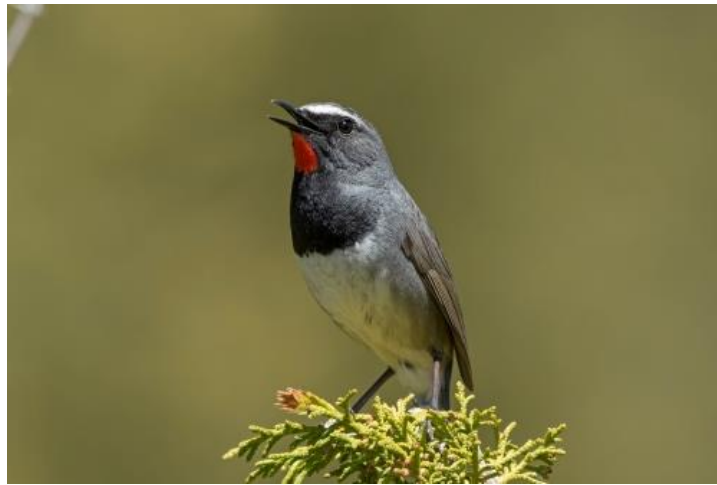
Himalayan Rubythroat by Yoav Perlman

30 th May: Today was our last day in the Almaty region. We left early and headed straight up to Kosmos Station. We saw good high-altitude species up there – Altai and Brown Accentors, Plain Mountain Finch, Güldenstädt's Redstart and Himalayan Snowcock.