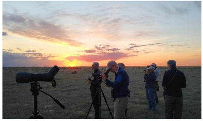
Sunrise over the Taukum Desert

After breakfast back at the camp, we set off on our long journey to the Charyn region. We stopped to bird at Kokpek mountain pass. White-capped and Rock Buntings, Chukar and Crag Martin, both rock thrushes, made for very enjoyable birding. We arrived at our accommodation at Shunja quite exhausted, but full of excitement to bird in this breathtaking region, on the frontier with China.