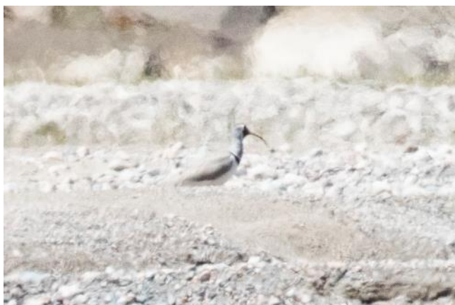
Ibisbill