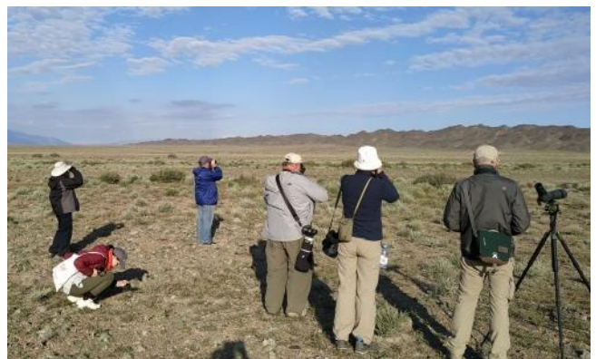
Birding Sogety Valley