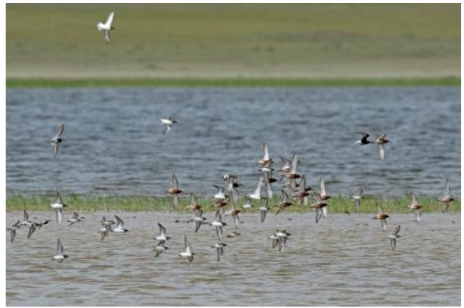
Red-necked Phalaropes, Curlew Sandpipers, Dunlin, Little Stint and White-winged Tern by Yoav Perlman

On the outskirts of Nursultan, we had a pretty male Pine Bunting – what a fine bird to end an excellent day.