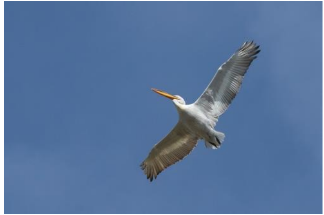
Dalmatian pelican

We then drove on towards our tented camp near Kanshengel in the Taukum Desert. In the afternoon, we birded on foot out of our camp and enjoyed watching birds coming in to drink at a nearby waterhole. Highlights included Bimaculated, Calandra, Asian and Lesser Short-toed Larks, Black-bellied Sandgrouse, many Red-headed Buntings, Pallid Harrier, Steppe and Eastern Imperial Eagles and Greater Sand Plover.