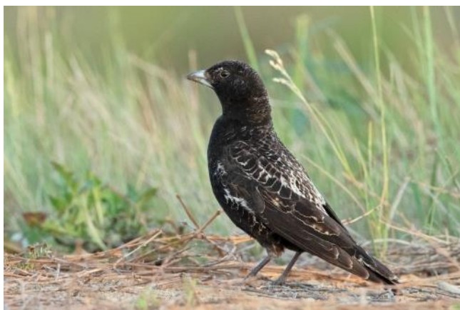
Black Lark by Yoav Perlman