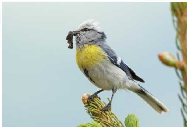
Yellow-breasted (Azure) Tit by Yoav Perlman

18 th May: We left Bukhara early in the morning and headed south into the desert. We first stopped at Gibs Hill, overlooking the conservation zone of Jeyran Eco-center. No bustards, but we enjoyed a great selection of mammals, including Przewalski's Horse, Asian Wild Ass (Onager) and Goitered Gazelle. We then birded around the eco-centre headquarters and adjacent wetlands that were teeming with birds. The Tamarix scrub held both Sykes's and Eastern Olivaceous Warblers, allowing good close comparative