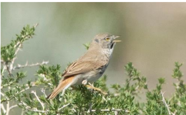
Asian Desert Warbler by Yoav Perlman