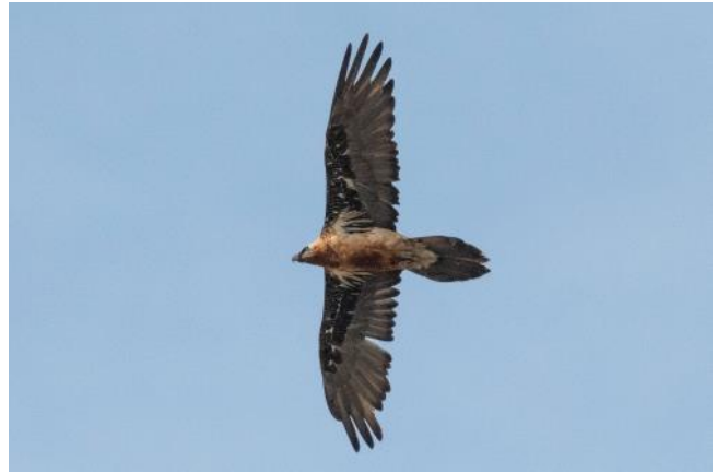
Lammergeier

Our last stop was Sirdarya fish farms, where we added several new birds to our trip list, including the globally threatened Ferruginous Duck, Caspian Tern and Purple Heron. Our final evening in Uzbekistan was spent in a good restaurant with our hosts from Olympic Tours – a great ending to a fabulous stay here.