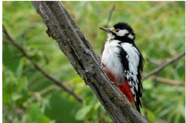
White-winged Woodpecker by Yoav Perlman