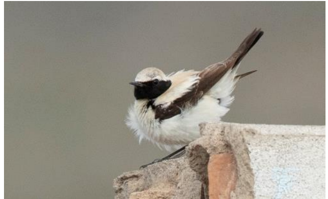
Desert Wheatear by Yoav Perlman