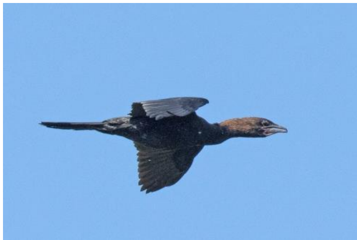
Pygmy Cormorant

We then continued further west to Kyzylkum teahouse, where we had breakfast, but primarily birded the teahouse grounds that held excellent birds, including Shikra, and had good views of Greenish Warblers. We then stopped at a couple of other rest stops along the main road, and a small lake that attracted many migrants crossing the vast desert. We added quality birds such as Upcher's Warbler, Greater Sand Plover and Red-necked Phalarope. The last birding stop of the day was at the beautiful habitat by the Karaqir canals. We added a few common wetland birds to our ever-growing list, and enjoyed good birds such as Pygmy Cormorant, Turkestan Shrike, Savi's Warbler and a great density of Clamorous Reed Warbler. Then we took the long way back to Bukhara.