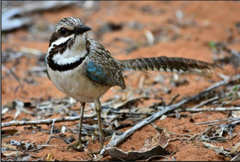
Long-tailed Ground Roller

Today, our itinerary involved leaving Fort Dauphin and flying to Tulear to drive to the small seaside town of Ifaty. Regrettably, our flight left four hours late, so this narrowed our birding time down for our afternoon. When we arrived in Tulear, we were greeted by intensely strong winds, which in turn made our birding day even more challenging. We paused at the Belalanda Wetlands, and here we caught sight of Greater Flamingos, Kittlitz's and Common Ringed Plovers, as well as Black-winged