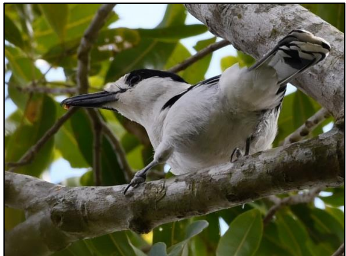
Hook-billed Vanga