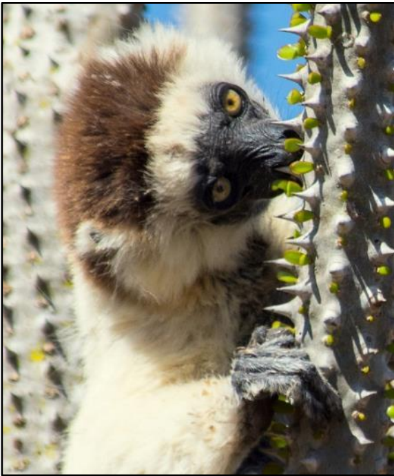
Verreaux's Sifaka

excellent photographic opportunities of two Verreaux's Sifakas sitting in the Didierea plants.