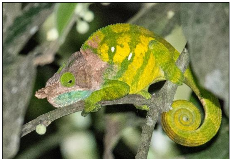
O'Shaughnessy's Chameleon by Gareth Robbins

After an appetising breakfast, we went back to the parking lot, where we saw a very chilled Cuvier's Madagascar Swift sunning itself on a large tree. Here we also watched the Sickle-billed Vanga pair attempt to start building a nest in between the tree branches. Once we had walked up the back of the reserve, we spotted an impressive roosting/sleeping Totoroka Scops Owl. Moreover, we identified a Milne-Edward's Sportive Lemur which was hovering in a broken branch of a dead tree. What's more, we were lucky to get multiple views of Red-capped and Coquerel's Couas, as well as Madagascan Buttonquails. We then