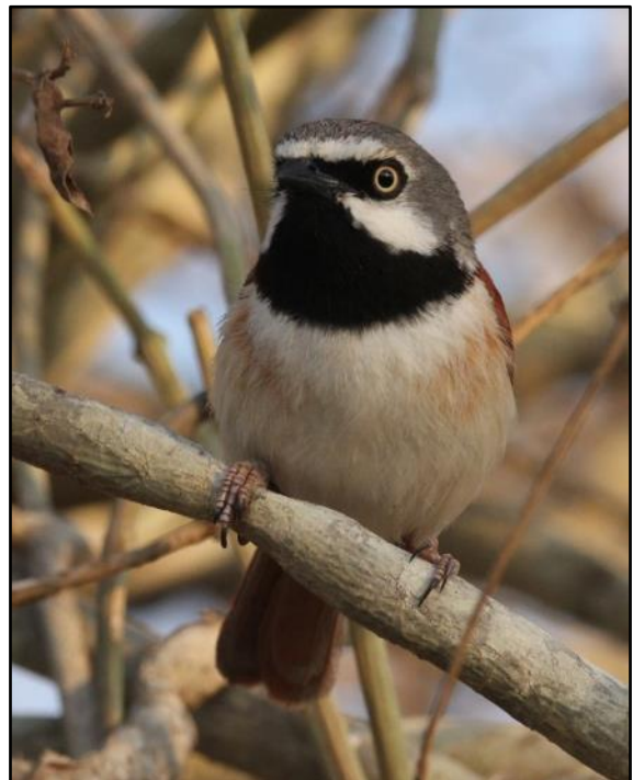
Red-shouldered Vanga by Marianne Wakelin

We departed from our hotel in Tulear and made our way back to La Tabla with Mosa and Freddy. We were in utter amazement: within a couple of minutes of searching, we could hear the Red-shouldered Vangas calling. The entire group succeeded in seeing the male and female Red-shouldered Vangas well, and countless photographs were taken! We still had one