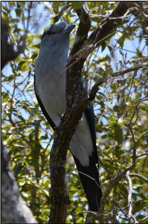
Cuckoo Roller by David Krueper

depressing, after learning about how much forest had been destroyed and taken away for charcoal and the likes. We also passed a few Sapphire towns, until we found ourselves travelling through the striking sandstone mountains, belonging to the Isalo National Park. After some scenic photos were taken, we drove through to our picturesque lodge, nuzzled within the mountains. We headed out for our afternoon excursion, where we got brief sightings of Madagascan Partridge, Madagascan Buttonquail and Carpet Chameleon. We returned to our luxurious lodge and continued to bird, achieving decent looks at Madagascan Hoopoe and another look at White-throated Rail.