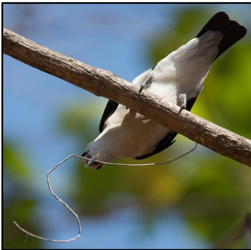
Sickle-billed Vanga