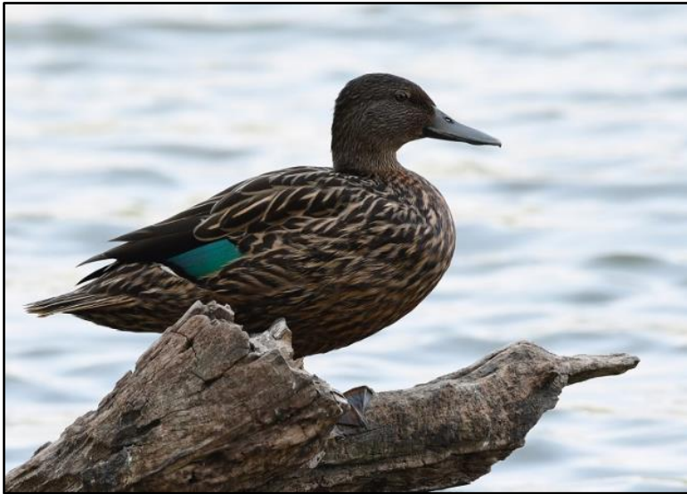
Meller's Duck

A few of us landed in Antananarivo today, from Johannesburg South Africa, and this was the first day of the tour. Thankfully, the airport was very quiet, so it only took us one hour to get through