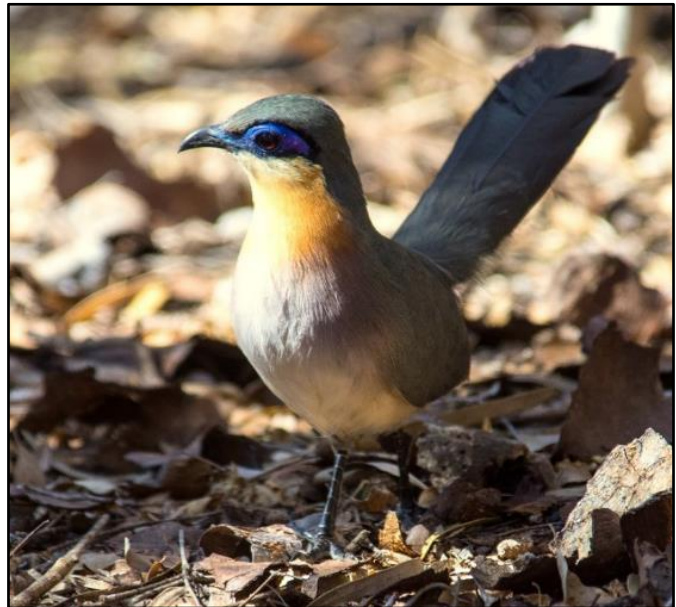
Giant Coua

Today we were sure that we wanted to go back to another section of Spiny Forest, in search of a few more bird species, as well as other intriguing creatures. As soon as we climbed aboard the bus and drove off, we halted for two Madagascan Green Pigeons, which were perching themselves in the branches of a tree near the parking lot. We then carried on to the spiny forest and here we got yet another view of Running Coua, as well as Madagascar Iguana (Three-eyed Lizard), White-footed Sportive Lemur and two Hissing Cockroaches.