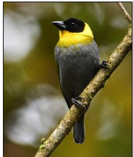
Nelicourvi Weaver

After two eventful and fruitful days in Mantadia National Park, we were certain that we wanted to re-visit the Perinet Special Reserve. We had heard the Rainforest Scops Owl call every night to date, and one of our main targets this morning was to see this bird on its day roost. Our first new bird of the day was a Long-billed Bernieria, as well as close up views of a Madagascan Brush Warbler. After searching for a few known Rainforest Scops Owl roosts, we had no