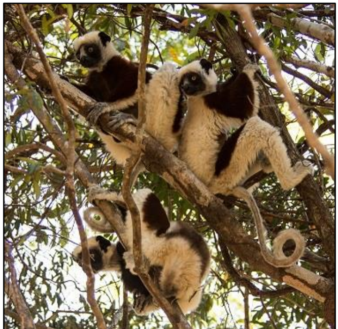
Coquerel's Sifakas

After a dash of coffee, we set out in the hopes of finding