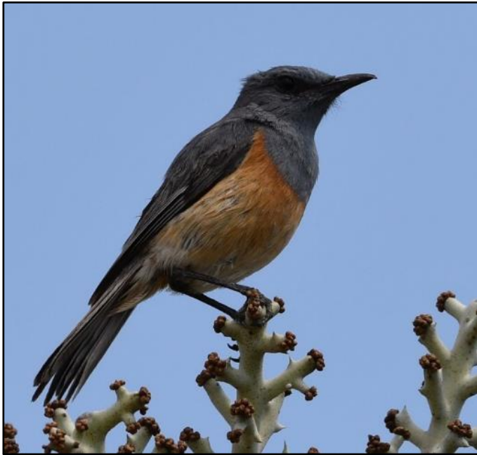
Littoral Rock Thrush by David Krueper

strolled along the beach, spotting Red-tailed Tropicbird, Greater Sand Plover, Dimorphic Egret and Ruddy Turnstone. Having decided not to snorkel, we headed to the beach town of Anakao, where we had a mouth-watering Fish Skua meal, and we also managed to get exceptional views of a male Littoral