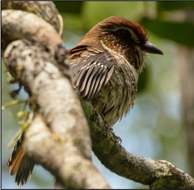
Short-legged Ground Roller

Flycatcher, Madagascar Starling and Madagascar Cuckooshrike. We then climbed aboard our 4x4's and drove to our first spot to try and find our first Ground Roller. We heard a Pitta-like Ground Roller calling but, alas, we never managed to view this bird. We were lucky enough to have the opportunity to