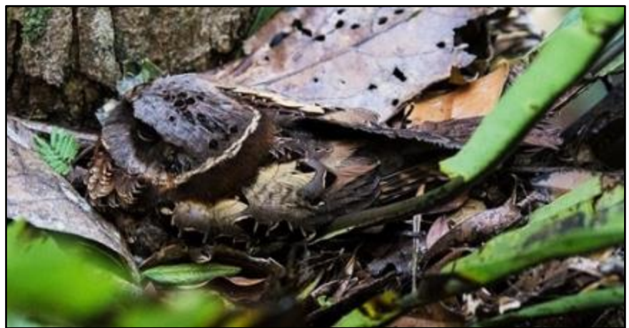
Collared Nightjar