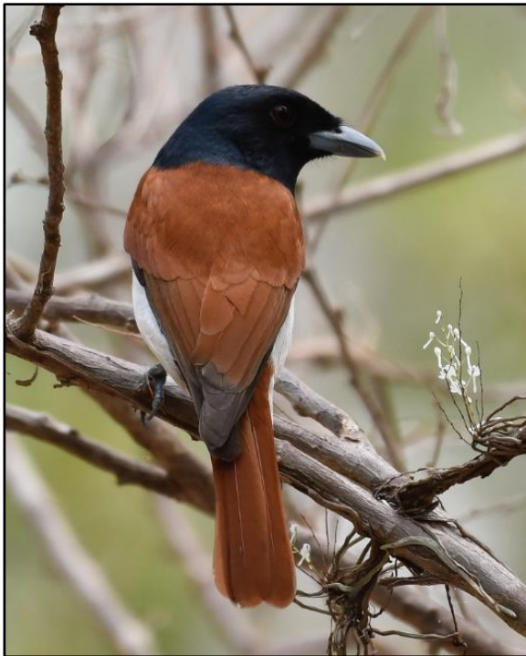
Rufous Vanga

advanced to the lodge for lunch and a siesta, after which we endured a boat ride in the nearby dam. On the way to the boat, we were in luck with seeing Humblot's Heron, Black Heron, Three-banded Plover and one Madagascar Jacana.