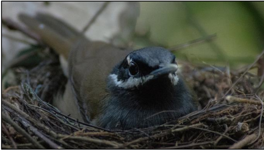
Crossley's Vanga by Gareth Robbins

managed to get some respectable looks at a Madagascan Rail as it moved amongst the vegetation. After entering the park, we reached a river stream where some of the group were able to get a view of a female Velvet Asity. As we neared our final destination, we noticed another Madagascan Pygmy Kingfisher. We then embarked upon a new trail, where we came across some new bird species, such as