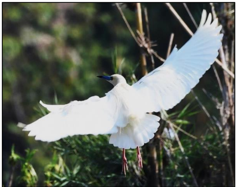
Malagasy Pond Heron

After enjoying an early breakfast, we made our way back through the city of Antananarivo and headed in a northerly direction to the Perinet Special Reserve, also known as Andasibe. En route to the reserve, we passed a few rice paddies,