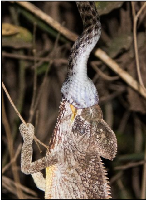
Madagascar Tree Boa catching an Oustalet's Chameleon

White-throated Rail. The tide was still high, but there were enough mud-banks for us to see some birds. In fact, this allowed for the bird concentrations to be far larger, as they were restricted to only a few areas. We saw our very first Madagascan Ibis perching on a branch hanging above the water. The Ibis gave us some good time to photograph it before it took off. We then went across the delta to another