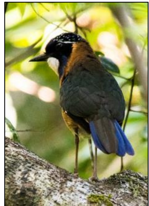
Pitta-like Ground Roller

We then persisted along the trail until we came across male and female Common Sunbird-Asities. The next thing, a Rufous-headed Ground-Roller was calling! It took us the remainder of the morning to get most people onto this highly secretive bird. Further along the path, a number of us saw a Brown Emutail. The next bird which was seen was a Pollen's(??) Vanga, with its enormous bill showing itself off directly above us. A couple of interesting insects and reptiles were detected, and these were O'Shaughnessy's Chameleon, Giraffe Weevils and a very well camouflaged stick insect. We then gradually made our way back to our hotel for lunch; and then after lunch, we went back out for an afternoon walk in the main section of the Ranomafana National Park.