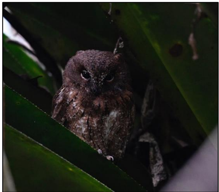
Rainforest Scops Owl by David Krueper

We left Tana after a scrumptious breakfast and made our way to the airport, where we took a short flight to the seaside town of Fort Dauphin. The road to Berenty is notorious for the potholes, and it took us four hours to get to the lodge. En route to the lodge, we witnessed plenty of Pied Crows, Yellow-billed Kites, Madagascar Cisticola, Crested Coua, Dimorphic and Great Egrets, Black Heron and a Green Jery. In time, we arrived at the Berenty Lemur Reserve; and as we entered through the boom gate, we were greeted by the local Ring-tailed Lemurs. The Ring-tailed Lemurs gave us enormous entertainment whilst we had our lunch, and then we headed back out in search of more birdlife with our local guide, Mbola, in the Gallery Forest. It was incredible to be in a different type of forest plain, one that was denser as well as more open – this made our birding a lot easier . New birdlife we saw this afternoon included a pair of Madagascan