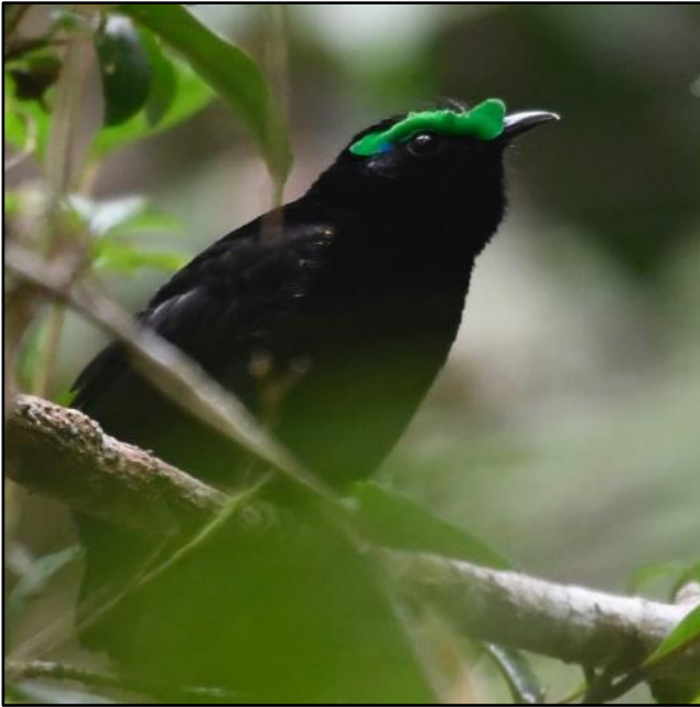
Male Velvet Asity