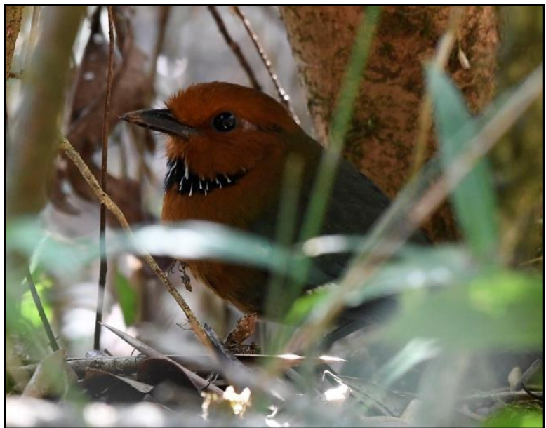
Rufous-headed Ground Roller by David Krueper

Today, we paid another visit to the Sahamalaoatra trail at the top of the National Park to attempt to see the birds we had not yet seen. We instigated the experience with looking for the splendid Pitta-like Ground Roller and male Velvet Asity – we were indeed victorious! We were also triumphant in