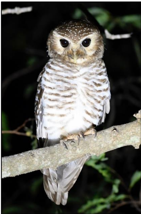
White-browed Hawk Owl

Hoopoes, Olive Bee-eaters and a perfect unobstructed view of a Giant Coua crossing the path right in front of all of us. As we commenced on our journey to the lodge, we heard a White-browed Hawk-Owl call, but we never managed to locate the bird. In addition, we saw Frances's Sparrowhawk and Malagasy Kestrel and then we called it a day. After an enchanting dinner, a couple of guests found a