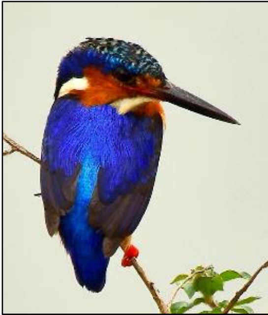
Malagasy Kingfisher

which produced sightings of Squacco Herons, Hamerkop, Dimorphic and Great Egrets, Malagasy Kingfisher and a Striated Heron. In addition, we had two Malagasy Coucals make an appearance and we managed to get decent scope views of this vocal bird. Further along this road, we stopped at a