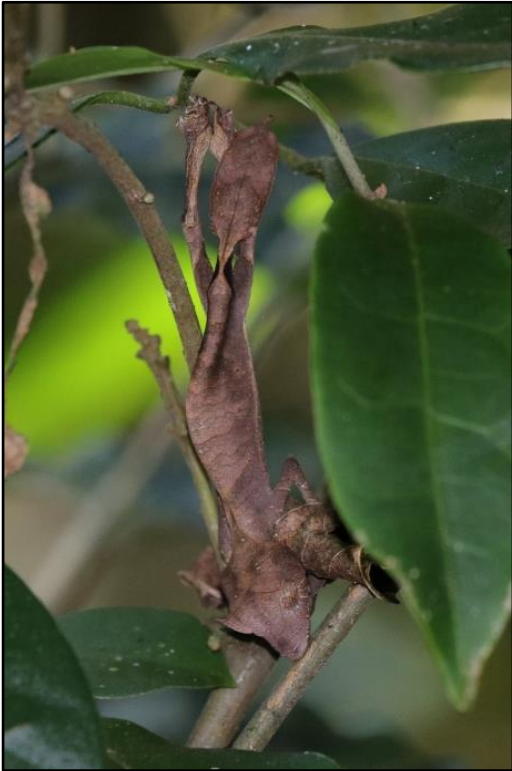
Satanian Leaf-tailed Gecko

along the road to Tana. We went past the bustling town of Antsirabe, and not too long after passing the town, we found a shaded spot to have some lunch. It was at this time that we had sightings of a few very vocal Common Jerys. We returned to the bus and we made our way into Antananarivo. As soon as