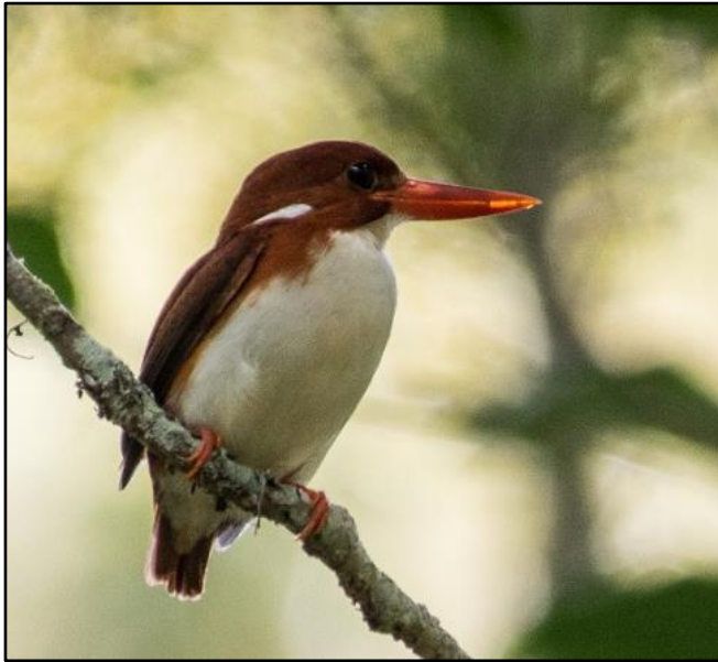
Madagascan Pygmy Kingfisher by Gareth Robbins

luck until Luc struck gold by seeing one of these birds roost in a pandanus on the opposite side of a stream. After some intense 4x4 driving, we all managed to spot the sleepy scops owl. On our way back down towards the stream, one guest spotted a male Velvet Asity in its full glory! The rest of us all hurried back to gain outstanding views of this magnificent bird. We tried our luck for another sighting