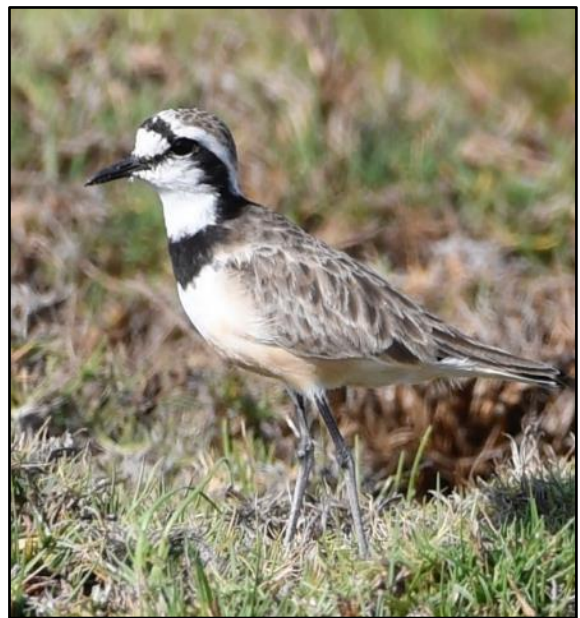
Madagascan Plover by David Krueper

We then drove to Tulear, and we arrived at the Safari Vezo dock, where we hopped onto the Zebu carts and bounced around along the seashore to the boat. As it was low tide, we had to travel quite a distance to the boat. Once aboard the boat, we ventured straight to Nosy Ve. En route, we saw absolutely nothing along the seashore. After some desperate searching, we spotted a couple of Crab Plovers. We were able to disembark off the small sandbar and get some decent scope views of two Crab Plovers. After returning to the boat, we then disembarked on the main island and here we