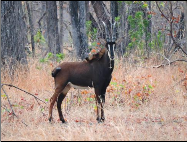
Sable Antelope by Heinz Ortmann

Swallow, Sombre Greenbul, Yellow-bellied Eremomela, Brown-headed Parrot, Greater Blue-eared Starling and Red-billed Oxpecker were some of the other birds new for the tour that we found here. The main target, however, was a bird that prefers tall mopane woodland. It was in an area with some beautiful, mature mopane trees that we found a pair and recently fledged chick of Racket-tailed Rollers! A scarce bird throughout its range, this was a very satisfying sighting, as they allowed lengthy views before we left them in peace.