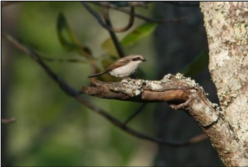
Souza's Shrike by Keith Valentine

The Dzalanyama area of miombo or brachystegia woodland is home to a huge variety of range-restricted species. Miombo Woodland is only found in a small band through south-central Africa, and most of this woodland is found in Zambia, with smaller patches in eastern Angola, Malawi, parts of Mozambique and Zimbabwe. Unfortunately, we arrived at our lodge for the next three nights quite late; but not without any new birds, as we had seen Lizard Buzzard on the way in.