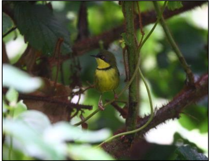
Yellow-throated Apalis by Keith Valentine

The Zomba plateau is now characterised by small remnant patches of forest that dot the plateau. Thankfully, some of the best forest birding in the area is quite close to the hotel, meaning we did not need to venture far to find most of the region's specials. Olive-headed Greenbul was the first local special to be found in the area. Yellow-throated, White-winged and Black-headed Apalises were all seen well, there were exceptionally close views of the stunning Livingstone's Turaco and we also found a Lazy Cisticola on a rocky hillside at the edge of the forest. Blue Monkeys were the constant mammalian presence in the area, with their high-pitched calls often heard in the forest. Just before heading back to the hotel, we were treated to our first views of Red-faced Crimsonwing, which at times can be relatively easy to find here. A super end to a good day!