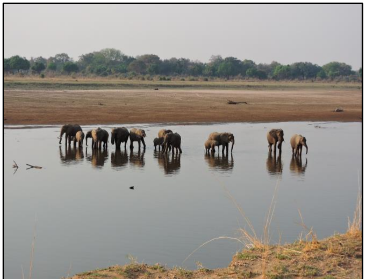
Herd of African Elephant in the Luangwa River

And so ended a fantastic time to the seldom-visited birding hotspot of Malawi and an excellent end to the trip with lots of wildlife in South Luangwa in Zambia! Thanks to a great group of participants, as well as a superb ground operations team.