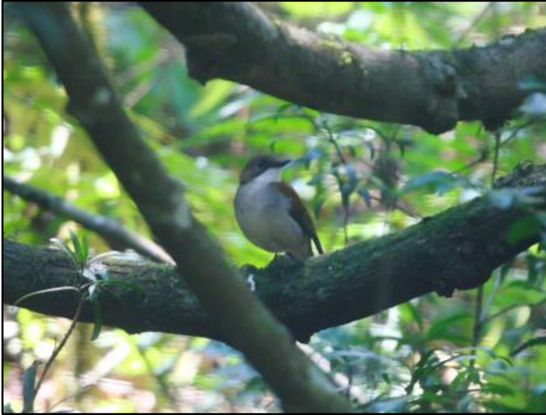
Thyolo Alethe by Keith Valentine

The conditions at Mt Mulanje, where we were hoping to find the range-restricted Vincent's Bunting, were hot, dry and windy, as the effects of the two-year drought were quite evident in the area. Furthermore, there had, unfortunately, been a significant area of the woodland cleared for firewood and/or charcoal, that had taken place even within the boundaries of the reserve and especially along the lower slopes where the bunting had been recorded before. Bird activity and numbers in the area were unsurprisingly low, but we did manage to find several more common species, such as Bronze Mannikin, Cinnamon-breasted Bunting, Yellow-fronted Canary, Olive Bee-eater, Southern Citril, Northern