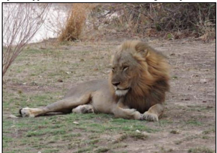
Lion

Being in South Luangwa with several impressive large mammals present, this aspect did take up the majority of our time and provided the group with a number of fantastic sightings and unforgettable experiences. We had numerous sightings of the Luangwa Valley's very own Thornicroft's Giraffe - a truly stunning animal which appears to be doing well, with good numbers of these large creatures seen during our time in the park . South Luangwa is also home to the crawshayi subspecies of Plains Zebra that we had seen previously in Malawi, with the animals in South Luangwa allowing much closer approaches and subsequently better photographic opportunities. It is an interesting subspecies of 'pyjama donkey', as they lack any shadow stripes, which is more similar to the mountain zebras of western Southern Africa than the other subspecies of Plains Zebra that are distinguished by the presence of these shadow stripes. Puku, an antelope in the kob complex, was the dominant species of the open floodplain grassland, which at this time of year was dry with large areas of bare soil. The largest of the land mammals was arguably the one that provided the most entertainment. We had a small family group of African Elephant wander through the lodge grounds every afternoon and one particular afternoon, we all stood in the dining hall area gazing in amazement as