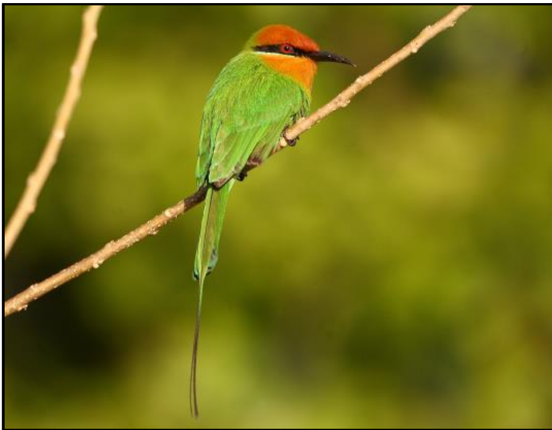
Bohm's Bee-eater