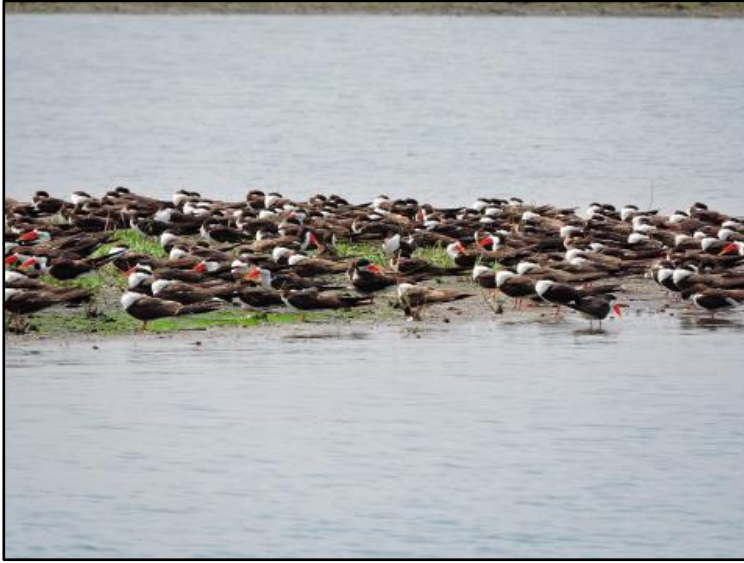
African Skimmers by Heinz Ortmann

The final night drive in Liwonde, yet again, produced several unforgettable sightings. Not long into the drive, two Spotted Hyaenas were found next to the road and we enjoyed a lengthy view of these interesting creatures. The drive outdid the previous night's experience, with as many as six Cape