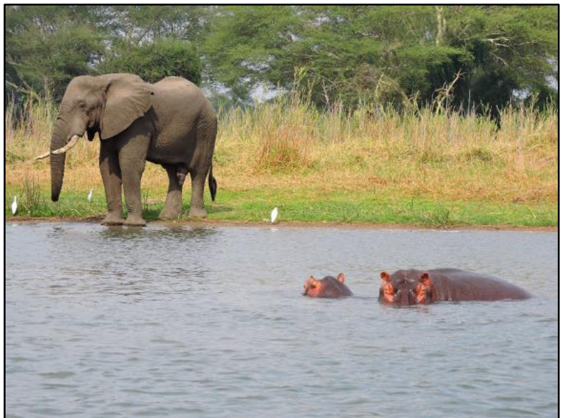
African Elephant and Hippopotamus in Liwonde National Park

The three major targets for the Zomba area, however, are Yellow-throated and White-winged Apalis and Thyolo Alethe. The latter species has become rare due to the wide-scale destruction of its habitat, and is now widely regarded as rare in Malawi. The Yellow-throated Apalis is a recent split from Bar-throated and is the country's only endemic, while the White-winged Apalis is one of Africa's most gorgeous species and is rare to boot, being confined to only a few localised sites in Tanzania's Eastern Arc Mountains, and a few remnant forests in southern Malawi. Our lunch time stop, en route to our hotel atop the Zomba plateau, was a garden on the lower slopes, where we were to look for White-winged Apalis in particular. We were in luck as a pair of apalises was busy nest building but, frustratingly, most of our views were of these birds high up in the canopy!