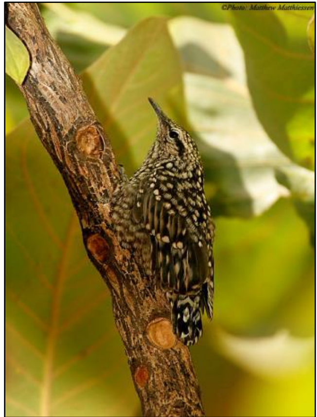
African Spotted Creeper by Matthew Matthiesen

Our next day was a full day of exploring the wonders of Liwonde National Park. The pre-breakfast birding involved a boat trip across the river in a search for the localised Brown-breasted Barbet. Before crossing to the far side of the river, our guide took us along the water's edge near the lodge, where we had the good fortune of finding both Black-crowned and the much scarcer White-backed Night Heron. Wood Sandpiper and Water Thick-knee were also present along the river. Once across the river, we were joined by an armed game scout - as we were walking in an area where Hippo, Elephant and Buffalo are known to occur. It did not take long for us to find the elusive Pel's Fishing Owl. This individual proved to be rather skittish and we had to settle for mostly brief flight views before deciding there was no good in disturbing the bird anymore. Not long thereafter, we came across the dainty Livingstone's Flycatcher, another regional special. In good spirits, we continued on and came across at first one and then two breeding herd of African Elephant. It is difficult to describe in words how surreal the experience is of seeing these large animals when on foot! Not sure of whether or not we were in their space, we decided