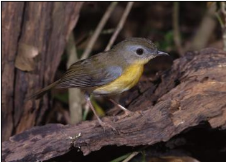
East Coast Akalat by Hugh Chittenden

the very late afternoon, we watched a group of African Green Pigeon whizz past. Our main aim was to try and find the localised East Coast Akalat but with the light fading after a long day's drive, all we managed to find was the much more common Red-capped Robin-Chat. We arrived at our accommodation at Makuzi Beach rather tired and looking forward to the next day.