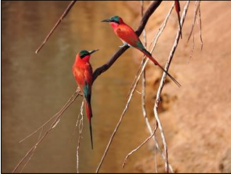
Southern Carmine Bee-eaters

and the course it follows. During our two full days on this extension, the raptors were not surprisingly a common sight, with Hooded, White-backed and White-headed Vultures, African Harrier-Hawk, Tawny Eagle, Bateleur, Martial Eagle, Western Banded Snake Eagle and African Cuckoo-Hawk all seen well. Blacksmith and White-crowned Lapwings, Three-banded and White-fronted Plovers, the impressive