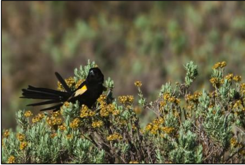
Montane Widowbird

successful in terms of small mammals, but we did see good numbers of Ruwenzori Nightjar and also a Spotted Eagle-Owl.