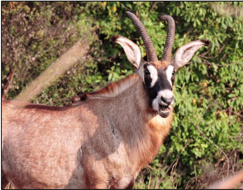
Roan Antelope by Heinz Ortmann

several recently-arrived Blue Swallows! Amazingly, we saw at least three birds perched out beautifully in the morning light! An incredible sighting of these increasingly threatened birds.