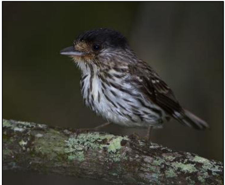
African Broadbill by Hugh Chittenden

Our adventure through the beautiful landscape of Malawi began with an early morning visit to the Lilongwe sanctuary in the capital city. It was noticeable how dry the woodland at this site was, a direct consequence of the two-year drought that Malawi was in at the time. Hot, dry and windy would be some of the more prevalent weather conditions that we would experience on this tour. However, our first morning of birding was a good, relaxed introduction to some of the more common, and a few special, birds that occur in Malawi. Grey-backed Camaroptera, Long-billed Crombec, Yellow-breasted Apalis, noisy Yellow-bellied Greenbul, a colony of Southern Masked Weaver, Cardinal Woodpecker, Arrow-marked Babbler and African Yellow White-eye were some of