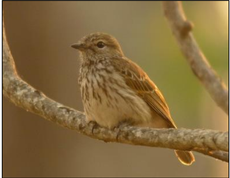
Boehm's Flycatcher by Keith Valentine

widespread species included African Hoopoe, Brubru, Southern Black Flycatcher, Familiar Chat, Chinspot Batis, Green Wood Hoopoe, Common Scimitarbill, Crested Barbet, Black-headed Oriole, Red-headed Weaver, Meyer's Parrot, White-crested Helmetshrike, Brown-crowned Tchagra and Greater Honeyguide. Small raptors were well represented with Little Sparrowhawk, Shikra and African Cuckoo-Hawk all seen. To our surprise, we also flushed a single Coqui Francolin in some of the taller grass that we walked through. A single Black Stork was also seen soaring overhead. Mixed flocks were few and far between and try as we might, we just could not locate any Babbling Starlings - a huge disappointment! However, our time was still well-used, with many specials being found, including Boehm's Flycatcher, Miombo Scrub Robin, Rufous-bellied and Miombo Tits, White-breasted Cuckooshrike, Red-capped Crombec, Stierling's Wren-Warbler and Arnott's Chat to name a few. With time running out, we left Vwaza Marsh behind and headed on to the remote grasslands and forest of the Nyika Plateau.