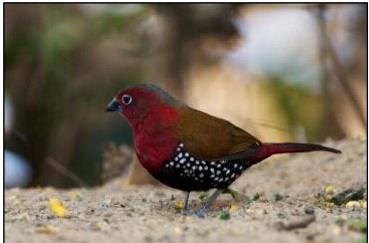
Red-throated Twinspot by Hugh Chittenden

The Viphya Plateau has, unfortunately, not been given the same level of protection as the Nyika Plateau, further north, and is dominated by extensive pine plantations. There are, nevertheless, a good few patches of native vegetation around and the area still holds an excellent variety of species. In our short time of birding the area, we had some excellent views of Bronzy and Variable Sunbirds, Blue and Common Waxbills, Olive Woodpecker, Tropical Boubou, Holub's Golden and Village Weavers, Chapin's Apalis, Ashy and African Dusky Flycatchers, Yellow-rumped Tinkerbird, White-browed Robin-Chat and Red-billed Firefinch in the garden of the lodge that morning! A short walk down to the wetland had Red-rumped Swallows, Black Sparrowhawk, and Shikra and African Goshawk at different times flying overhead. The vegetation on the wetland edges held Little Rush and African Yellow Warblers, and Burchell's Coucal; and although we did not manage to see them, we often heard African Rail. A nearby flowering coral tree produced two cracking birds in one scope view: the range-restricted Bertram's Weaver and a Whyte's Barbet. What a bonus sighting! Red-throated Twinspot and White-starred Robin also spoilt us as we made our way around the dam and back to the lodge for breakfast. A short stop after breakfast, at a patch of broad-leaved woodland nearby, resulted in good views of Trilling Cisticola, Reichard's Seedeater and Yellow-throated Longclaw.