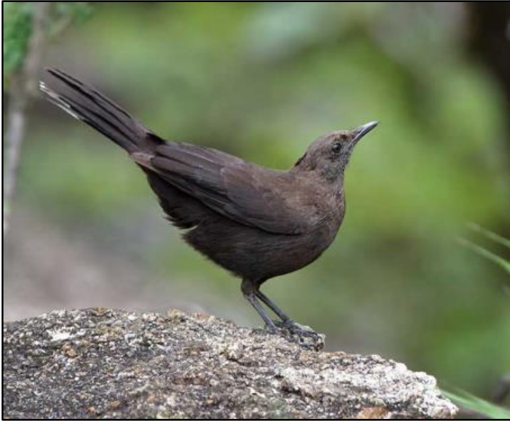
Boulder Chat

breasted Bushshrike were the more widespread woodland species encountered during this walk. Upon finding a mixed feeding flock in the miombo, we managed further views of Southern and Yellow-bellied Hyliotas, Red-capped Crombec, and Miombo and Rufous-bellied Tits, amongst others. The rocky slopes produced Familiar Chat and Mocking Cliff Chat, but after quite a bit of searching, we still had not even heard any Boulder Chat. With our hopes diminishing, we finally found a bird and managed to see it particularly well! This was just fantastic!