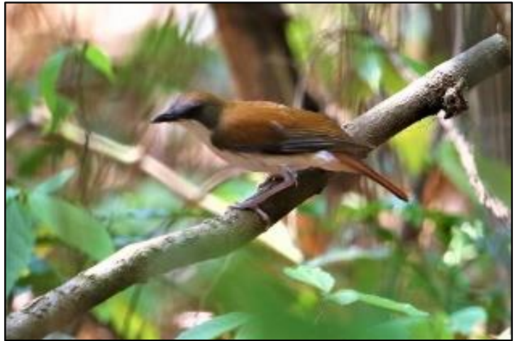
White-chested Alethe by Adam Riley

We then skillfully manoeuvred through the thick vegetation towards the displaying bird, carefully, so as not to make any noise or disturbance. We reached the area just in time. The bird had just dropped to the forest floor and we proceeded to have fantastic views as it foraged between the leaf litter. We made our way back after losing visual and bumped into what we presumed to be a second bird, possibly a breeding pair! Even better views were had, noting the electric blue spots that seem to illuminate through the forest floor. White-chested Alethes proved to be a slight distraction overhead as we viewed this rare Pitta species! Soon after, we heard an African Broadbill and managed to locate a bird as it foraged unusually high up. To our surprise, a stunning male Plain-backed Sunbird popped into view and gave great views as these two specials foraged alongside one another.