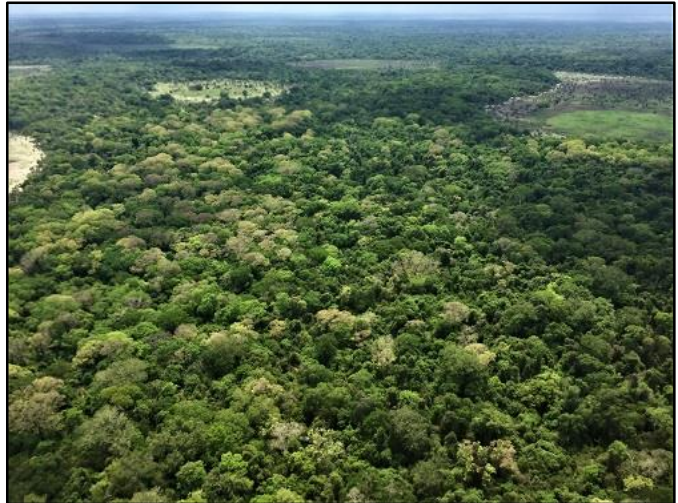
Coutada 11 by Andre Bernon

Within the Zambezi River delta lays Coutada's 11 & 12. This roughly 1,2 million hectare wilderness is so vast and under-birded that it certainly warrants some serious attention on the avian tourism front. Upon arrival, one can truly see and sense the excitement that this area holds. This dynamic landscape, with huge tracts of sand forest, lowland forest, vast floodplains with papyrus swamps and a mosaic of small seasonal pans, plays host to bird and mammal species that are simply mouth-watering. A total of 7 days were spent here with a total of 248 bird and 29 mammalian species recorded. African Pitta, White-chested Alethe, Livingstone's Flycatcher, East Coast Akalat, Wattled Crane,