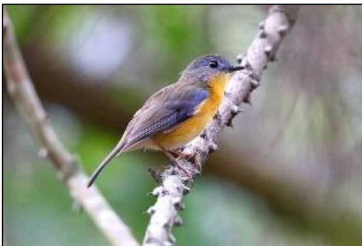
East Coast Akalat

put in an appearance, as well as a flock of Wood Sandpiper and African Openbill in the distance. We retired to bed to the call of our African Wood Owls after a much-deserved dinner and a successful first day.