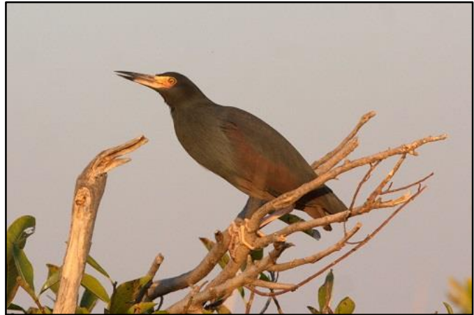
Rufous-bellied Heron by Markus Lilje

A Striated Heron flew past, as well as many Western Cattle and a few Great Egrets. We continued after a very successful morning and explored some nearby wetlands along the Zambezi River. The first bird to draw our attention was a hiding Rufous-bellied Heron. Also evident were many Southern Brown-throated Weaver, Malachite Kingfisher, Lesser Swamp Warbler, Short-winged Cisticola, Common Sandpiper, Reed Cormorant and a single Little Bittern. We stopped for lunch along the river, yet again, and this time we were surprised with a huge thunderstorm. Not long after it passed, hundreds of Common House Martins flew