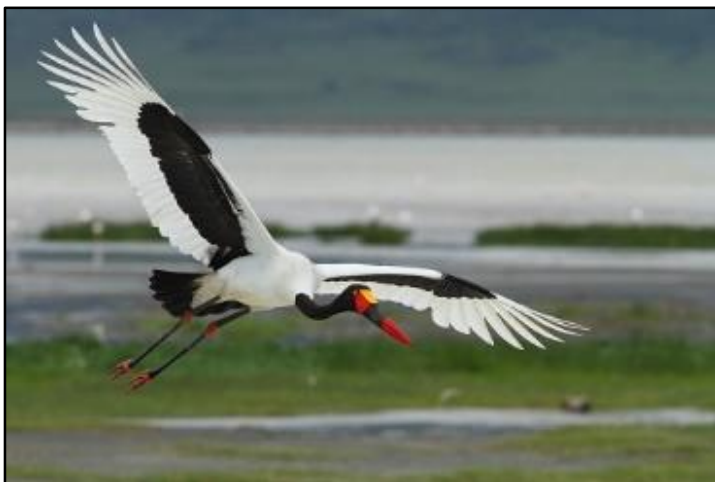
Saddle-billed Stork by Markus Lilje

south, following the storm. Amongst them were a few Grey-rumped Swallow, which is always nice to see. African Jacana lined the water's edge and a quick sighting of a Greater Painted Snipe was also had. We made our way back to the place we now called home. A quick stop along the Zangue River produced many Orange-breasted Waxbill, a Long-crested Eagle, a stunning Pink-backed Pelican, many African Openbill, Squacco Heron and both Purple and Grey Herons. We stopped for a leg stretch on the border of Coutada 12 and couldn't believe it: another African Pitta calling right next to us. We slowly headed into the thick bush and we were extremely lucky to find the bird displaying about 3 metres off the ground. We watched this fantastic bird displaying several times! A truly remarkable sight as he makes a single call note accompanied by a mechanical wing beat, whilst simultaneously jumping about 15-20 centimetres off of a lateral branch. In doing so, the bright electric blue tail and wing coverts are shown off and upon landing, the tail moves up and down very slowly. Close to "home", we stopped to visit the grave of Mary Moffatt - who was married to the famous David Livingstone, after whom so many bird species are named after. A flock of Common Swift was observed following the storm and a pair of Senegal Coucal were viewed enjoying a freshly made puddle of water. We retired to sundowners around the fire with great stories from a fantastic day!