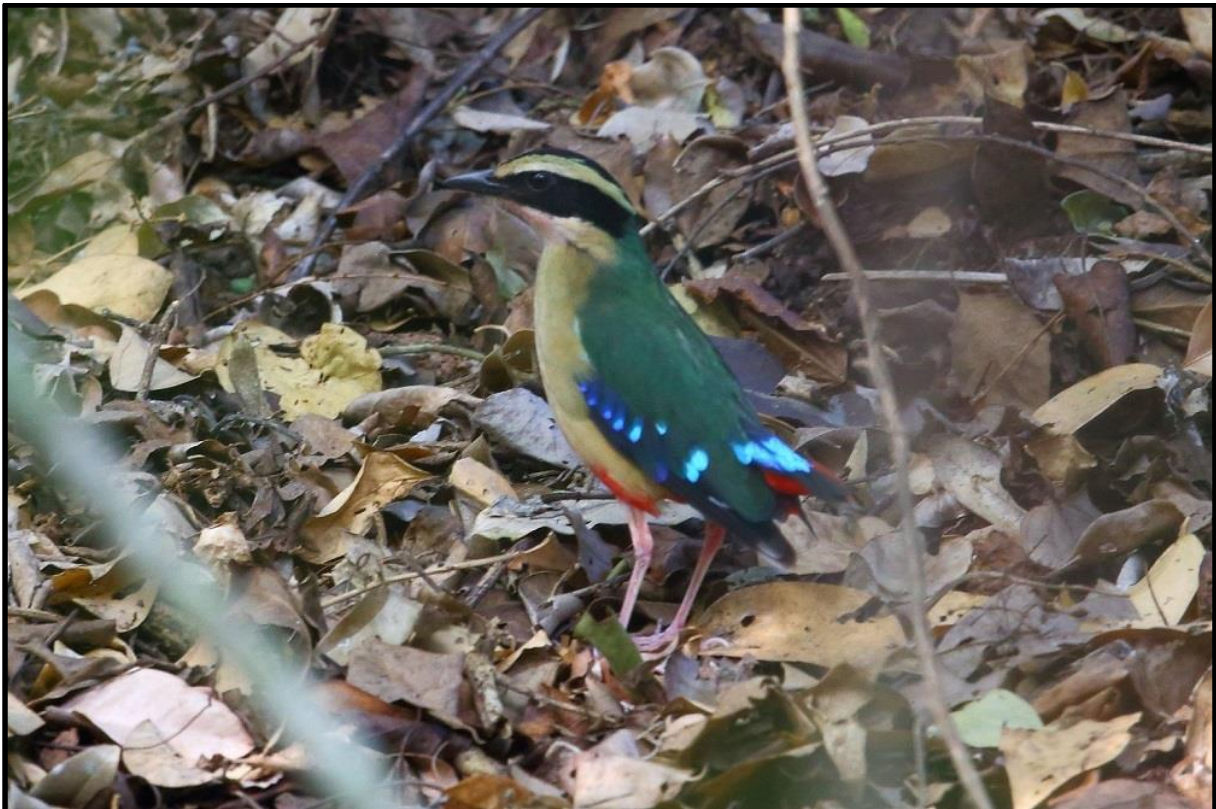
African Pitta