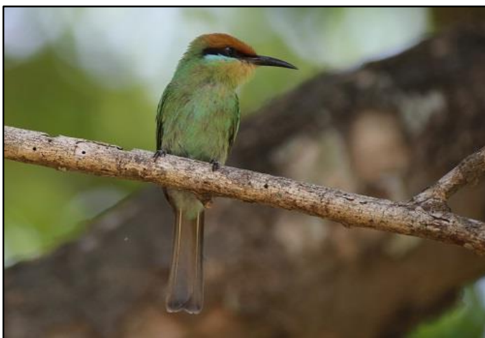
Bohm’s Bee-eater by Tony Ridl

Today was set aside to try our luck in finding the rare Bohm’s Bee-eater, which had only recently been discovered as a population south of the mighty Zambezi River. This bird is otherwise restricted to the Shire River valley in southern Malawi. We left early and had European Nightjar and Four-toed Sengi before the sun had risen. A Southern Banded Snake Eagle perched up in a dead tree and whilst we viewed it, a young African Cuckoo Hawk darted across and landed too. Lesser Striped Swallow,