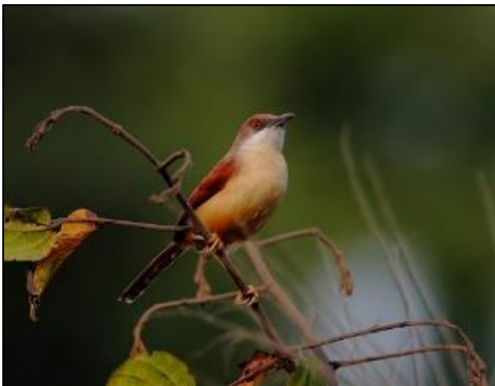
Red-winged Warbler by Glen Valentine

Grey Waxbill, Eurasian Golden Oriole, a small flock of Green-capped Eremomela and Red-faced Crombec. On our way back to camp we stopped at a pan with some papyrus and were lucky to have a brief visual of a Black Coucal. Other species encountered were Eastern Golden Weaver, Rufous-winged Cisticola, Tawny-flanked Prinia and Black Crake. Our afternoon outing saw us heading further west toward the border of Coutada 12, where we had some fantastic birding around a small pan which had a little water. As we neared the pan we passed through a section of taller grass and were surprised when we flushed a large Crake with bright rufous wings - Corn Crake! A small family of Long-toed Lapwing looked on in hesitation as well as the larger African Wattled Lapwing. An African Fish Eagle sat at the edge of the water, as well as a single Purple Heron. Thick-billed and Eastern Golden Weavers were plentiful in the reeds. After some sundowners, we brought out the torch instantly found a Square-tailed Nightjar. A few more were seen along the way, as well as a special mammal sighting in the form of a single Bushy-tailed Mongoose with a few Common Genets and Suni here and there. We were pleasantly surprised with the quantity of European Nightjar sightings as we headed away from the floodplain.