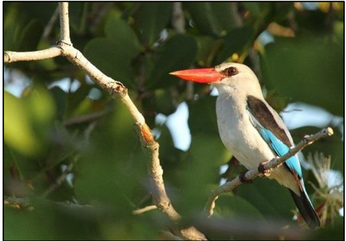
Mangrove Kingfisher

An area of taller grass was searched and produced our target, the Red-winged Warbler, as well as a stunning Grey-hooded Kingfisher. A White-headed Vulture and African Goshawk showed well and as we continued into a small patch of “dry or sand” forest, we were surprised to hear the call of yet another African Pitta! African Wattled Lapwing and Yellow-throated Longclaw showed well at a small forest clearing. We proceeded to bird another section of miombo and managed to locate many mixed flocks of bird species. We stopped and scanned through each of these flocks and were rewarded with sightings of Stierling’s Wren-Warbler, Tropical Boubou,