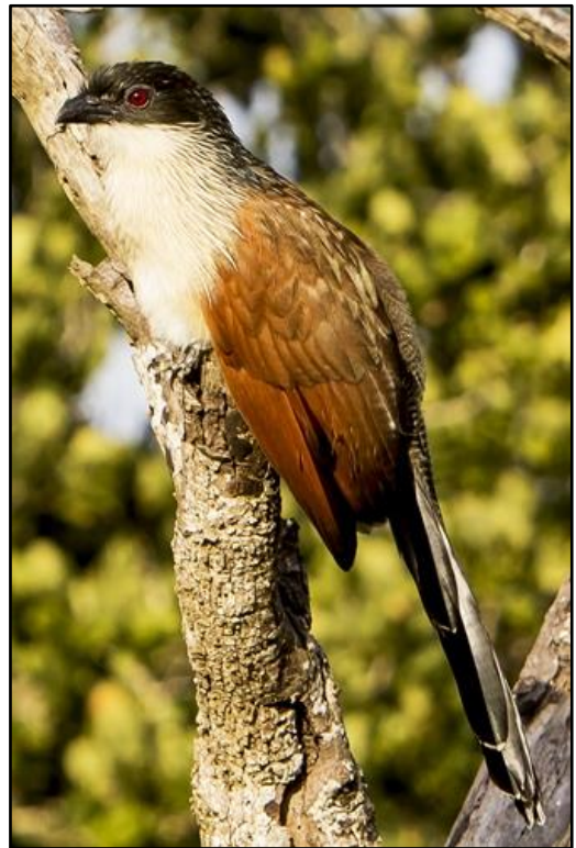
Burchell's Coucal by Greg de Klerk