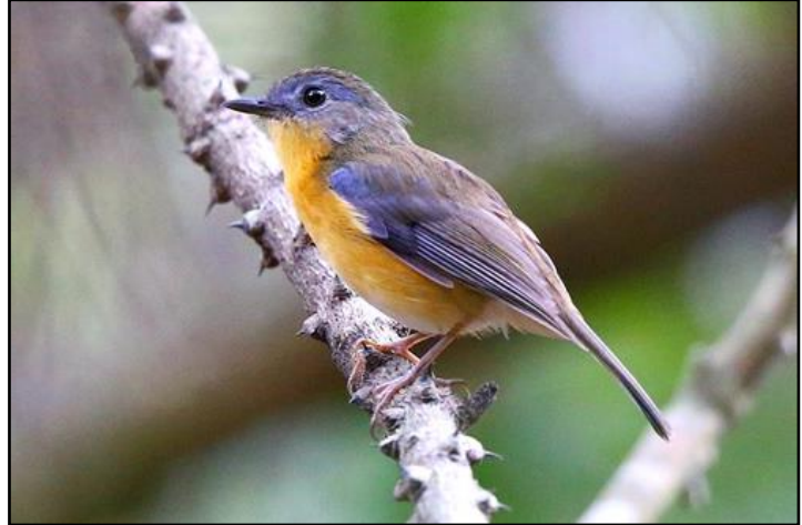
East Coast Akalat

A total of 7 days were spent here, with a total of 188 bird and 20 mammalian species recorded. Livingstone's Flycatcher, East Coast Akalat, Pallid Honeyguide and Black-and-white Flycatcher were just a few of the mouth-watering specials that we managed to record. This great cast was accompanied by some good numbers of plains game too, such as the rare Lichtenstein's subspecies of Hartebeest, Oribi and graceful Sable Antelope.