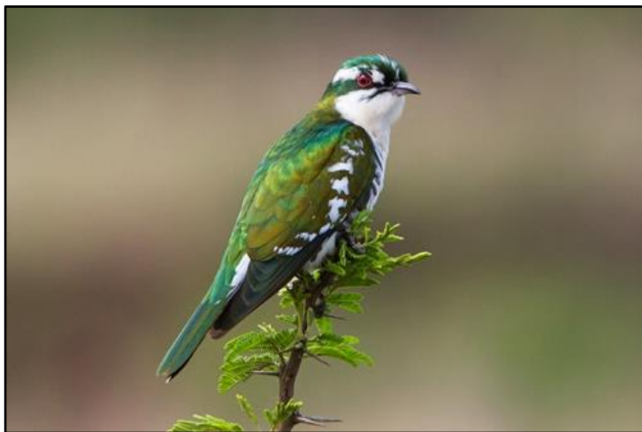
Diederik Cuckoo by Adam Riley

finding a few Square-tailed Nightjars as dusk fell! We arrived back in camp as the menacing storm broke overhead and settled in for the night.