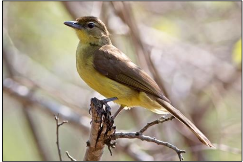
Yellow-bellied Greenbul

Having missed the opportunity to explore the wetlands the evening before, we headed out with the intention of adding a few wetland species to our lists. We drove out, collecting African Palm Swift, Black-bellied Bustard, Thick-billed Weaver, Croaking Cisticola, Crested Francolin of the kirkii subspecies, Grey Heron and just as a storm broke nearby, a pair of Saddle-billed Storks. Sadly, the storm scuppered our chances of wetland birding and so we decided to bird a small forest patch. Here we added Silvery-cheeked and Trumpeter Hornbills, Livingstone's Flycatcher, White-eared Barbet, Crowned Eagle, Narina Trogon, Cardinal Woodpecker, Purple-banded Sunbird, Emerald-spotted Wood Dove, European Nightjar, Scaly-throated Honeyguide and Grey-headed Bushshrike. Determined to squeeze in a few more species, in defiance of the impending rain, we embarked on a short loop-walk near camp, adding