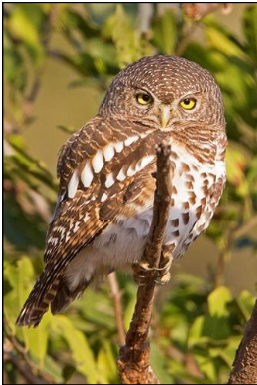
African Barred Owlet by Adam Riley

Bearded Scrub Robin, Grey Waxbill, Red-throated Twinspot, Red-billed Firefinch, Bronze Mannikin, Black and Red-chested Cuckoos, Green Wood Hoopoe, Common Scimitarbill, Pin-tailed Whydah, Little and Swallow-tailed Bee-eaters, Brown-hooded Kingfisher, a feeding flock of Brown-necked Parrots, a displaying pair of Black-and-white Flycatchers, Brown-crowned Tchagra, Black Cuckooshrike, African Paradise Flycatcher, Black-bellied Starling, Spectacled Weaver and Grey-backed Camaroptera before returning to camp for a night's rest.