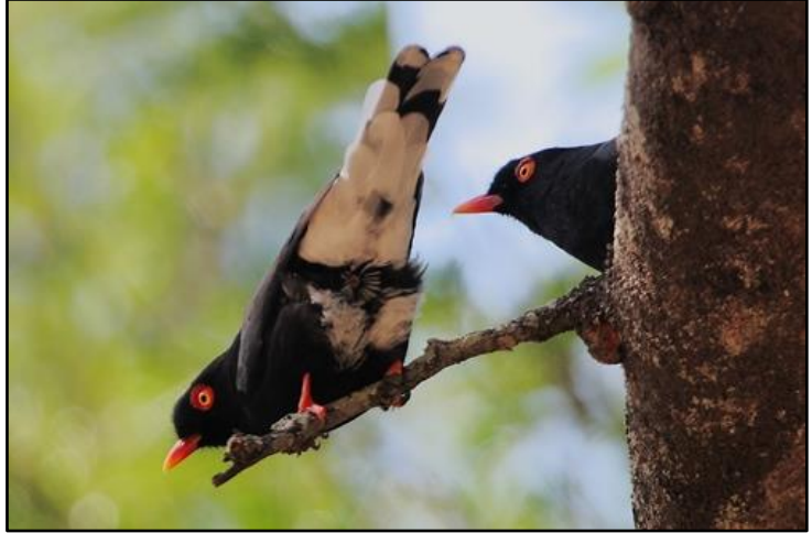
Retz's Helmetshrike

We woke to a torrential storm still at full force that morning, which put a pause to any plans we had in mind for the early morning. When the opportunity arose and the rain had slackened, we ventured out for a walk, collecting all the usual suspects including Grey-tit Flycatcher, Yellow-rumped Tinkerbird, African Emerald Cuckoo, Sombre Greenbul, White-browed Scrub Robin, White-bellied and Amethyst Sunbirds and a Pallid Honeyguide. After lunch, we took a chance as the weather cleared marginally and found some pristine miombo teeming with bird life. En route we had many Tambourine Doves and a single Mourning Collared Dove. We managed to locate Retz's and the surprisingly common Chestnut-fronted Helmetshrikes, Stierling's Wren-Warbler, a roosting European Nightjar high-up in a tree, Red-faced Crombec, Short-winged Cisticola, Green-capped Eremomela collecting Lichen for nesting material, Kurrichane Thrush, Collared Palm Thrush, a Striped Kingfisher, a very responsive African Barred Owlet, and African Golden and Black-headed Orioles, which came and sat a few metres from us before we returned to camp for dinner and another good night's rest.