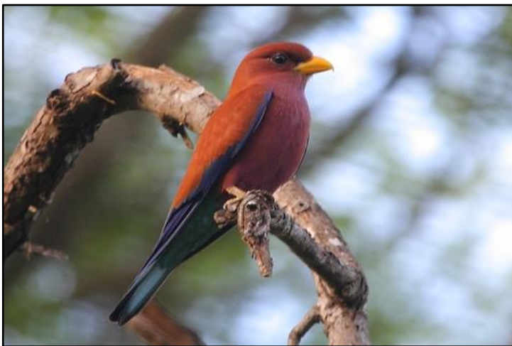
Broad-billed Roller

As we neared the wilderness on our small chartered flight from Beira, we could almost immediately see how vast this place is. We were greeted by the friendly smiles of the lodge staff on the runway, chanting to the beat of a traditional drum. After familiarising ourselves with the lodge and our accommodation, we decided to enjoy a drink at the fireplace before dinner. The nocturnal creatures around camp proved interesting, and we managed to get a view of the resident pair of African Wood Owl; while also connecting with Greater Thick-tailed and Grant's Galagos!