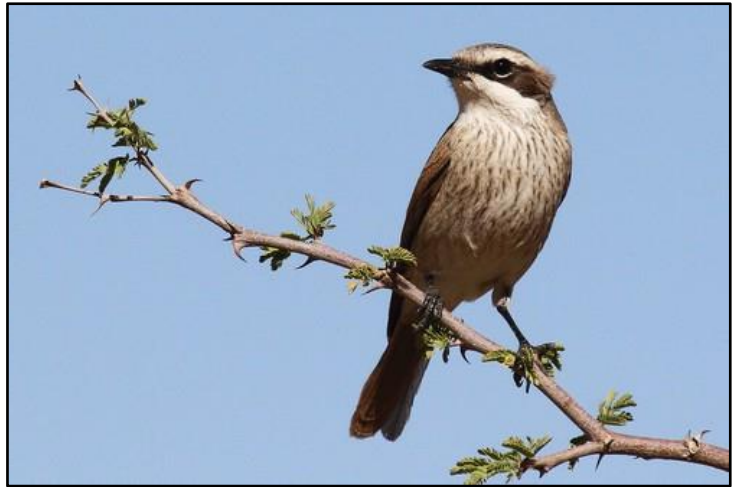
Herero Chat

A special date with one of Namibia's hardest near-endemic birds, the Herero Chat, meant a very early morning departure from Walvis Bay. We drove in darkness towards the impressive Spitzkoppe and arrived just in time to watch the sun rise over the most impressive geological formations! After a quick field breakfast, we began our search. The wind was gusting, but it didn't take long before we were eyeballing a pair of these normally difficult birds. Having secured our main quarry early on, we explored the small reserve and produced some confiding Pale-winged Starlings, Monteiro's Hornbill, and Cape Bunting. Happy with our success, we then continued