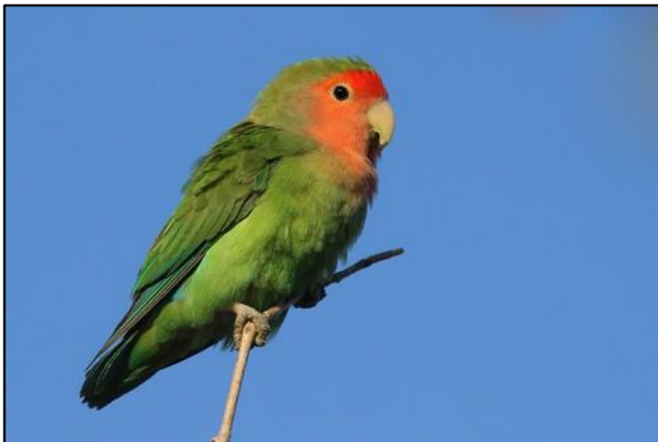
Rosy-faced Lovebird

towards the town of Usakos. En route we spotted a dark morph Booted Eagle, obviously displaying its pale 'landing lights', as well as a few Karoo Chats. From Usakos, we took a detour towards our accommodations in the Erongo Mountains. This worked in our favour, delivering the sometimes scarce Rüppell's Parrot, a pair of the difficult Damara Red-billed Hornbill, our first Pearl-spotted Owlets for the trip, and some intricately patterned Double-banded Sandgrouse. We arrived at our luxury tented camp with time to spare, so we took a short walk through some granite boulders, where we quickly found a pair of noisy Hartlaub's Spurfowl. During dinner, we spotted Freckled Nightjar hawking insects around the spotlit waterhole, though Western Barn Owl was only heard in the distance.