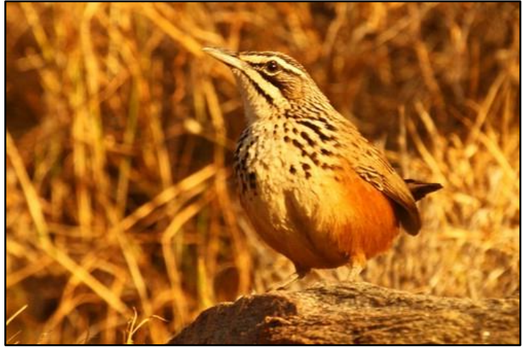
Rockrunner

in breeding plumage – as well as a plethora of waterbirds, including Little Grebe, Common Moorhen, all three Teals (Hottentot, Cape and Red-billed), White-breasted and Reed Cormorants, Black-crowned Night Heron, and a surprise Southern Pochard. A quick post-lunch trip out to the airport produced some fleeting Rosy-faced Lovebirds – a species we all so desired to see better . From there we ventured to Avis Dam, a municipal-run greenspace on the edge of the city. Our principal target here was the Rockrunner – the first of Namibia’s near-endemics – which we soon found scurrying across the rocky hillslopes. Zitting Cisticola flitted through the nearby brush, Mountain Wheatears called loudly from ridgetops, and Crimson-breasted Shrike left us all drooling. En route to the hotel for the evening, we were treated to unreal views of a male Red-crested Korhaan as it crossed the road ahead of our vehicle.