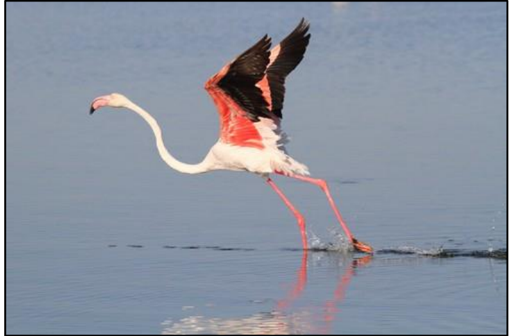
Greater Flamingo by Daniel Keith Danckwerts

views out over the Namib Desert were just spectacular. A short foray produced a striking pair Bokmakierie, several nondescript Layard's Warblers, ubiquitous Mountain Wheatears, a flyover Long-billed Pipit, Peregrine Falcon, and two soaring Verreaux's Eagles. Thereafter, we continued through the Namib-Naukluft National Park, witnessing the desolate desert-proper in all its forms. The lunar landscape seemed almost devoid of life, though we stopped to admire some impressive Quiver Trees in a small ravine. On gravel plains closer to Walvis Bay, our destination for the next two nights, we spotted an incredible 28 Rüppell's Korhaans – surely this must be some kind of record! Gray's Lark, another real specialist of these most desolate of desert plains, was also easily found as it sang its almost inaudible tinkling song, though a pair of Tractrac Chat offered only fleeting views.