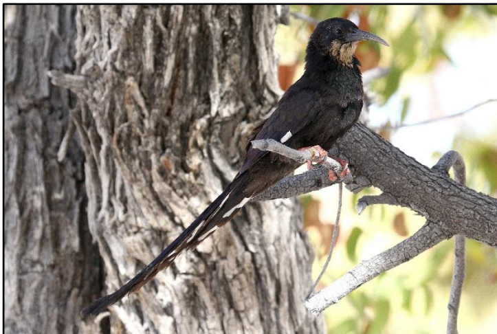
Violet Wood Hoopoe by Daniel Keith Danckwerts

Our time in western Etosha delivered spectacular mammal viewing opportunities – by far the best of the trip – as well as some incredible birds. We quickly found the adorable Pygmy Falcon, the pale desert races of both Double-banded Courser and Eastern Clapper Lark, several nondescript Desert Cisticolas, a pair of fantastic Greater Kestrels, and some exquisite Pink-billed Larks in the Okondeka area, as well as impressive numbers of Plain's Zebra, Oryx, Giraffe, and Springbok. The real surprise was seeing a roosting pair of Spotted Eagle-Owls, which included both the uncommon rufous and more-common grey morphs of this species. The Gemsbokvlakte additionally delivered a striking Capped Wheatear, a pair of Rufous-eared Warbler of a different (much paler) race to what we had seen previously, confiding Lilac-breasted Roller, Northern Black Korhaan and some incredibly tame