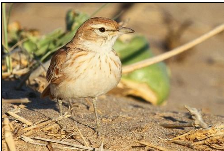
Dune Lark

Our time in Walvis Bay was a real highlight for all, as our accommodation looked across the vast lagoon that was blanketed in flamingo-pink. Tens of thousands of both Lesser and Greater Flamingos reside in these productive waters, and we had ample opportunity to study both species, often side-by-side. The lagoon also produced several species of tern (Common, Sandwich, Great Crested, and Caspian), Hartlaub's and Kelp Gulls, Grey and White-fronted Plovers, Pied Avocet, Black-winged Stilt, Black-necked Grebe, and Curlew Sandpiper. An early morning trip to Rooibank – the northernmost tip of the vast red-dune landscape that covers most of southern Namibia – produced as many as 5 Dune Larks. This species, Namibia's only true-endemic bird, is always a pleasure to watch as it scurries through the foredune vegetation. Heading north, we also visited the small Germanesque town of Swakopmund. A quick stop at the Langstrand guano platform produced Great White Pelican and African Oystercatcher.