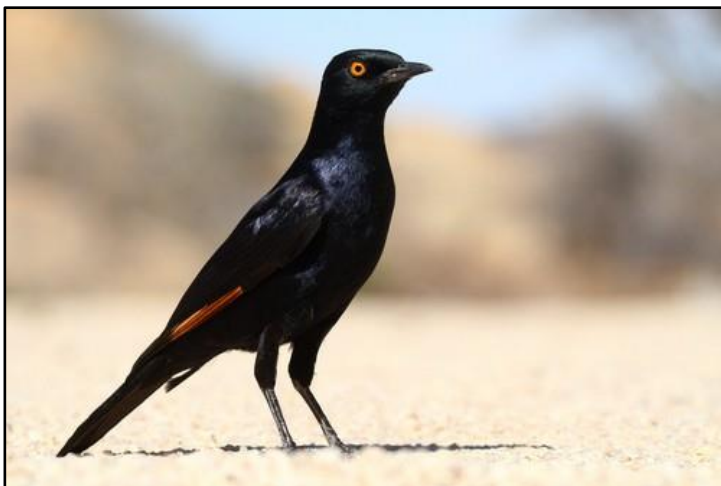
Pale-winged Starling

Our epic overland adventure through Namibia, Botswana and Zambia began on the outskirts of the bustling city of Windhoek – Namibia's largest city and the country's capital. Rewarded with an early arrival time, we took the opportunity to explore the dense thornveld around our hotel. Here we were treated with glorious sightings of small flocks of the delightful Black-faced Waxbill, an extremely confiding Barred Wren-Warbler, noisy groups of Pale-winged Starling, skulking Chestnut-vented Warblers, and some extremely confiding Short-toed Rockthrushes. A distant raptor soaring over the valley below was identified as a Black-chested Snake Eagle – the first of many . We then ventured further afield, stopping first at the Gammas Waste Water Treatment Plant. Here we witnessed impressive numbers (tens of thousands!) of Wattled Starling – some