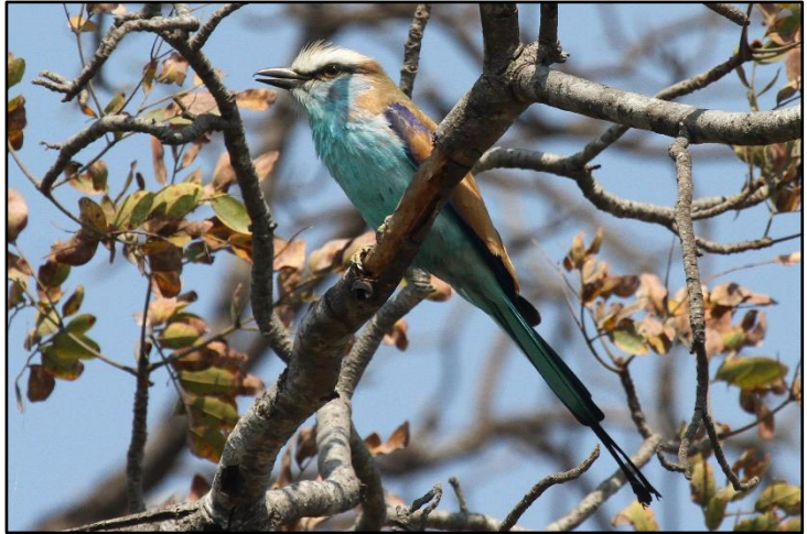
Racket-tailed Roller

A second Racket-tailed Roller territory delivered a cracking sighting of at least three birds, perched at almost arm's reach above us and performing their towering areal displays, as well as small numbers of African Grey Hornbill. Just awesome! From there, we explored some mature Mopane woodland in search of the tricky Arnott's Chat. Despite our best efforts, we had to settle for some White-crested Helmetshrikes and a quick male Red-headed Weaver. Returning to the lodge, we took a short afternoon break. A few of us then embarked on a long walk towards the Southern Carmine Bee-eater colony, where we eventually found small numbers of Brown Firefinch. A lone Grey Tit-Flycatcher also alerted us to its presence, giving its soft fluty call, and a Slaty Egret flew over a lucky few.