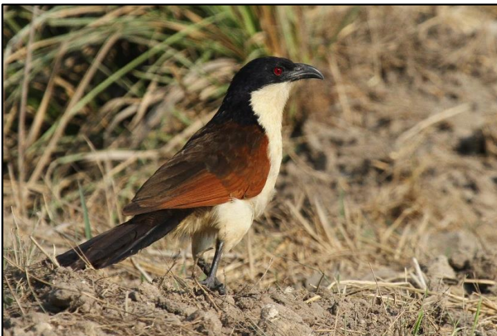
Coppery-tailed Coucal