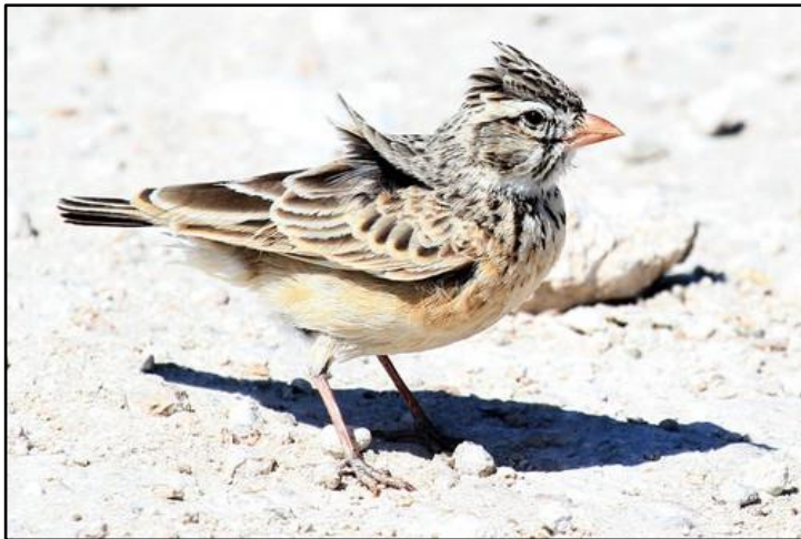
Pink-billed Lark

performing impressive leg stretches as they drank.