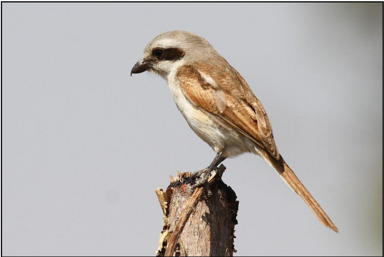
Souza's Shrike