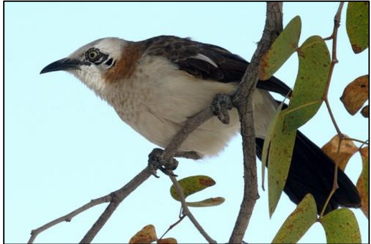
Bare-cheeked Babbler by Daniel Keith Danckwerts

Wood Hoopoe, and some wonderful Damara Red-billed Hornbills. As we neared Etosha, we spotted an impressive number of White-backed and Lapped-faced Vultures, along with the grotesque-looking Marabou Stork. We all concluded that there must have been a predator kill site somewhere nearby! Our accommodations for the evening, set just on the outskirts of Etosha National Park, also seemed alive with bird activity! A huge mixed feeding flock on the entrance road contained the beautiful Golden-breasted Bunting, a small flock of humorous White-crested Helmetshrikes, a pair of Carp's Tit, a skulking Brown-crowned Tchagra, Violet-eared Waxbill, and a wonderful party of Bare-cheeked Babbler! What luck to find this difficult species with such ease! We settled into a delicious buffet-type dinner, enjoying the antics of a family group of Southern Lesser Galago as they bounced through the canopy.