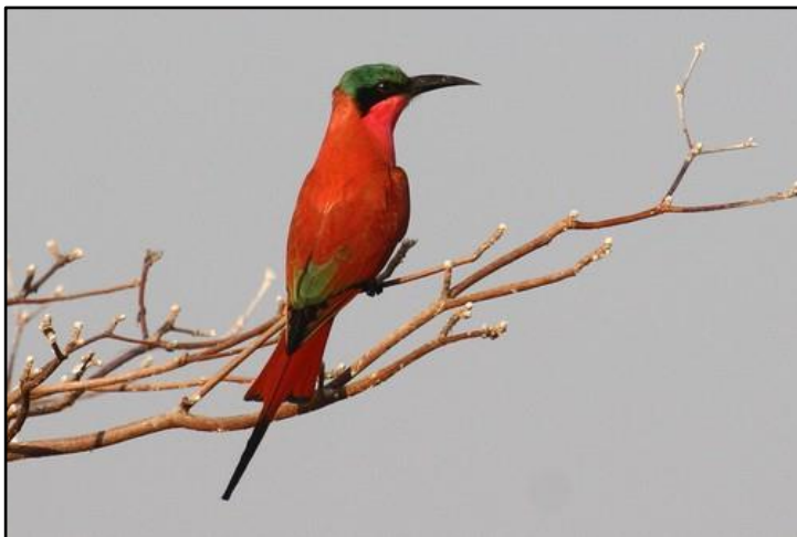
Southern Carmine Bee-eater

We took a short drive between our lodge and the entrance to Mahango early the following morning. Here we observed incredible numbers of Burchell's and Meves's Starlings – though the scarce Sharp-tailed Starling was nowhere to be found, as well as a single male Red-headed Weaver at its nest, some confiding Meyer's Parrots, African Green Pigeons, the first Yellow-bellied Greenbul, and a Southern Black Flycatcher. We stopped at the marsh near our hotel, where we found an uncharacteristically confiding African Rail, a single Luapula Cisticola, and a pair of Greater Painted-snipe. From there, we began the long drive towards Katima Mulilo, stopping only at a bridge over the Kwando River where we saw our only Saddle-billed Stork of the trip. Several female Waterbuck were also drinking nearby, together with some Impala, Southern Reedbuck, and Red Lechwe. Nearer to Katima Mulilo, we put in a small effort for Racket-tailed Roller. A pair responded incredibly briefly, then seemed to totally vanish – satisfactory sightings