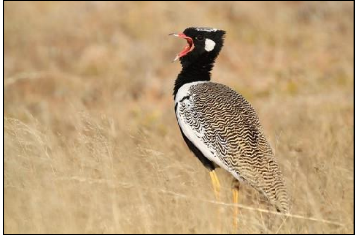
Northern Black Korhaan

Southern White-crowned Shrike, Yellow-breasted Apalis, and a handful more Carp's Tit. We all commented on how easy this latter species had become, after struggling as much as we did in the Erongo area. The afternoon drive produced several fantastic herds of Oryx and Plain's Zebra, a few hundred Common Wildebeest, a single Honey Badger, and a surprise Western Barred Cobra in the road. A real highlight for all was also our experience with a Northern Black Korhaan as it performed its startle display; the bird crouched down, fanning the wings to reveal the white inner webs to its wing feathers, and proceeded to bounce around in and out of view. A night walk through the camp offered up a pair of African Scops Owl, three more Honey Badgers scavenging at dustbins, Black Rhinoceros at the waterhole, and would you believe a Wild Cat!