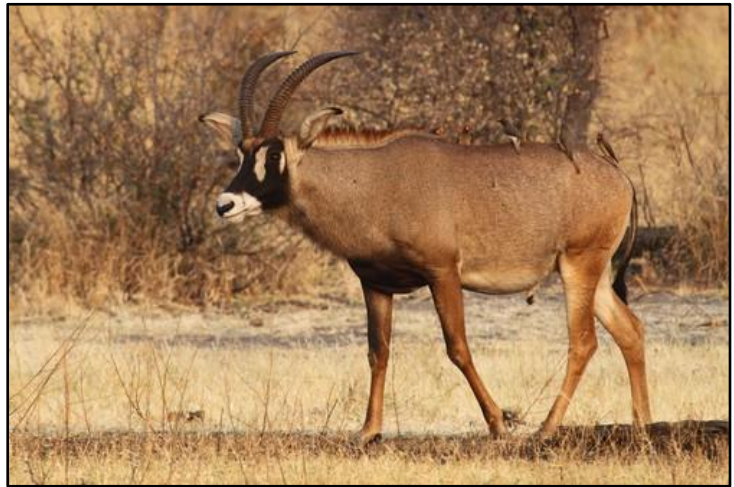
Roan Antelope

huge males, Southern Reedbuck, a pair of Bushbuck, and several troops of both Vervets and Chacma Baboon. The trip out to the waterhole also delivered a pair of Red-crested Korhaan, Yellow-throated Petronia, Golden-breasted Bunting, Cape Starling, some brief Meyer's Parrots, and a party of roosting White-backed, Lapped-faced, and White-headed Vultures. We also managed several Roan Antelope, most of which were covered in Red-billed Oxpeckers. One particular animal had as many as 20 separate birds on its hide! The drive out to our accommodations then took us across a small wetland, where we flushed a single African Snipe. A night drive to this same area, in search of Swamp Nightjar, delivered several Square-tailed Nightjars and a wonderful Selous' Mongoose.