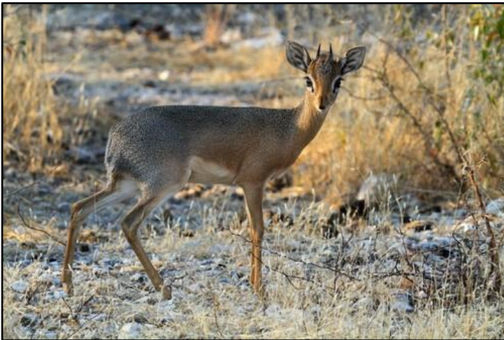
Kirk's Dik-dik

From Rundu, we drove towards the village of Kayaru. This is the only known area where Souza's Shrike – a shy and unobtrusive central African woodland specialist – occurs in southern Africa. However, sightings of these birds are few and far between, and there appears to be distinct seasonality in this species' occurrence in Namibia. We arrived in an area where the habitat looked suitable, and immediately set to work. It couldn't have taken longer than about 15 minutes before a pair of male sunbirds were sighted in some flowering mistletoes in the canopy of the degraded woodland. Both seemed a little small, and the breast bands were much too bright for the common Marico Sunbird. They were Shelley's Sunbirds – another rare and unpredictable species with an unclear distribution! Who would believe that