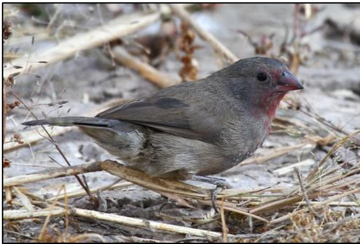
Brown Firefinch

We left the Katima Mulilo area early, crossing into Botswana at Ngoma. The Ngoma bridge was a superb vantage point from which to scan the surrounding floodplain. Here we found African Jacana, Yellow-billed Stork, Great and Intermediate Egrets, Squacco Heron, and small numbers of Whiskered Tern. In the distance, we also saw Greater Kudu, Plain's Zebra, Waterbuck, and Impala. From there we crossed through Chobe National Park, seeing a trio of the rare Sable Antelope and a herd of African Elephants crossing the road. Upon reaching