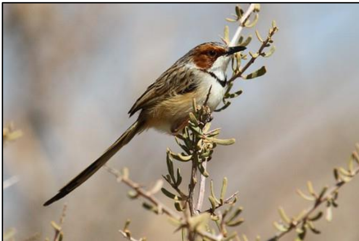
Rufous-eared Warbler

The following day, we set off to the nearby Daan Viljoen Nature Reserve. The entrance road produced the first mammals of the trip: Hartebeest, Oryx, Impala, Giraffe, and Warthog. Not forgetting the birds, we quickly added the diminutive Cape Penduline Tit, noisy parties of Ashy Tit, the electric blue Common Scimitarbill, and another Rockrunner. Monteiro’s Hornbill – another key target – was pleasantly abundant, but the scarce Orange River Francolin eluded us in the heat of the day. Our lunch break yielded the gorgeous Violet-eared Waxbill, the first of many Lilac-breasted Roller, and some quick Bradfield’s Swifts. From there, we set off on the long drive towards Namibgreens, where our luxury accommodations for the evening were built into the impressive rocky landscape. En route we saw our first Mountain Zebra and Blesbok, a pair of endearing and delicate Rufous-eared Warblers, breathtaking Northern Black