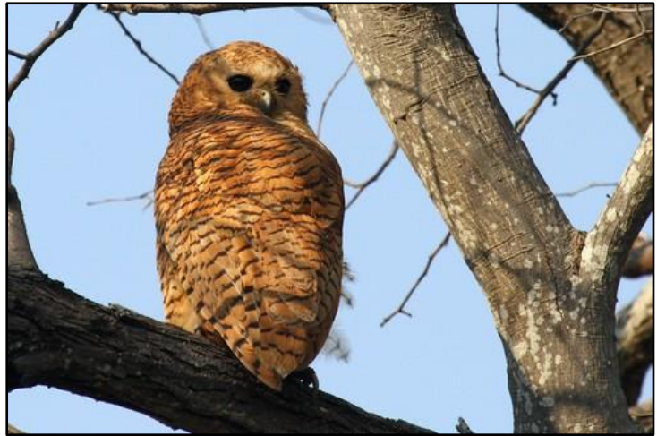
Pel's Fishing Owl by Daniel Keith Danckwerts

unbelievable five Sitatunga were a welcomed consolation prize, as were a pair of Little Bittern in breeding plumage, a small flock of the stunning African Pygmy Geese, and the diminutive Lesser Jacana. A quick stop in some papyrus, on the way back to the lodge, produced an incredibly showy pair of Greater Swamp Warblers – a huge and normally secretive resident of these swamps. The post-dinner night walk then delivered a calling pair of African Wood Owls and a most-memorable sighting of a lone Aardvark. We couldn't believe our luck when we stumbled upon the latter (one of Africa's most mythical mammals!) as it trundled its way through camp, had a quick nap beside a tree, and eventually disappeared into some thicket!