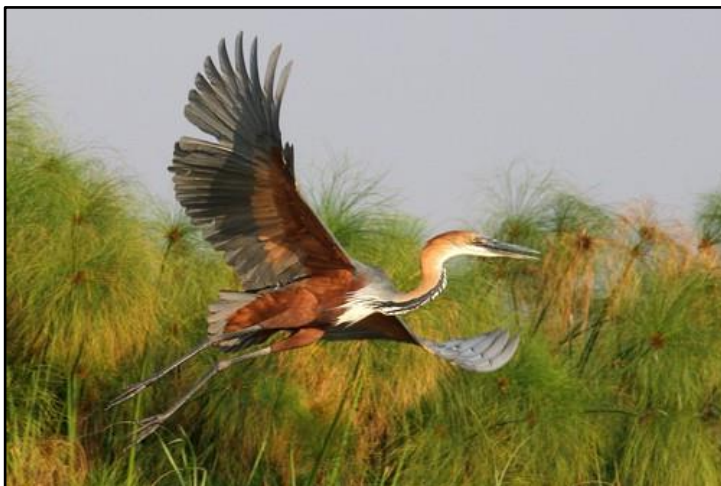
Goliath Heron by Daniel Keith Danckwerts

Early the following morning, we left on our final boat trip through the Okavango Delta. We decided to explore the lower floodplain area again, where the habitat seemed best, in search of the difficult Slaty Egret. The 30-minute boat trip to the site produced several more Sitatunga, including one particularly confiding bull and a separate doe with her calf, as well as Coppery-tailed Coucal, African Skimmer, and Chirping Cisticola. The calls of Greater Swamp Warbler echoed all around us, though we were satisfied after our magical views the previous day. The floodplain itself delivered several Reed Cormorants, Yellow-billed Stork, and some especially confiding Lesser Jacanas. And, just as we were about to give up hope, a pair of incredible Slaty Egret! What an incredible end to our visit to one of Africa's most famous wildlife destinations!