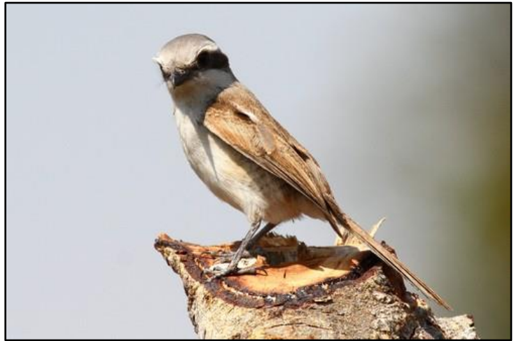
Souza's Shrike by Daniel Keith Danckwerts

Lechwe, Southern Reedbuck, the rare Roan Antelope, and a scattering of African Buffalos. The surrounding thornveld contained Dark Chanting Goshawk, noisy groups of Hartlaub's Babbler, metallic blue Meves's and Burchell's Starlings, small flocks of the sweet Blue Waxbill, Southern Black Tit, a striking Crested Barbet, and some Yellow-billed Oxpeckers that were presumed to be breeding in a dead snag. We then crossed into Botswana, where we were met by our fabulous and incredibly knowledgeable boat driver and local guide, Thomas. Thomas transferred us to our luxury tented camp on the banks of an isolated peninsula in the Okavango Delta. En route we spotted our first African Skimmers, several regal African Fish Eagles and a plethora of herons and egrets. We then settled in for an early night, eager for what the following day would bring.