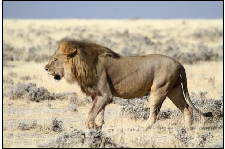
Lion

Kurrichane Thrush, and Holub's Golden Weaver; while some nearby marshes contained the huge Coppery-tailed Coucal, Red-billed Teal, a close Rufous-bellied Heron, and African Jacana. We also had a short opportunity to wander through some woodlands on the western edge of town. Though it was incredibly quiet, we nit-picked a handful of Pale Flycatchers, some stunning Swallow-tailed Bee-eaters, Yellow-fronted Tinkerbird, a female Red-headed Weaver, a fleeting group of Green-capped Eremomelas, and a cracking party of the scarce Rufous-bellied Tit. The latter has become inexplicitly difficult in recent years, as their woodland habitats have been decimated by slash-and-burn farmers on the Caprivi Strip. The day ended with a short post-dinner night drive, on which we had an incredible opportunity to study the intricacies in the plumage of Square-tailed Nightjars.