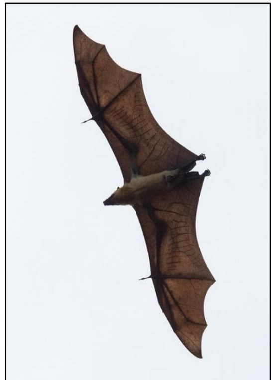
Great Flying Fox by Gareth Robbins

We stumbled back out of the forest with minimal mosquito bites and straight into the blazing heat. Joseph then took us