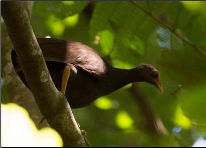
Melanesian Megapode