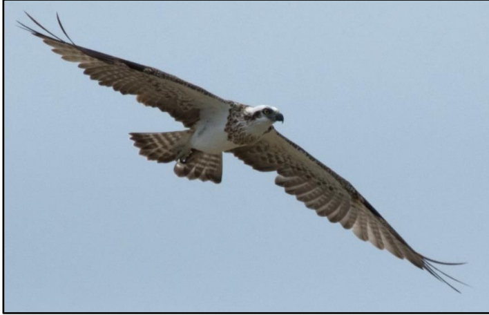
Eastern Osprey