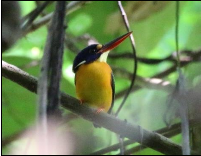
New Britain Dwarf Kingfisher

to a nesting area for Melanesian Megapodes for us to try our luck. At long last, we saw one bird nervously sitting up in a tree above us, where we all had extraordinary views of it before it finally flew off. We then returned back to the lodge, spotting Buff-bellied Mannikins feeding in some tall grass with fresh seed heads. After a filling lunch, some of the group went for a walk around the edge of the property and found Ruddy Turnstone, Greater and Lesser Sand Plovers and Pacific Reef Herons. In the