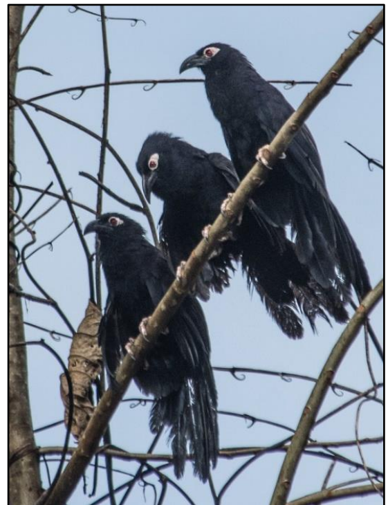
Violaceous Coucals by Gareth Robbins

After a substantial lunch, we drove up to the Ella Forest and after some expert driving from Joseph, we reached our destination. We came to a sudden halt when Joseph spotted a few Buff-faced Pygmy Parrots in a tree beside the road. We hopped out immediately and we all got some great looks at these tiny Parrots. We continued with the road by foot and came across a large fruiting tree attracting large numbers of frugivorous birds, such as Knob-billed Fruit Doves, Yellowish Imperial Pigeons, plenty of Metallic Starlings and Eclectus Parrots. A little further up the trail, we came across a flowering tree attracting Ashy Myzomelas and Black Sunbirds. Finally, after some perseverance, we successfully managed to locate an adult and sub-adult Black-bellied Myzomela. We persisted along the path to a lookout point and then we made our way back down the hill to the tour vehicle