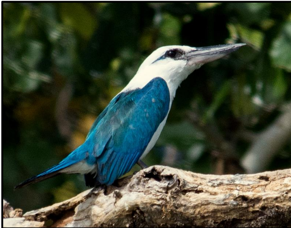
Beach Kingfisher by Gareth Robbins