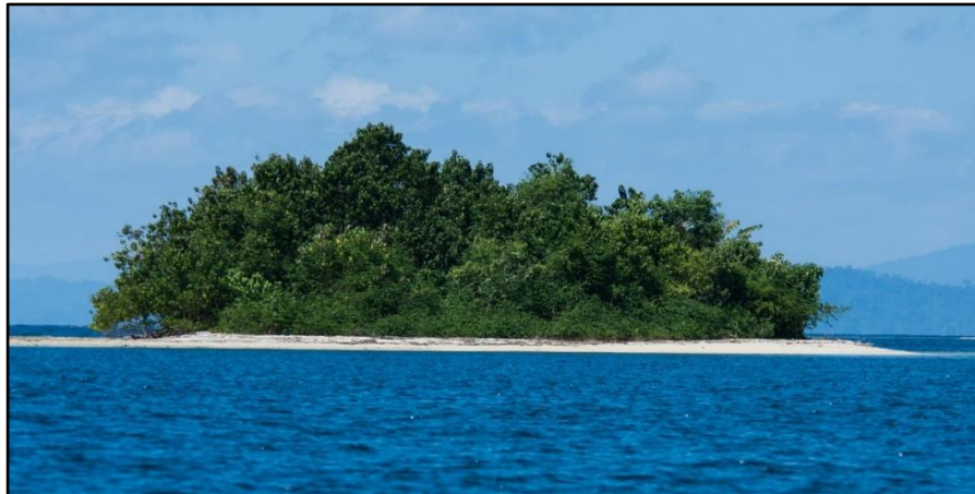
Small Island by Gareth Robbins

We enjoyed a relaxed start to the morning, with our last breakfast at our beautiful lodge in Kimbe Bay. We then drove to Hoskins Airport to take the last flight of the trip back to Port Moresby. Once we arrived at Port Moresby/Jacksons Airport, we bid farewell to each other while some went out for an afternoon of birding with Leonard in the Brown River District.