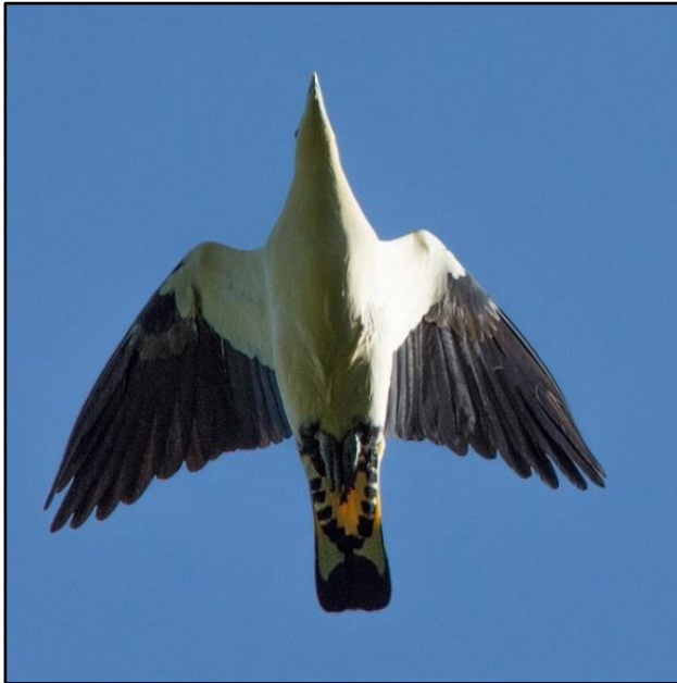
Yellowish Imperial Pigeon

accompanied by a local chap that had clearly had too much Betel Nut for the weekend.