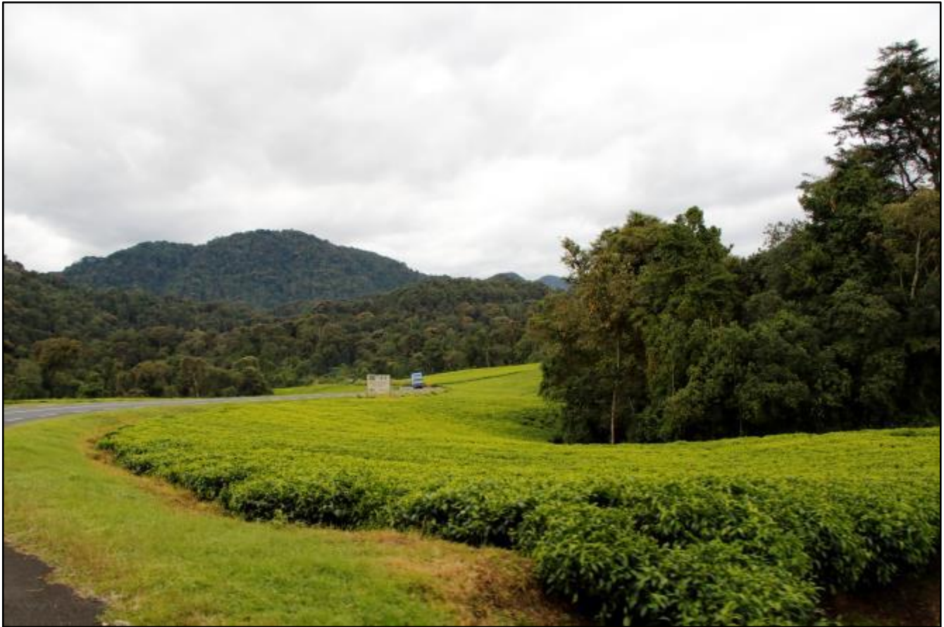
Nyungwe Forest National Park with adjacent Tea Estate

Some of the regional specials that would be high up on any birder's wish list that we did manage to find included Ruwenzori Batis, Grauer's Warbler, Dusky and Stripe-breasted Tits, Regal, Ruwenzori Double-collared and Blue-headed Sunbirds, Ruwenzori and Mountain Masked Apalises, Strange Weaver, Doherty's Bushshrike, Handsome Francolin and lastly the absolutely stunning Ruwenzori Turaco that was seen several times and exceptionally well on a number of occasions. Raptors were scarce but included further great looks at the numerous Augur Buzzards in the area as well as finding the handsome Long-crested Eagle and sought-after Mountain Buzzard.