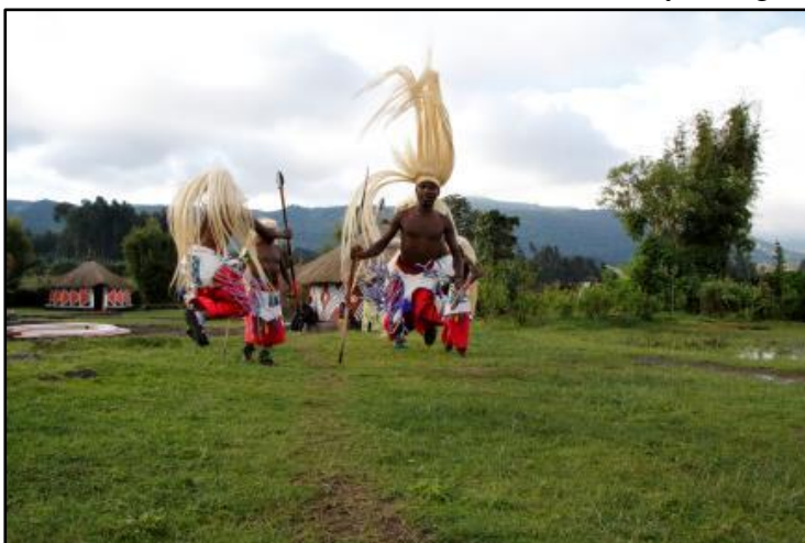
Gorilla Guardians Village

The journey to the lodge initially took us through the outskirts of Kigali before winding through the hilly and agricultural areas further north. One of the standout features of Kigali, and in general most of the areas that we visited throughout this extension, was the overall cleanliness in terms of litter and other rubbish, as well as the overwhelming friendliness of Rwanda's people. There were some birds along the way, with Hooded Vulture, African Sacred Ibis, African Harrier-Hawk, Little Swift, Common Kestrel, Red-eyed Dove and Southern Fiscal all seen well. Unfortunately, the weather would take a turn for the worse and we arrived at the lodge in the pouring rain. With the rain abating later in the afternoon, we made a short visit to a nearby village known as the Gorilla Guardians, where a local