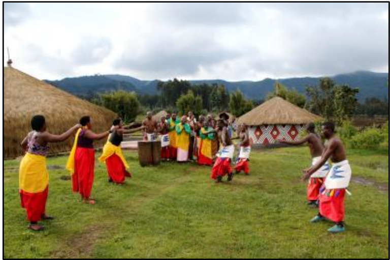
Gorilla Guardians Village

The first stop for the day was the Kigali Genocide Memorial. This memorial is known for being the final resting place for over 250 000 victims during the genocide of 1994 that took place against the Tutsis. Today, this memorial plays an integral part in the country's peace-building and education efforts around the genocide, and the memorial honours the memory of the more than 1 million Rwandans that were killed during that time. This visit to the memorial was an eye-opening and somewhat difficult experience, but nonetheless fascinating, as the guests made their way around the memorial with audio guides in hand that provided an impressive history and set of facts about the events that took place. As well as placing a significant emphasis on how events such as this genocide need to be prevented from ever happening again. With our time at the memorial coming to an end, we continued towards our lodge for the night, located on the boundary of Volcanoes National Park in the far north of the country.