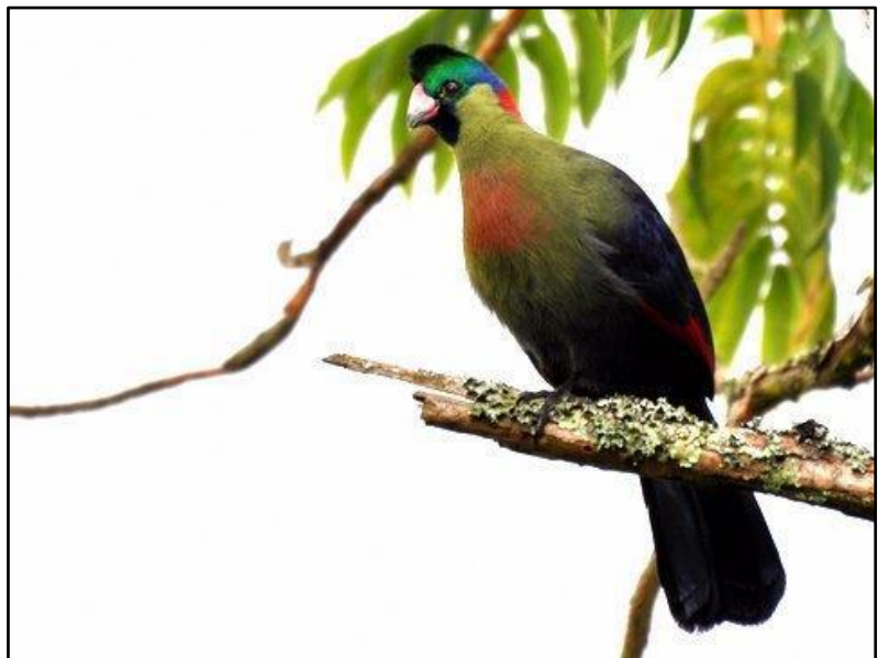
Ruwenzori Turaco

The next two days entailed long walks along the numerous trails of the beautiful Nyungwe Forest National Park; and with the help of our excellent local guide, we were able to find a number of sought-after rift endemics and highly localised species. As with most forest birding, there were many species that we unfortunately only heard and did not manage to get any views of during the two full days of exploring the forest here. The shy and skulking nature of many of these species that we only heard made it all the more reasonable and expected that we did not see them. The flip side of this was that we managed to find an impressive number of specials; and of