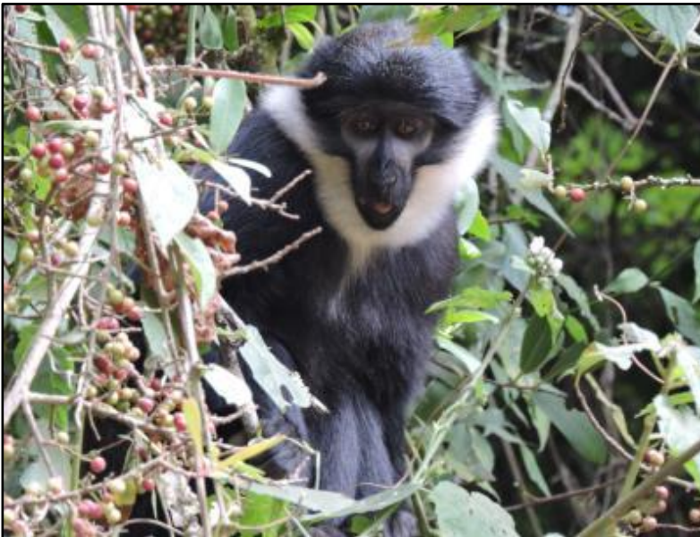
L'Hoest's Monkey by Heinz Ortmann

As already mentioned, the highlights were many, but arguably the standout sighting was that of a Red-chested Owlet late on the final afternoon. Having heard an individual on the first afternoon and not having managed to get any views of it, we were not having high expectations of better luck with this bird. The call seemed distant, but we nevertheless tried our luck by whistling an imitation of its call. After quite some time, we noticed a number of species of birds alarm calling and twitching and flying back and forth in a small area of a large tree not too far away from us. The bird activity suggested the owl was close to where all the raucous was going on, but we unfortunately were unable to locate it. We began to whistle again, and subsequent views of the bird were nothing short of brilliant! Any forest owl in Africa is a good find, and the fantastic views of this stunning owl would certainly live long in the memories of the guests. We had been treated to a superb sighting, and having enjoyed this bird to the full, we left it in peace.