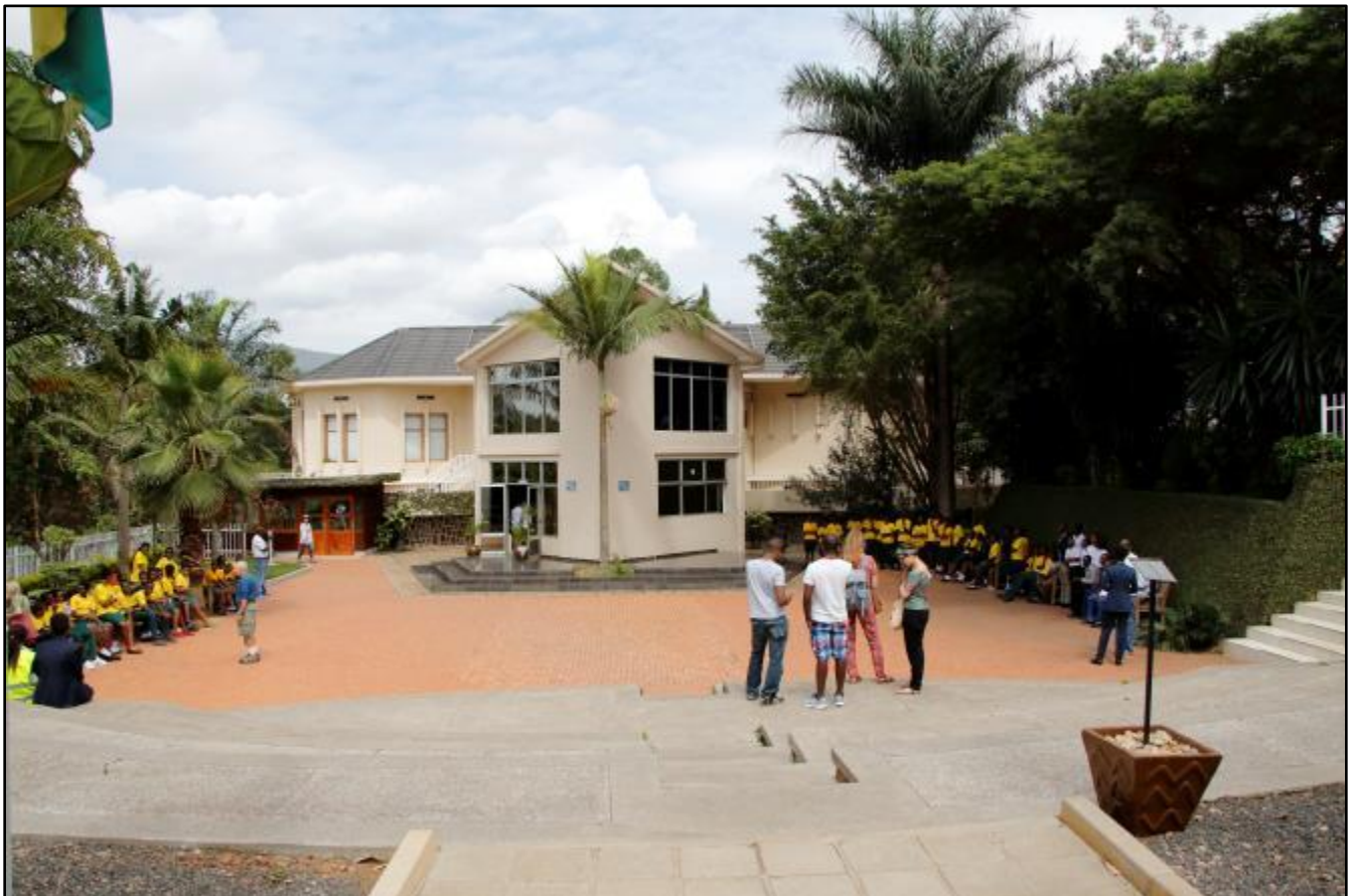
Kigali Genocide Memorial main entrance

The first full day of the tour began with a nice breakfast at our guesthouse before we embarked on the journey for the day. The garden of the guesthouse provided some surprises, with Red-billed Firefinch, Variable Sunbird and Baglafaecht Weaver seen before leaving the guesthouse and entering the busy and bustling city roads. We had a short town tour provided by our drivers as we made the journey through the city to the main Genocide Memorial. As often happens, one does come across some birds on the city outskirts, with Western Cattle Egret, Yellow-billed Kites and a lone Yellow-billed Stork the highlights in between some fascinating information around the genocide, history of the city of Kigali and, of course, the people that call the city home.