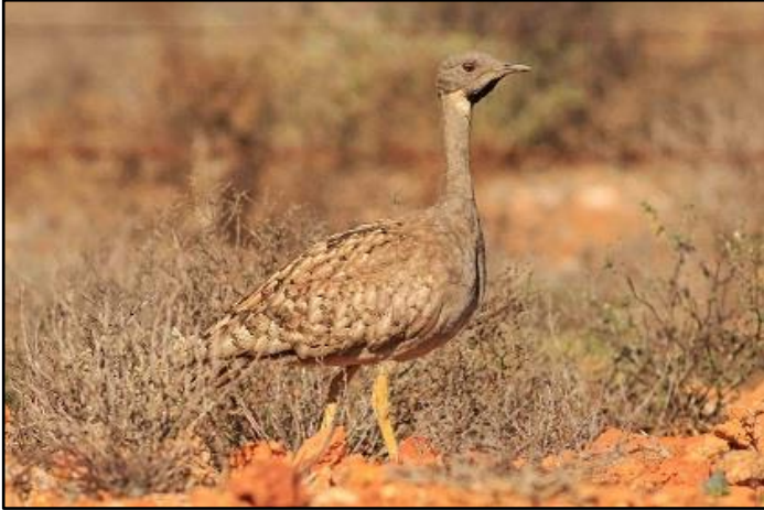
Karoo Korhaan

we were rewarded with prolonged, albeit distant, views of a family group on the rocky slope above us. Other smart birds here included Cape and Sentinel Rock Thrushes, Neddicky and Familiar Chat. The Harold Porter Botanical Gardens was next on the itinerary, which produced additional sightings of Cape Sugarbird and Orange-breasted and Southern Double-collared Sunbirds, as well as the only sighting of Fork-tailed Drongo for the trip.