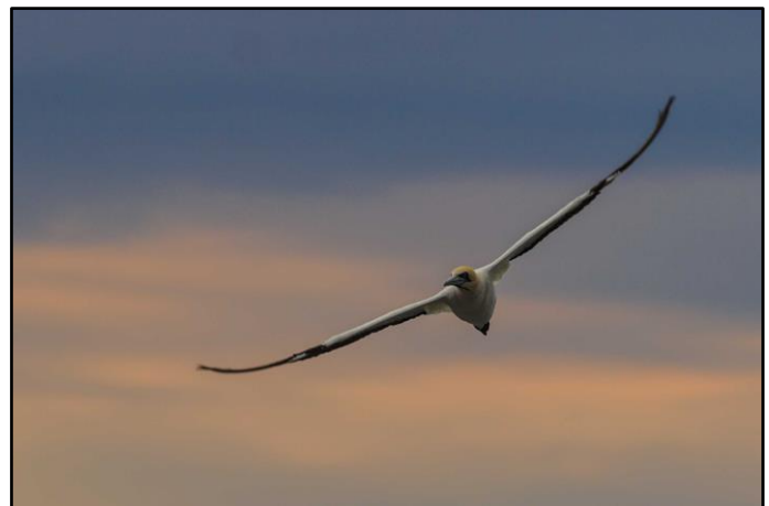
Cape Gannet

A pre-dawn departure saw us in the Tankwa