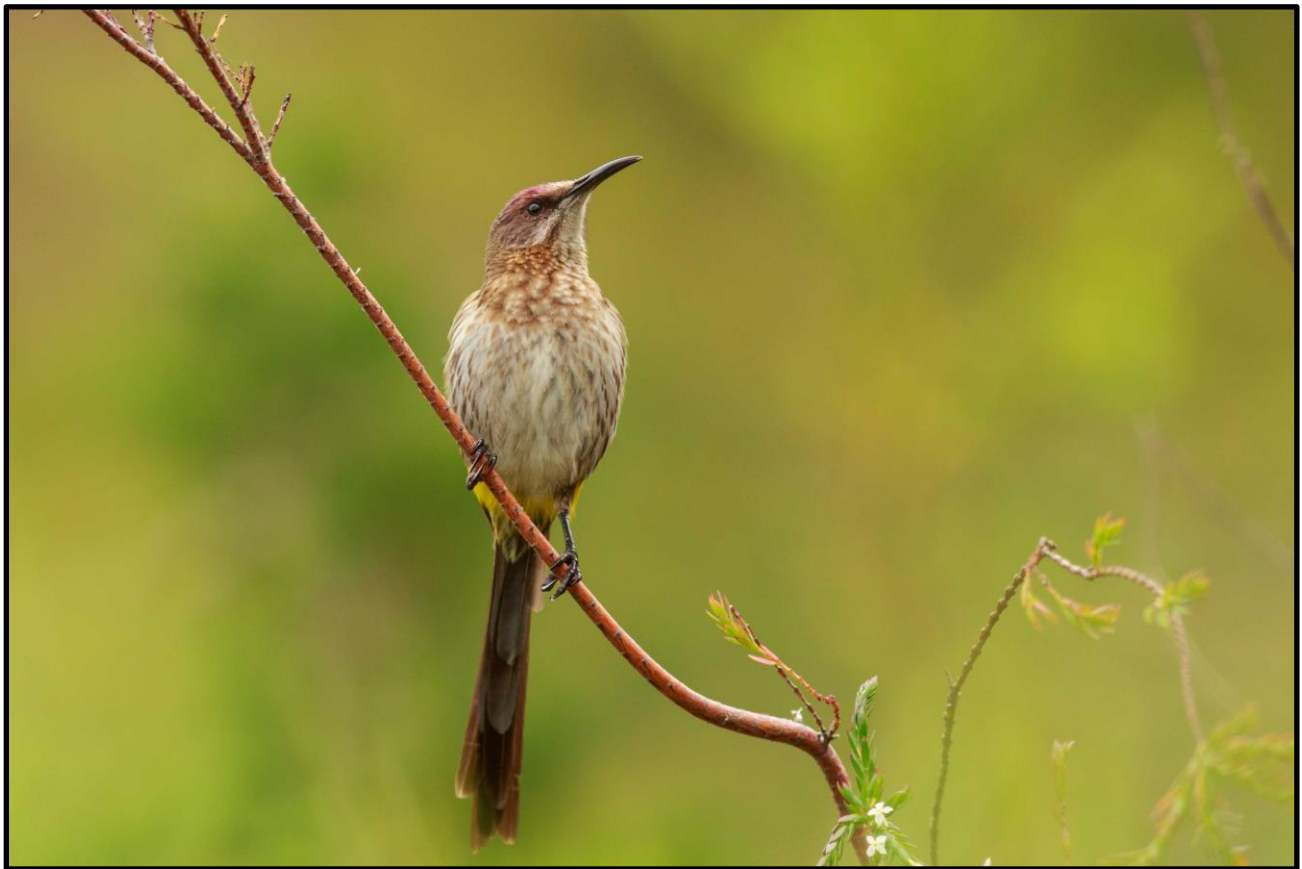
Cape Sugarbird