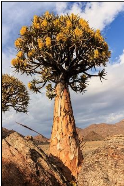
Quiver Tree by Jan Pienaar

From Springbok we headed back south, along the Atlantic Coast, to Lambert's Bay. On the edge of town here is Bird Island, a well-known site for a breeding colony of Cape Gannet. Most youngsters had fledged by the time we visited, but we still had reasonable numbers of both immatures and adults. Crowned, Cape, White-breasted and Bank Cormorants, White-fronted Plover and Common Tern were the notable species we had here.