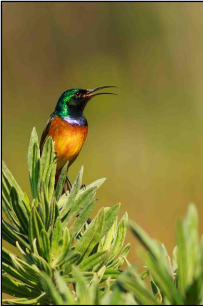
Orange-breasted Sunbird

South Africa is a wonderfully diverse country; and on our exploration of the western part of the country, we certainly came to experience that. The fynbos-clad mountains in the south, the arid Karoo in the interior and the Atlantic coast all formed part of this tour. Although we were plagued at times by some bad weather, including really strong winds, we nevertheless came away with a great selection of birds – as well as some good mammals.