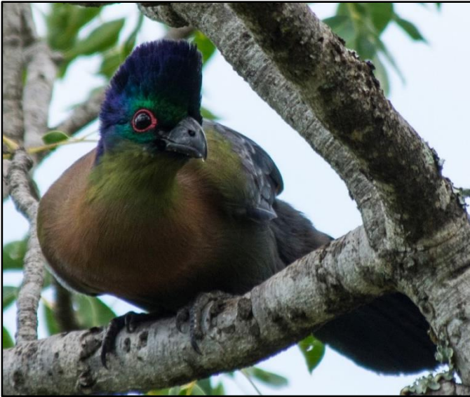
Purple-crested Turaco

a pair of African Hawk-Eagles, as well as Little Egret and Knob-billed Ducks. The highlight of the day was seeing a few White Rhino in the road, and we got another Leopard sighting near the lodge.