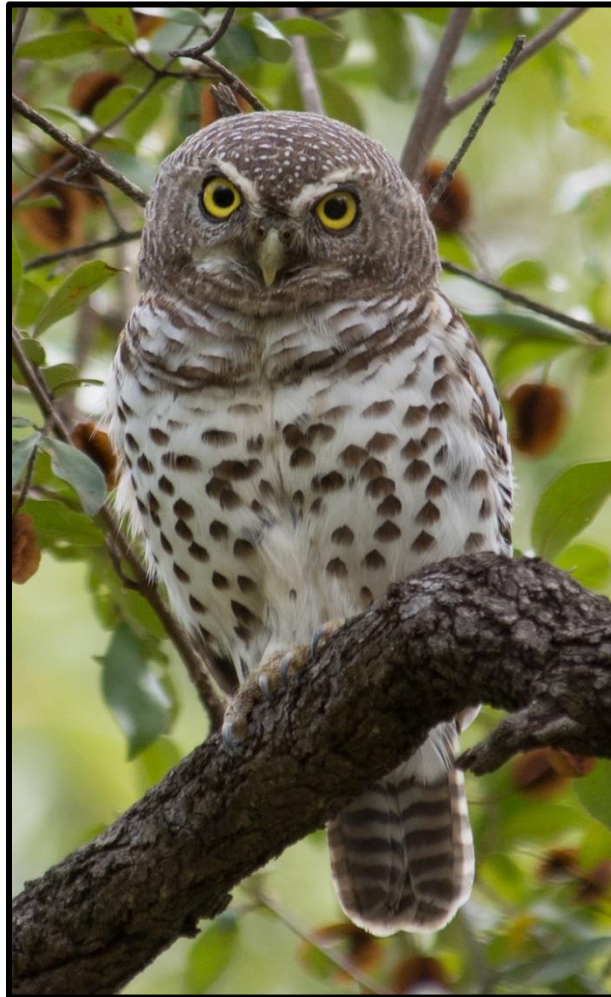
African Barred Owlet