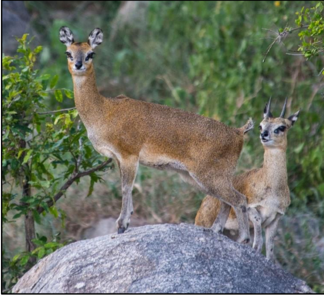
Klipspringer Pair by Gareth Robbins

After our collection at the airport, we packed the tour vehicle at our guesthouse in Kempton Park. We managed to squeeze in sightings of Red-headed Finches at the bird feeder and then finally made our way to the Kruger National Park. Along the way, we travelled through coal mining areas in the