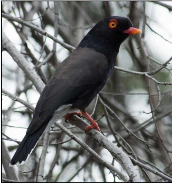
Retz's Helmetshrike

Eagle. We then travelled down to Lower Sabie Rest Camp and got a good close view of a very young male Lion sitting along the roadside, looking a bit lost. We tried to look for the other Lions, only managing to come across a large journey of Giraffes. We then had a relaxing brunch in the rest camp