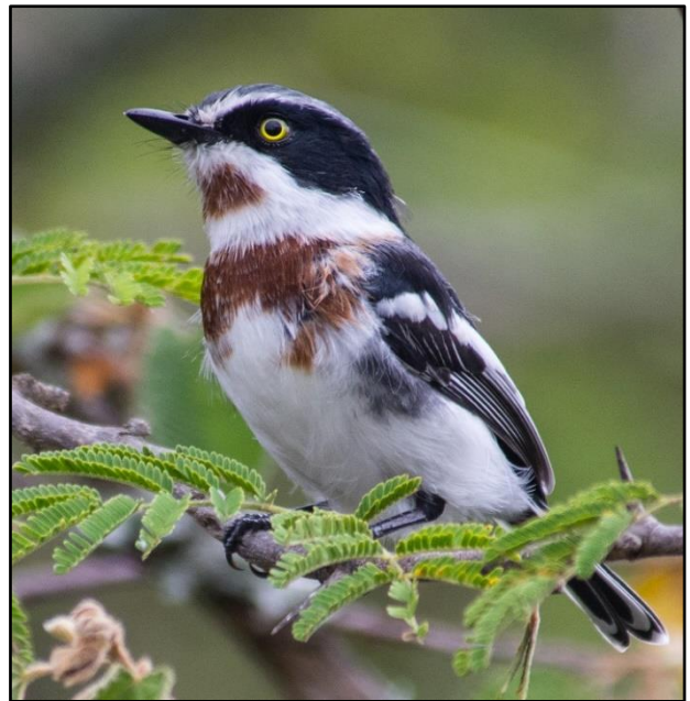
Female Chinspot Batis by Gareth Robbins

The rain had finally caught up with us; however, this did not deter us from heading out into the National Park. As the gates opened, we headed in an easterly direction, where we stopped for a bird party consisting of Southern Black Tit, Blue Waxbills and the beautiful Orange-breasted Bushshrike. Further down the road, some excellent spotting gave us views of a pair of Southern White-faced Owls and a couple of White-backed Vultures. We then continued south into an area where there were open grasslands. Here we saw a couple of Magpie Shrikes and Lilac-breasted Rollers. We stopped at a lookout overlooking the plains and again we had another bird party, consisting of Jameson's Firefinch, White-throated Robin-Chat, Dusky Indigobird, great looks at stunning African Green Pigeon and excellent close views of a Pearl-spotted Owlet. From the viewpoint, we also saw a couple of African Elephants, two White Rhinoceros and an African Fish