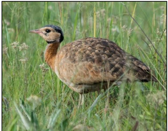
White-bellied Bustard by Gareth Robbins

We met Lucky, our expert guide in the Wakkerstroom area, at 6 AM sharp and drove to our first birding hotspot for the day. This was the town of Dirkiesdorp and here we hoped to see the White-bellied Bustard. We finally arrived at Dirkiesdorp and drove on some community farmland searching the area for the White-bellied Bustards. We saw good numbers of Red-capped Larks and Crowned Lapwings before finally finding three bustards sitting in the tall grass. We found another two White-bellied Bustards as we circled back, and we also managed to get some great close looks at a couple of Southern Bald Ibises. After a successful find we drove back to Wakkerstroom, spotting a couple of Yellow-billed Kites, Jackal Buzzards and two Oribi on the way.