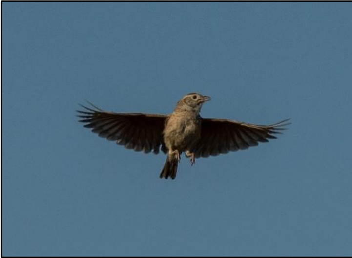
Eastern Clapper Lark

Park for the final time and made the long trip to Kimberley. During our drive, we passed through a large thunderstorm with lots of lightning, seeing a couple of Leopard Tortoises along the roadside enjoying the water. After the storm, we saw a Pale Chanting Goshawk and a Shaft-tailed Whydah. We finally arrived at our game lodge outside Kimberley, where we checked in and had a wonderful dinner,