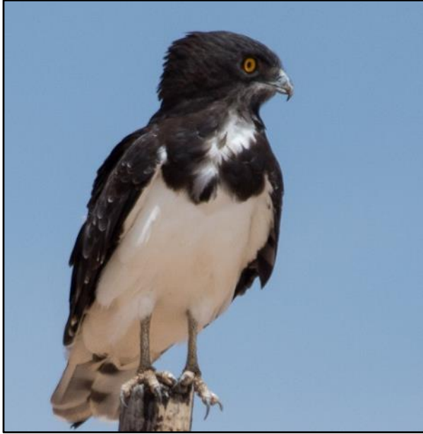
Black-chested Snake Eagle

We woke up to yet another wet and rainy morning, but this still did not deter us, and we hopped into the tour vehicle and made our way to the St Lucia Estuary. Along the way, we saw a couple of Red-