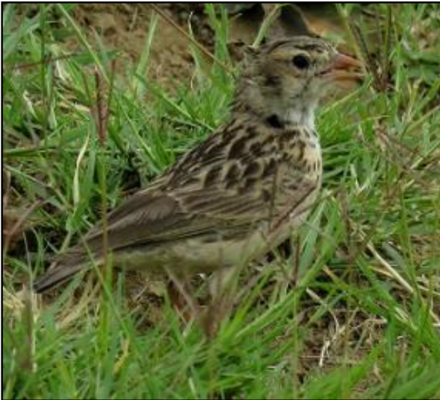
Botha's Lark