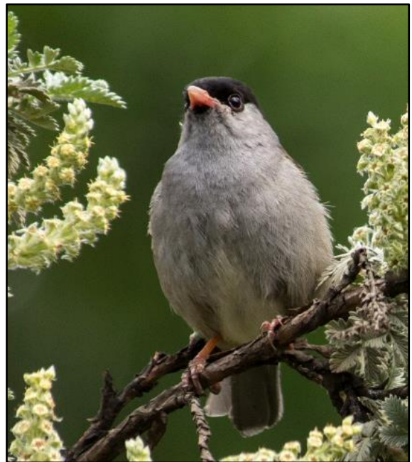
Bush Blackcap

We woke up to the call of a Purple-crested Turaco and packed our bags into the tour vehicle, at the same time having a look at a very vocal Olive Sunbird. We then drove to the Dlinza Aerial Board Walk, and as soon as we arrived we made our way up to the tower at the end of it. Once we got to the tower, an Eastern Bronze-naped Pigeon was posing for us across the valley. After some decent scope views, the bird finally flew to the other side of the valley. We also managed to see African Paradise Flycatcher and a Grey Cuckooshrike from the tower. We then headed back down and had a quick breakfast before walking in the forest. We started with a view of a Chorister Robin-Chat and with some local help, we were put onto two Spotted Ground Thrushes as they moved quietly along the leaf-covered forest floor. We walked a bit further down the trail, getting phenomenal views of a tiny Blue Duiker. We then walked to the bird blind, where we saw another Chorister Robin-Chat, and Tambourine and Lemon Doves before leaving the forest. We then took a drive to the Ongoye Forest, spotting a Black-chested Snake Eagle along the way. The forest had a lot of activity, ranging from White-eared Barbets to Black-bellied Starlings, and after some serious searching and almost calling it a day a Green Barbet finally landed close enough for us to eventually see the