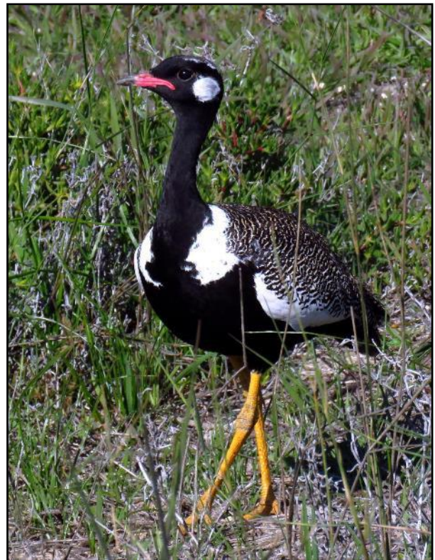
Male Southern Black Korhaan by Gareth Robbins

We continued through the park until we reached Seeberg lookout point; luckily managing to find a male Southern Black Korhaan walking in the sand near some Thatching Reed. We then visited a blind near the estuary, getting decent looks at Little Tern, White-fronted Plover, Eurasian Curlew, Common Whimbrel and many Grey Plovers. We circled back to another inland bird blind, where we saw a couple of Cape Shovelers, many Yellow-