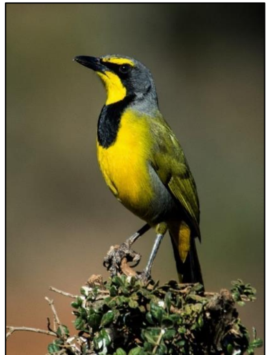
Bokmakierie by Gareth Robbins

Today we left before sunrise and made our way down to the town of Port Nolloth. We made it to the town and, thankfully, there was not a breath of wind and no cloud cover. We took a few interesting dirt tracks and positioned ourselves to try and get the Cape Long-billed Lark. After a long wait, we managed to hear one Cape Long-billed Lark call and then get a great view of two birds. We then continued a little bit further up the main road, where we stopped at another site and managed to get even better views of a Barlow's Lark. We then decided to head back to Springbok, knowing that the temperature would still be a bit cool. After arriving, we re-entered the Goegap Nature Reserve. This time around, the animals were scarcer than the day before, but the birdlife was better. After having a good look at two very inquisitive Karoo Eremomelas, we continued on the tourist track and stopped at a rocky outcrop. It was here that we heard the call of a Cinnamon-breasted Warbler; and with great excitement we raced up to the rocky outcrop, jumped out of the car and eventually got to see the bird sitting on top of a sharp rock. We managed to watch the bird and see how easily it jumps between all the rocks, making it rather difficult to locate if you don't understand the habits. We continued through the reserve and made our way back to lodge in time to enjoy a relaxing afternoon of birding in the gardens. Red-eyed Bulbuls and Orange River White-eyes were seen in the garden.