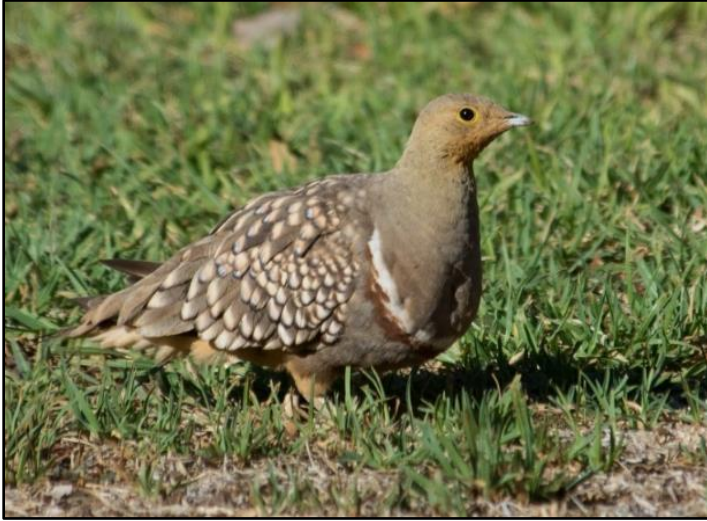
Namaqua Sandgrouse by Gareth Robbins

could see that there was activity, and we spent some time watching these birds flying in and out of the nest with building material. We drove around the town and got stunning views of Swallow-tailed Bee-eaters that were attracted to some beehives placed in an open field. We also saw around thirty Namaqua Sandgrouse feeding on the lush green lawns and got our first views of Pale-winged Starlings before making our way to Pofadder. This area is known for having a good variety of lark species, and the first