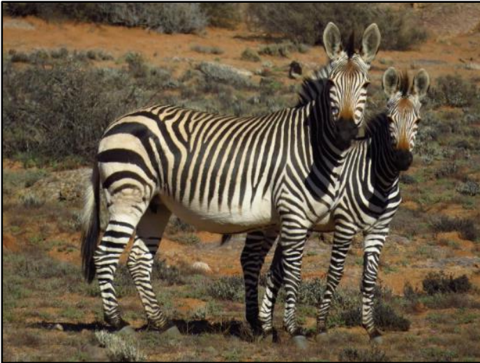
Hartman's Mountain Zebra

Today we left Calvinia after a typical full buffet Karoo breakfast. We made our way to Springbok via the Vanrhyn's Pass and the town of Vanryhnsdorp. We then made our way to Springbok, spotting a