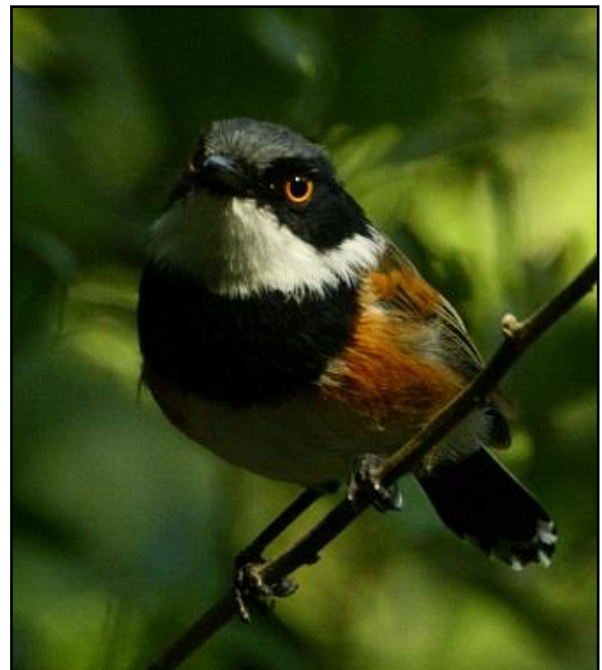
Male Cape Batis