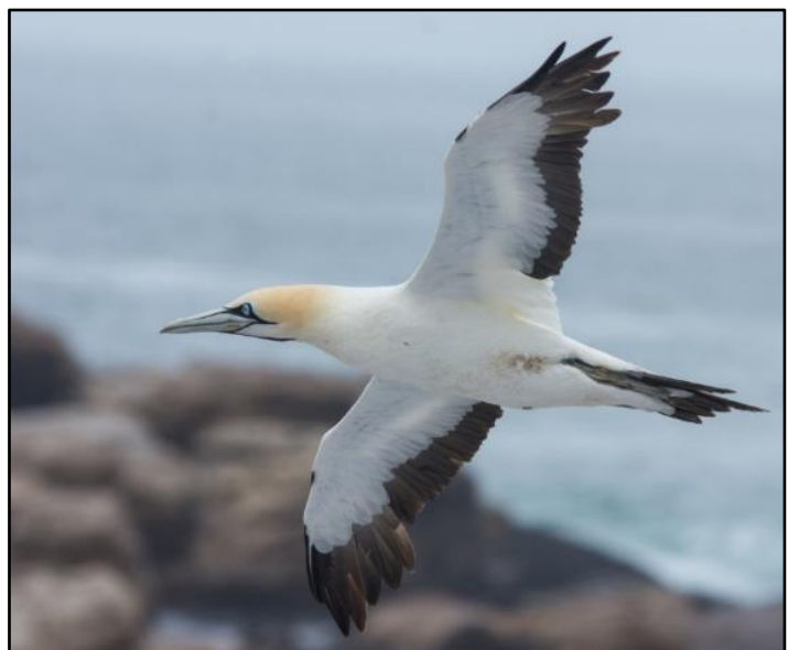
Cape Gannet

An hour before sunrise the next morning, we were already on the road to Brandvlei. Finally, as the lazy Karoo Sun rose, we started to bird. We tried one area to get brief looks at one Karoo Eremomela. Afterwards, we made it into the town of Brandvlei and took a few dirt roads. One dirt road produced excellent sightings of both the Karoo Long-billed and Red Lark species. We then continued with our drive, getting close looks at a pair of co-operative Namaqua Sandgrouse as well as our first look at a Tractrac Chat and a Dusky Sunbird. We stopped for a late breakfast and got some lovely views of a Pririt Batis and brief views of a Southern Black Korhaan. We then explored more of the area, getting views of Chat Flycatchers before we made the long drive back, getting a look at a Greater Kestrel and a couple of Karoo Chats along the way. After lunch and a short break, we headed back into Calvinia, visiting the Akkerendam Nature Reserve, but with no luck in finding any new species. So we drove