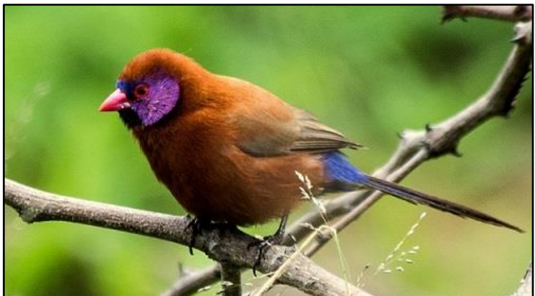
Violet-eared Waxbill by Gareth Robbins

Further along the way we got views of Lilac-breasted Roller, a bird not commonly seen in this area. We stopped near a wetland and here we saw an African Fish Eagle, African Jacana, Woodland Kingfisher, Red-billed Teal, Squacco Heron and plenty of Cattle Egrets perched on the dead trees. From the roadside, we also had a brief look at a Pearl-spotted Owlet and great looks at a Levillant's Cuckoo. We then started to get plenty of views of White-winged Widowbirds, as well as Pin-tailed Whydahs, Southern Masked Weavers, Black-throated Canaries, Shaft-tailed Whydah, Village Indigobirds, Long-tailed Paradise Whydah, Green-winged Pytilia, Blue Waxbills and the stunning Crimson-breasted Shrike! The only birds of prey we managed to see were a few more Amur Falcons, Common Buzzard and a Black-winged Kite feeding on a rat. Another interesting sighting was of a Black-headed Heron devouring a huge rat!