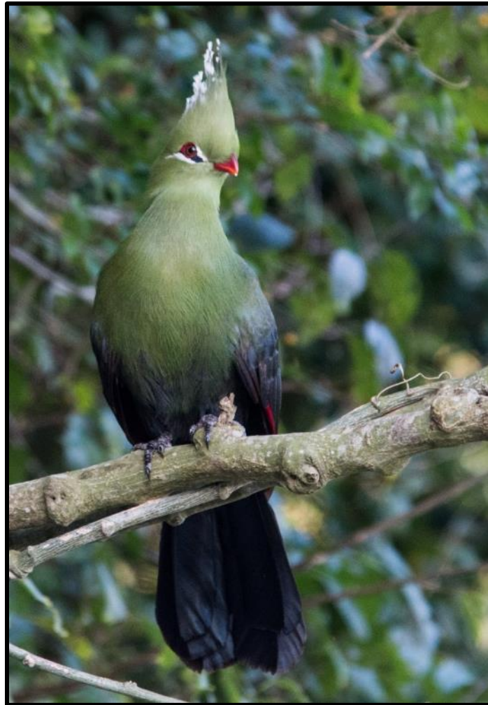
Livingstone's Turaco