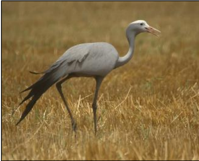
Blue Crane by Gareth Robbins

almost extinct Fynbos endemic, Bontebok! We also saw a couple of Cape Mountain Zebras, and at a small pool of water we found African Snipe, Marsh Sandpiper, Ruff and two small flocks of Namaqua Sandgrouse. We visited the garden area near the restaurant and found Cardinal Woodpeckers and some tame Cape Spurfowl. Suddenly, one of the guests spotted the bird we were really hoping to see, Knysna