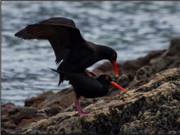
African Oystercatchers

National Park. We stopped for breakfast in Table View and had a great panoramic view of Table Mountain and Table Bay. We then drove onto the West Coast National Park and stopped at a small dam on the side of the road to have a look at a couple of African Swamphens and Common Moorhens.