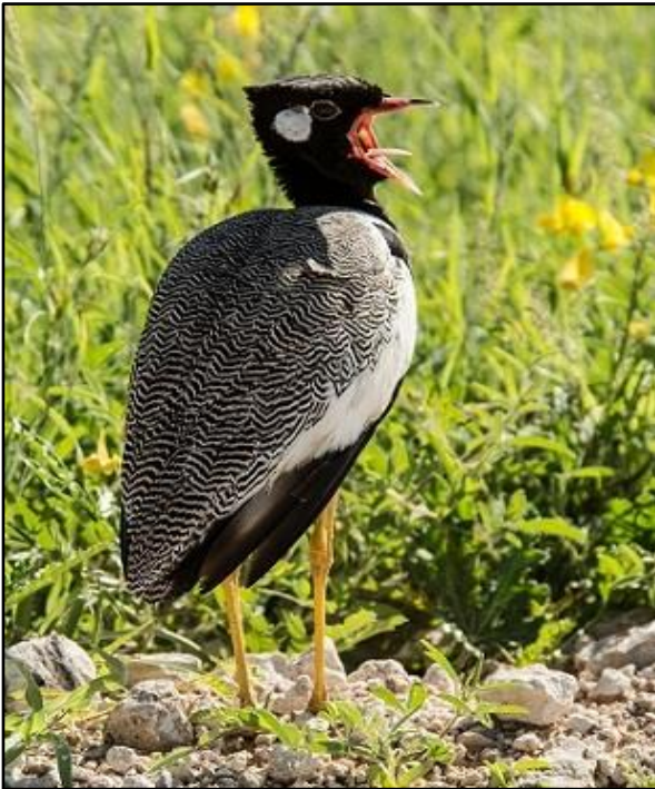
Northern Black Korhaan by Gareth Robbins

Today was the first full day of the South African Mega II Tour. We left our lodge an hour before sunrise to get the maximum amount of birding time in the Zaagkuil drift area. Once we were on the road