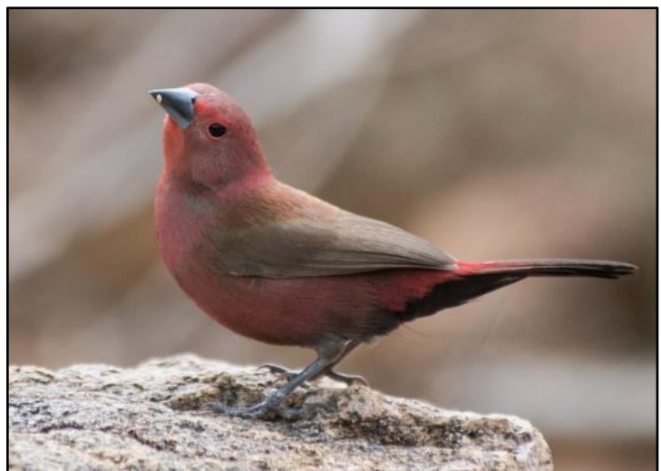
Jameson's Firefinch

We left before sunrise and made our way back along the National Highway towards Mkuze Game Reserve. As we neared the reserve, we noticed that there had been a decent amount of rain – and a few weeks before, most of the area had flooded. Along the way, we had seen a couple of Long-tailed Paradise Whydahs and a Brown-hooded Kingfisher. We finally arrived at the Western Gate of the Mkuze Game Reserve and stopped for breakfast at a camping site. While we enjoyed our packed breakfast, we saw Red-fronted Tinkerbirds, Bearded Scrub Robin, a family of four Cardinal Woodpeckers and a pair of Yellow-breasted Apalises. We then drove through the