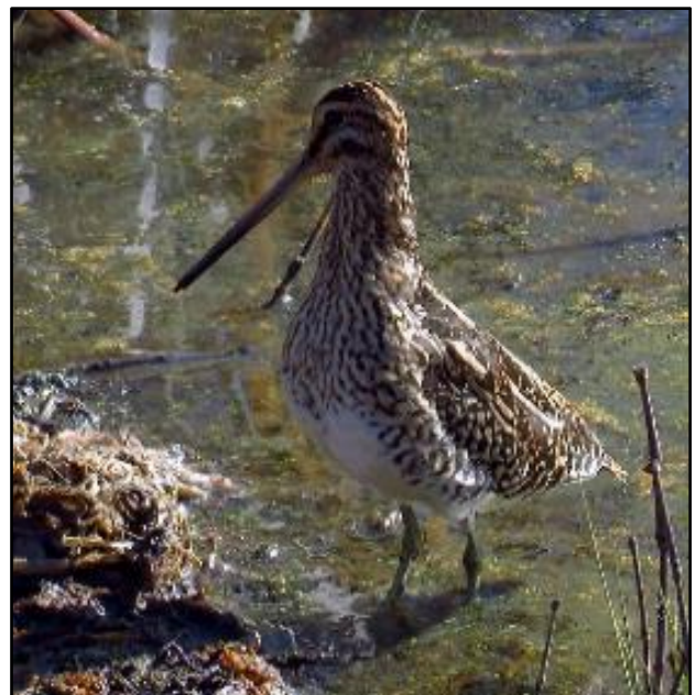
African Snipe by Gareth Robbins

Today, we left the lodge after sunrise and made our way to some farmlands outside the town of Wakkerstroom in search of Eastern Long-billed Lark. We had a few attempts before we finally saw one bird fly and land on a small rock before joining a couple more Eastern Long-billed Larks, where they called and displayed on the field right next to the road for all of us to see. We then drove down to the wetlands, and by this time the mist had burned off and the light was perfect. As soon as we got out of the car, we saw an African Snipe, Hottentot Teal and Little Bittern. We also managed to see Black Crake, Common Moorhen, Southern Red Bishop, Little Rush Warbler, African Marsh Harrier, Three-banded Plover, Yellow-billed Duck, Cape Shoveler, a male Giant Kingfisher and an African Harrier-Hawk sitting in a Willow Tree. We then left the wetlands to have one more delightful breakfast before packing the tour vehicle. As we were packing the vehicle, two Red-throated Wrynecks were spotted coming in and out of a hole in a tree! Our next destination was Hluhluwe, and on our way we passed the busy towns of Piet Retief and Pongola, spotting birds such as Amur Falcons, White Storks, Common Buzzards, White-backed Storks, European Rollers and Yellow-billed Kites along the way. We finally arrived at our lodge, hearing the call of Rudd's Apalis as we drove through the automated gate. After parking the vehicle, we met our lovely