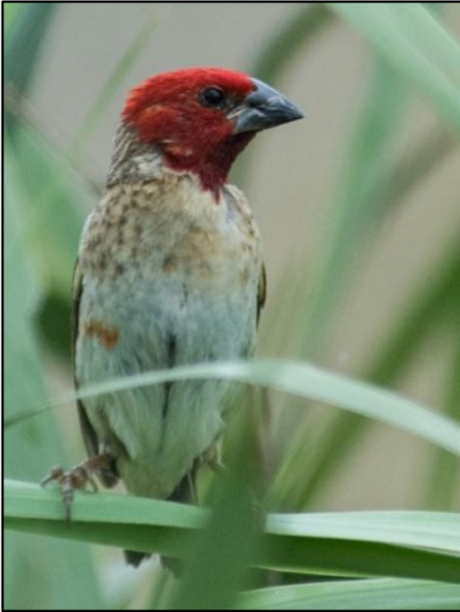
Red-headed Quelea

We hopped into the tour vehicle and made our way to the False Bay Park. It was still raining once we arrived in the park, so we drove down to the bay and commenced with some shorebird biding, where we saw Common Greenshank, White-fronted, Three-banded and Common Ringed Plovers, as well as