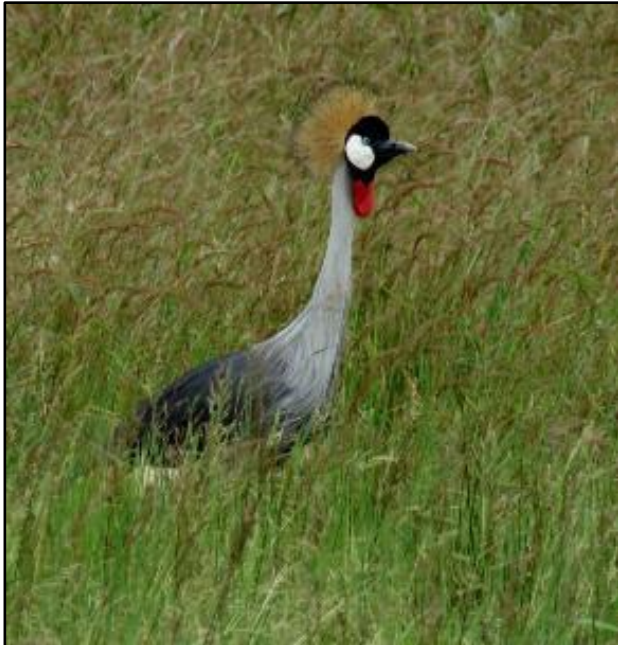
Grey Crowned Crane by Gareth Robbins

Just before we entered the reserve, we saw one Cape Parrot land in a dead tree. Through the spotting scope, we had decent looks at two birds before driving into the reserve to finally relocate the birds which had flown onto another dead tree. We then continued to the town of Howick to get some lunch