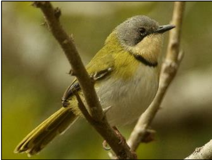
Rudd's Apalis

hosts and took a short break. When the temperature cooled down, we went out for a short walk. We managed to find Yellow-rumped Tinkerbird, Sombre and Yellow-bellied Greenbuls, African Paradise Flycatcher, White-throated Robin-Chat, Rudd's Apalis, Orange-breasted Bushshrike and a very vocal Grey Sunbird before calling it a day. Just as soon as we were about to start the checklist at the upstairs bar, we heard a Fiery-necked Nightjar calling and then we saw two individuals flying right past us.