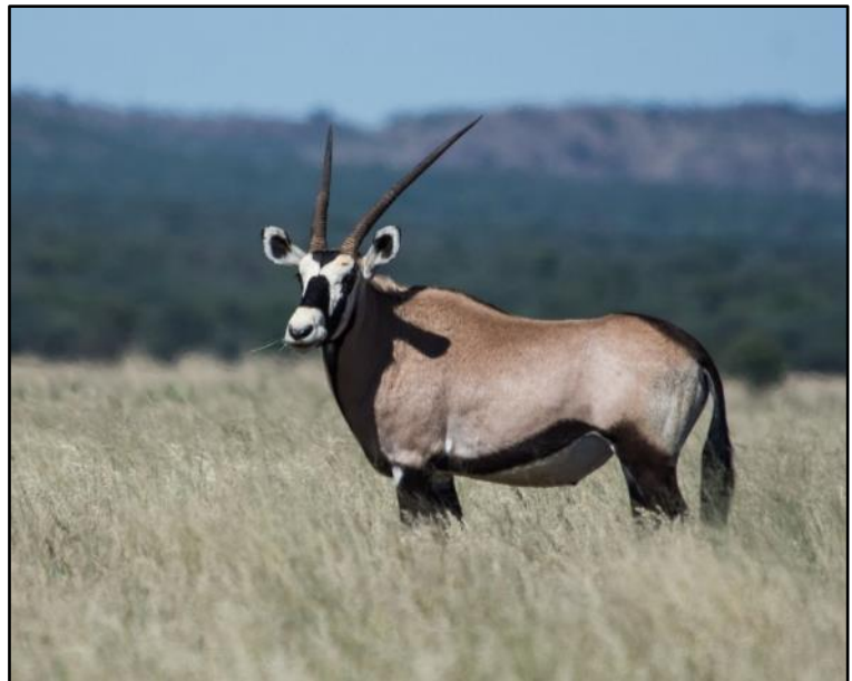
Gemsbok/Oryx

Today we left Augrabies Falls Lodge and made our way back to the national park for a couple of hours. We were very lucky this time, because from one viewpoint we managed to get great views of two Booted Eagles catching the thermals and one flying directly in line with us. We also managed to get views of a Purple Heron down by the water. We then turned around and headed back towards the lodge and stopped at the local picnic site, which had some birding activity ranging from Brubru, Pririt Batis, Cape Starlings, Bearded Woodpeckers and the noisy Namaqua Warbler. We left the National