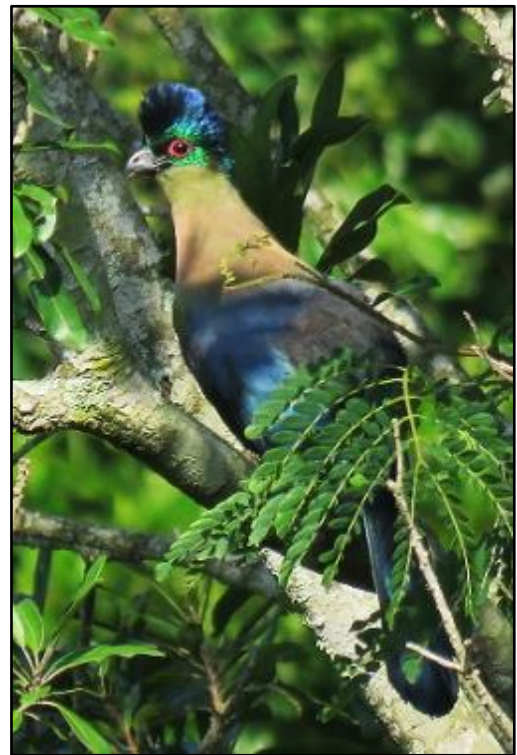
Purple-crested Turaco by Gareth Robbins