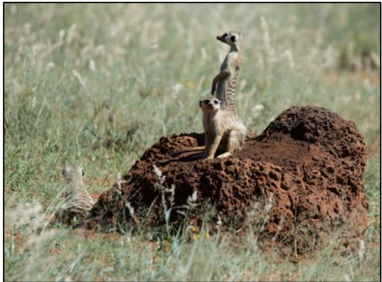
Meerkats

Towards the end of the day, we were still getting some great sightings, with another good look at a Secretarybird and a new bird in the form of Orange River Francolins hiding in the tall grass. One of the mammal highlights was watching a family of Meerkat on top of a Termite mound. We arrived back at the lodge, where some people took the time to take a bit of a rest; while others walked around the gardens, getting views of Black-faced and Violet-eared Waxbills, Bradfield's Swifts and a Golden-breasted Bunting.