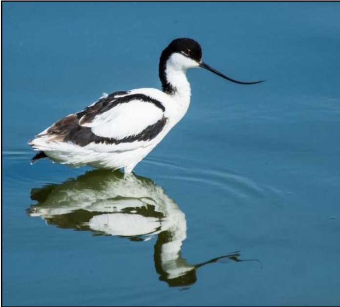
Pied Avocet

way to Calvinia. We had a couple of stops to make along the way, and the first stop was at Paleisheuwel, where we were very successful in finding a pair of Verreaux's Eagles soaring above us, as well as a couple of Layard's Warblers, Grey Tit and a Protea Canary! We then decided to visit the coastal fishing town of Lambert's Bay to have a look at the Cape Gannet Colony. En route to Lambert's Bay, we saw three very shy Bat-eared Foxes before finally arriving at the entrance to the colony. The Cape Gannet colony, run by Cape Nature, was alive with Cape Gannets of all shapes and sizes, and we were entertained by these elegant birds flying in and out of the colony. We were notified that there was a whale in the bay, and we all saw this large Southern Right Whale poking its head out the water