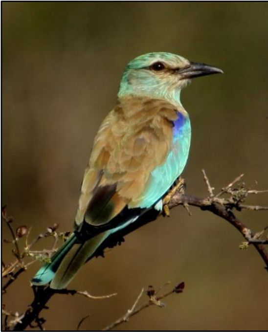
European Roller by Gareth Robbins

African Firefinches and a female Green Twinspot. We returned to our lodge with a lit fireplace and had a wonderful dinner!