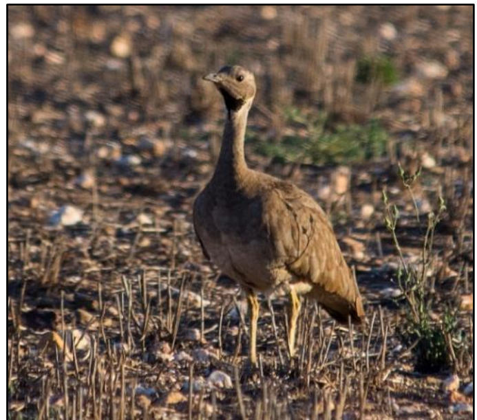
Karoo Korhaan by Gareth Robbins

a couple of Jackal Buzzards and a few Blue Cranes. The drive to the lodge lived up to expectations, producing sightings of birds such as Denham's Bustard, Large-billed Larks, Capped Wheatear and plenty of Blue Cranes. We finally arrived at our lodge situated next to the Breede River, and had a lovely evening at the restaurant inside the hotel. We left our lodge as the sun was rising and made our way up to some farmlands in the hope of finding some Blue Cranes and larks. As soon as we were about to get into the tour vehicle, we spotted a Southern Tchagra sitting in the bush right beside the vehicle. We finally arrived at the farmlands and it did not take us long to hear the whistling call of the Agulhas Long-billed Lark, which we then managed to get in the spotting scope. We then headed back to the lodge, stopping near some Bitter Aloes to look at Karoo Scrub Robins, Southern Double-collared Sunbirds and Cape Bulbuls. After a delicious breakfast, we packed the tour vehicle and made our way to De Hoop Nature Reserve. Along the way, we had plenty of close views of Blue Cranes and Large-billed Larks. After