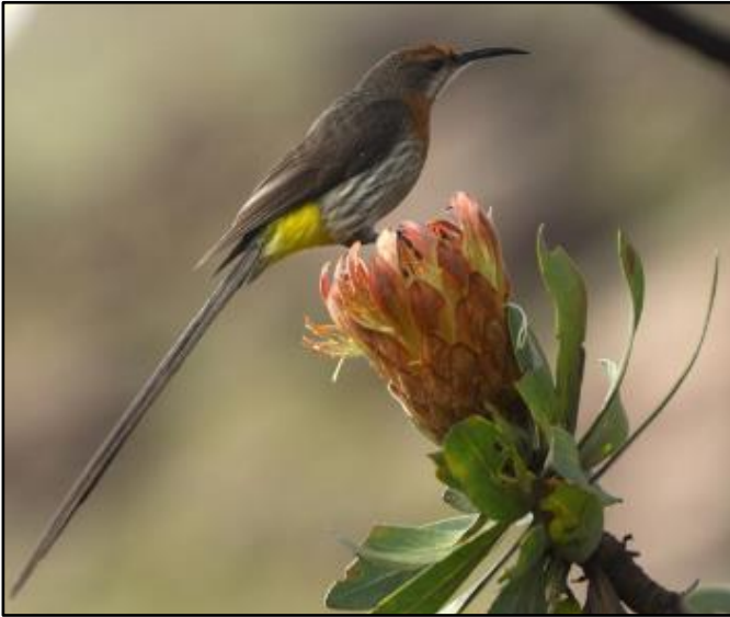
Gurney's Sugarbird

bird before it was mobbed by a White-eared Barbet. A little further down the road, we came across a Zululand Dwarf Chameleon, as well as a Martial Eagle and a vocal Crowned Eagle before driving to our next lodge, nestled at the foot of the Drakensberg Mountains.