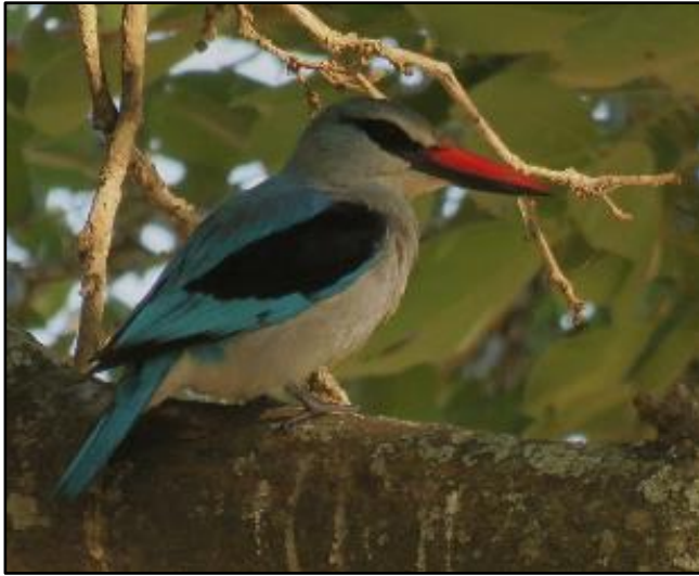
Woodland Kingfisher

White-faced Whistling Ducks, Black-winged Pratincoles, Reed Cormorants, and Wood Sandpiper, as well as Blue-cheeked Bee-eaters and a Giant Kingfisher. We then visited another dirt road and here we had brief looks at a Barred Wren-Warbler and Marico and White-bellied Sunbirds. We also had good