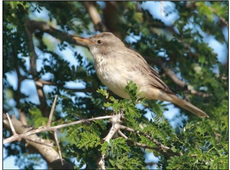
Olive-tree Warbler by David Hoddinott

Our two full days in Kruger were extremely successful. Some of our star sightings included Knob-billed Duck, lovely African Pygmy Goose, coveys of Natal Spurfowl, a splendid male Harlequin Quail, Black and Saddle-billed Storks, scope views of White-backed Night Heron, a cracking Dwarf Bittern, Goliath Heron, Hooded, White-headed and Lappet-faced Vultures, majestic Bateleur, African Hawk-Eagle, Red-crested Korhaan, superb Lesser Moorhen, Common Buttonquail, White-crowned Lapwing, Mourning Collared Dove, African Green Pigeon, handsome Purple-crested Turaco, a bevy of cuckoos – including Levillant's, African and Common, Western Barn Owl, Purple Roller, Woodland, African Pygmy and Giant Kingfishers, White-fronted and stunning Southern Carmine Bee-eaters, Common Scimitarbill, Trumpeter Hornbill, Black-collared and Crested Barbets, Lesser Honeyguide, Bearded Woodpecker, spectacular Gorgeous Bushshrike, Brubru, White-crested and Retz's Helmetshrikes, a stunning male Eurasian Golden Oriole, Monotonous Lark calling at several sites, Mosque Swallow, elusive Olive-tree Warbler, Stierling's Wren-Warbler, Greater Blue-eared and