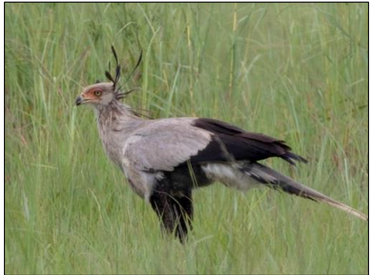
Secretarybird by Mel Senac

From Kruger, we continued south to the Highveld grasslands of Wakkerstroom, an endemic haven. This was another treat for our guests, as we stayed in palatial accommodation and enjoyed delicious meals. The birding remained top-draw, and we notched up White-backed Duck, Southern Pochard, elusive Coqui and Red-winged Francolins, Common Quail, stunning Southern Bald Ibis, several Little Bittern, highly sought-after Secretarybird, Black Sparrowhawk, vagrant Spotted Crake, Denham's Bustard, White-bellied and Blue Korhaans, Grey Crowned and Blue Cranes, Black-winged Lapwing, African Snipe, Red-throated Wryneck, Greater Kestrel, Amur and a Red-footed