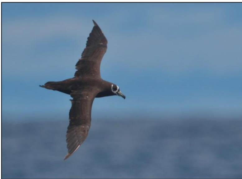
Spectacled Petrel by David Hoddinott

The next morning, we set out on a Cape Pelagic seabird trip. It was a superb day, and we notched up African Penguin, Wilson's Storm Petrel, Black-browed, Shy, Atlantic Yellow-nosed and Indian Yellow-nosed Albatrosses, European Storm Petrel, Southern Giant Petrel, rare Spectacled Petrel, Cory's, Sooty,