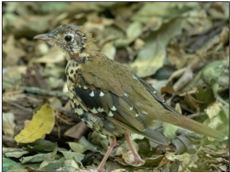
Spotted Ground Thrush by Mel Senac

Excitement mounted the next day for the fabulous day trip up Sani Pass and into Lesotho. Here, we notched up a slew of new species, including many highly sought-after ones. Great birds included coveys of Grey-winged Francolin, huge Bearded Vulture, shy Half-collared Kingfisher, Ground Woodpecker, Lanner Falcon, cracking Drakensberg Rockjumper, Fairy Flycatcher, Grey Tit, Large-billed Lark, Barratt's Warbler seen walking under a hedge, Layard's Warbler, Gurney's Sugarbird, Cape and Sentinel Rock Thrushes, Buff-streaked Chat, Sicklewinged Chat, Mountain Wheatear, Familiar Chat, Malachite and Greater Double-collared Sunbirds, Yellow Bishop, Sweet Waxbill, Mountain Pipit, Drakensberg Siskin, Yellow Canary and Black-headed Canary, which is rarely seen in this area.