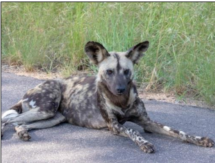
African Wild Dog by Mel Senac

Burchell's Starlings, Yellow-billed Oxpecker, White-throated and White-browed Robin-Chats, Scarlet-chested and Marico Sunbirds, splendid Red-headed Weaver and Cinnamon-breasted Bunting.