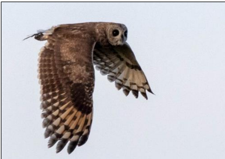
Marsh Owl by Mel Senac

From the highlands, we dropped back down into the lowlands, to the bushveld-rich Mkuzi area, which supports a staggering diversity of birds for its size, over 430 species. En route we stopped off at Pongola Nature Reserve, which provided us with some nice sightings including a Corncrake, Rufous-winged and Desert Cisticolas and Yellow-throated