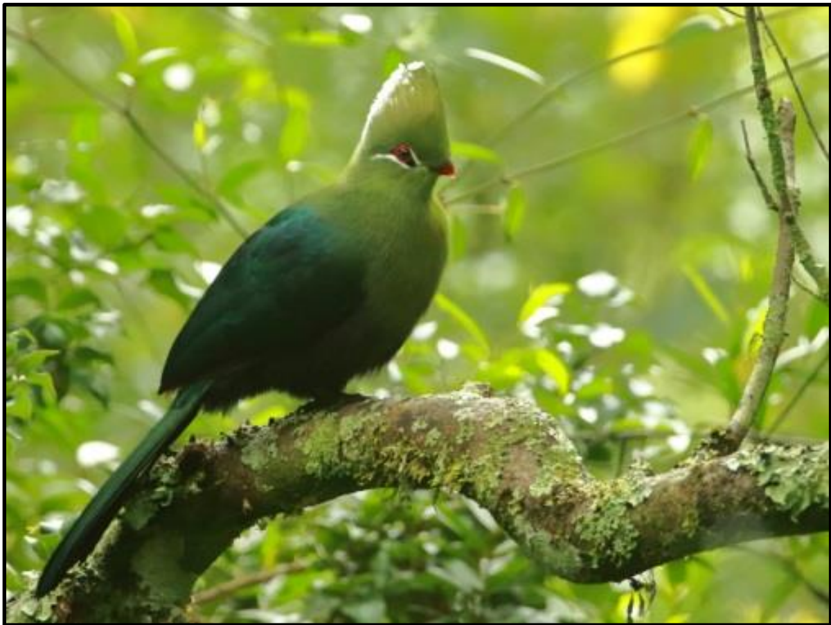
Knysna Turaco