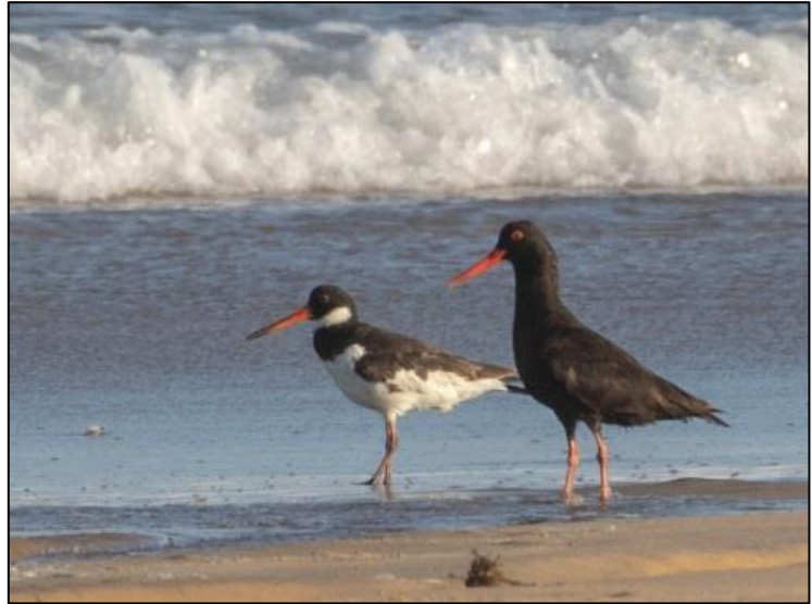
Eurasian and African Black Oystercatchers by Mel Senac

The forest and estuary of St Lucia and open areas at Cape Vidal once again produced the goods. Here, we notched up Black-chested and, after a concerted effort, Southern Banded Snake Eagles, the elusive Buff-spotted Flufftail, Water Thick-knee, vagrant Eurasian Oystercatcher, Lesser Crested Tern, Tambourine Dove, super Livingstone's Turaco, African Wood Owl, stunning male Narina Trogon, Brown-hooded Kingfisher, White-eared Barbet, brief Scaly-throated Honeyguide, Woodward's Batis, Black-throated Wattle-eye, Square-tailed Drongo, Eastern Nicator, African Yellow White-eye, Black-bellied Starling, Brown Scrub Robin, Red-capped Robin-Chat, Purple-banded Sunbird, Eastern Golden and Brown-throated Weavers and lovely Grey Waxbill.