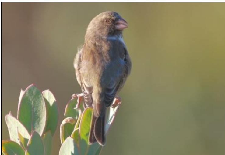
Protea Canary

Being based in Ceres for two nights gave us the opportunity to explore the Karoo. Our day in this unique habitat ensured a bunch of new species for our list, and we found several Pale Chanting Goshawk, Karoo Korhaan, the shy Red-chested Flufftail, Pririt Batis, Namaqua Warbler, Rufous-eared Warbler, rock-hopping Cinnamon-breasted Warbler, Karoo Eremomela, Karoo and Tractrac Chats, Capped Wheatear and Dusky Sunbird. On our final morning, we notched up a splendid Protea Canary – a tricky endemic,