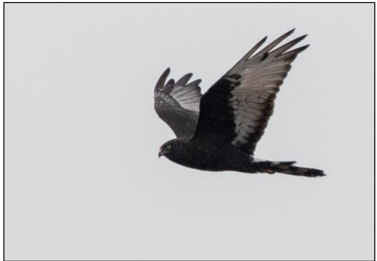
Black Harrier

Leaving Cape Town the following morning, we made our way to West Coast National Park, where we found dozens of Common Ostrich, Greater Flamingo, splendid Black Harrier, striking Southern Black Korhaan, a host of waders including Chestnut-banded Plover, Bar-tailed Godwit, Ruddy Turnstone and Red Knot, plus Cape Penduline Tit, Karoo Lark and Karoo Scrub Robin. Continuing towards Ceres, we stopped at Velddrift, where we added Black-necked Grebe and Caspian Tern. A little further on, we were delighted to find Grey-backed Sparrow-Lark and, around Ceres, both African Black Duck and Booted Eagle.