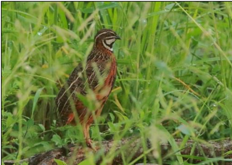
Harlequin Quail by David Hoddinott

there was more activity throughout the day, and we enjoyed some tremendous birding. Some of our highlights today included sightings of Black Heron, two African Crakes crossing the road, African Wattled Lapwing, a large flock of Black-winged Pratincole, splendid Great Spotted Cuckoo – an adult and juvenile, superb calling Black Cuckoo, Pearl-spotted Owlet, Blue-cheeked Bee-eater, Southern Red-billed and Southern Yellow-billed Hornbills, spectacular Crimson-breasted Shrike, Lesser Grey Shrike,