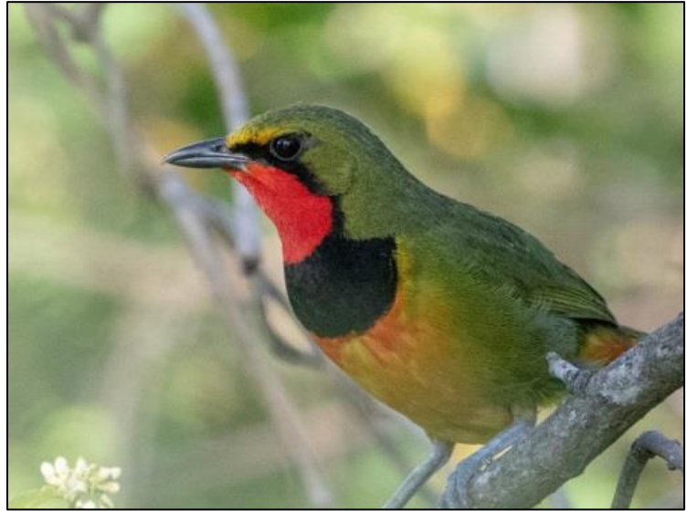
Gorgeous Bushshrike by Mel Senac

This incredible tour started off in Johannesburg, where we all met up at our comfortable guesthouse. Over a delicious dinner, we discussed the plans for the following day. The late summer rainfall in South Africa this year helped us a great deal throughout this tour, as most species were still in breeding mode and thus very vocal, when normally they would already be post-breeding and not very responsive. A number of overcast days, in what are normally very hot areas at this time of year, were an added bonus! We departed early the next morning for a day trip to the fabulous birding area around Zaagkuilsdrift. Arriving after a recent shower of rain, and with overcast conditions keeping it cooler,